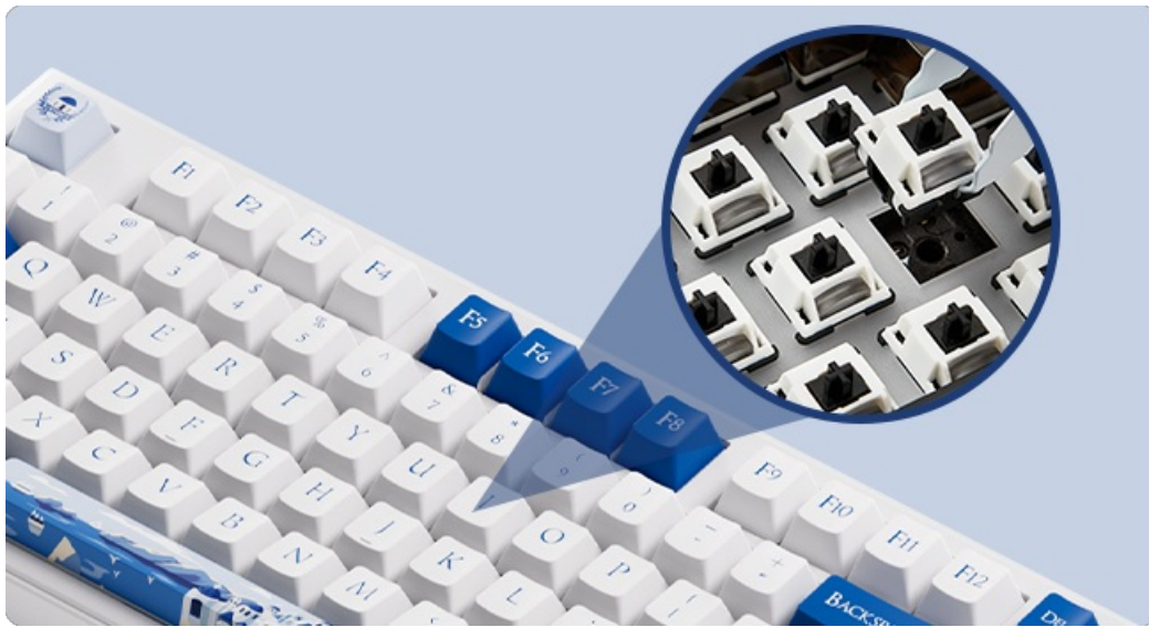
Image: A close-up view of the hot-swappable sockets on the keyboard's PCB.