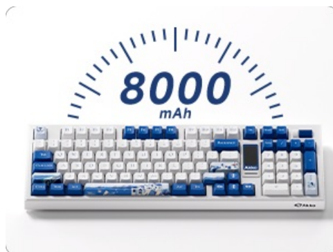
Image: An illustration highlighting the 8000mAh battery capacity of the keyboard.

The keyboard is equipped with an 8000mAh battery and supports 2A fast charging, which is up to 4 times faster than standard keyboards. Connect the USB-C cable to charge the device.