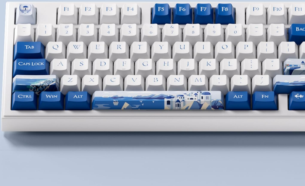
Image: The Akko 5098B keyboard demonstrating its triple mode connectivity: USB Type-C, 2.4GHz wireless, and Bluetooth.