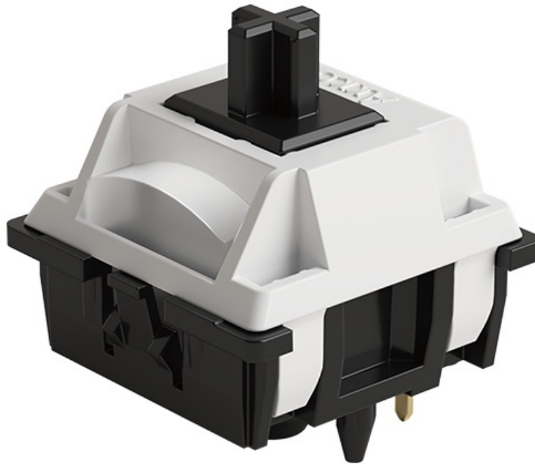
Image: A close-up view of the Piano Pre-Lubed mechanical switch.