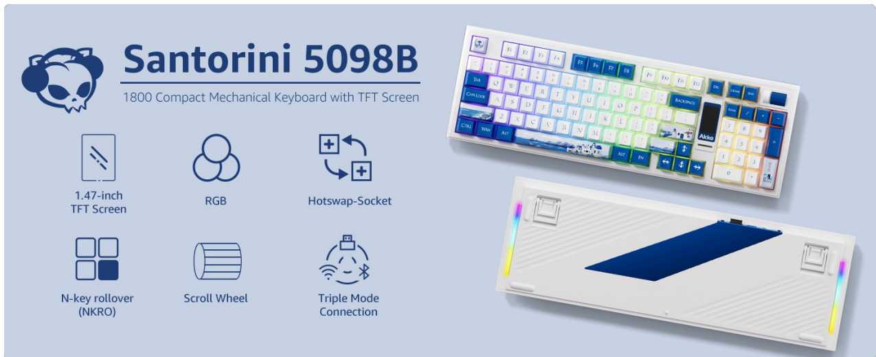
Image: Overview of the Akko 5098B Santorini keyboard highlighting its 1800 compact layout, 1.47-inch TFT screen, RGB, hot-swappable sockets, N-key rollover, scroll wheel, and triple mode connection.

The Akko 5098B Santorini Wireless Mechanical Gaming Keyboard is designed with an 1800 compact layout, featuring a number pad and a unique Santorini theme. It incorporates a 1.47-inch TFT LCD screen, hot-swappable switches, RGB lighting, and a gasket-mounted structure for a comfortable typing experience. This manual provides instructions for setting up, operating, and maintaining your keyboard.