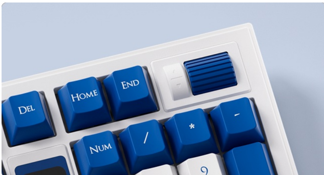
Image: A detailed view of the encoder scroll wheel on the Akko 5098B keyboard, used for various controls.