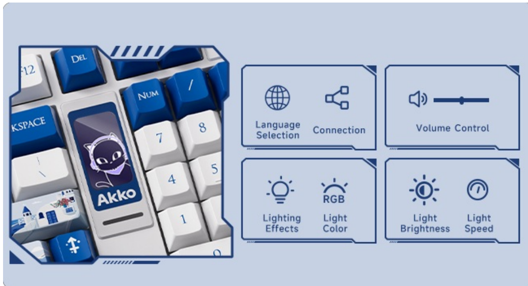
Image: A close-up of the TFT LCD screen on the Akko 5098B keyboard, illustrating its capabilities for language selection, connection status, volume control, RGB lighting effects, color, brightness, and speed adjustments.