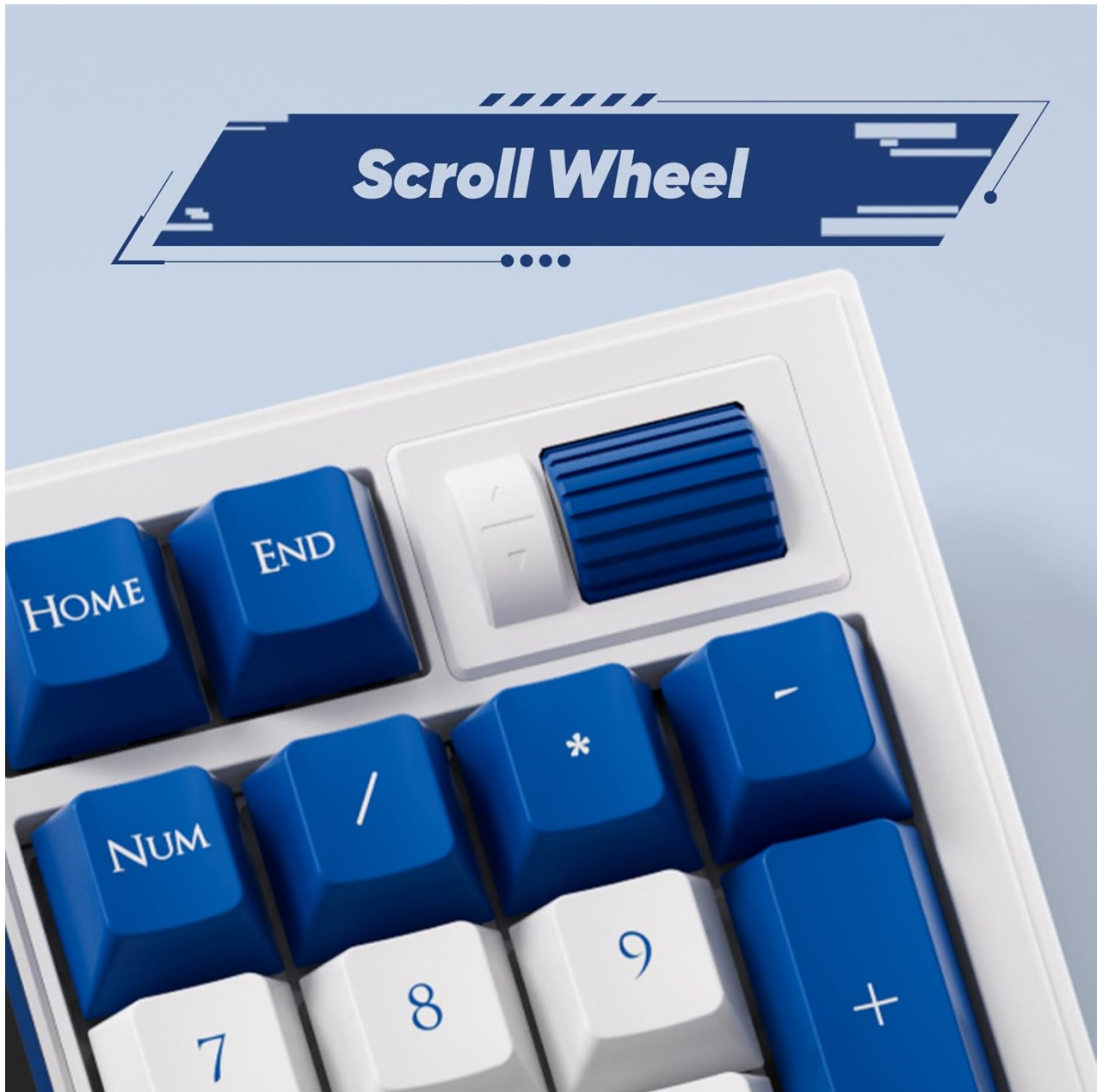
Image: The Akko 5098B keyboard showcasing its customizable RGB backlighting.

The keyboard features south-facing RGB lighting, offering vibrant and customizable illumination. The RGB effects can be controlled via the LCD screen or the Akko Cloud Driver software. An RGB bar is also present below the LCD screen for additional visual flair.