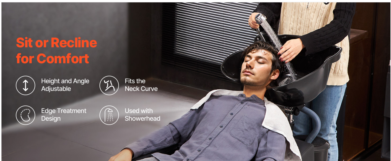
Figure 4.1: Adjusting the height and angle for comfortable use.

Your browser does not support the video tag.