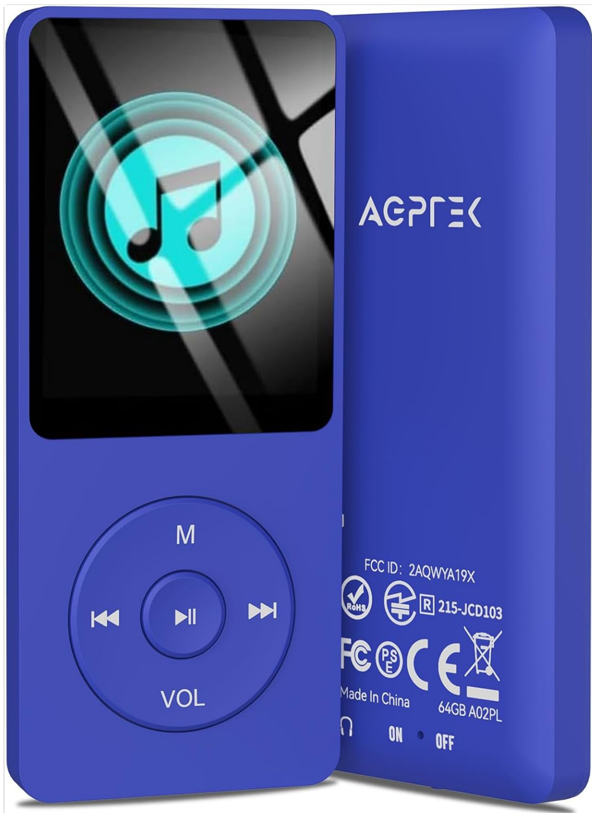
Image: Front and back view of the AGPTEK A02PL MP3 Player in deep blue, highlighting its compact design and button layout.