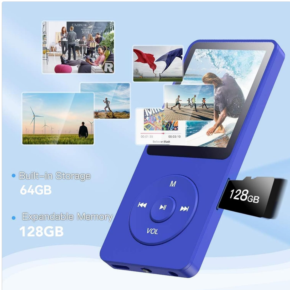
Image: The MP3 player's display showing various music playback modes and folder playback options.