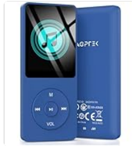
Image: The AGPTEK A02PL MP3 player connected to a car's audio system using an AUX cable.

You can connect your MP3 player to a car's audio system using an AUX cable (included). Plug one end into the MP3 player's headphone jack and the other into your car's AUX input.