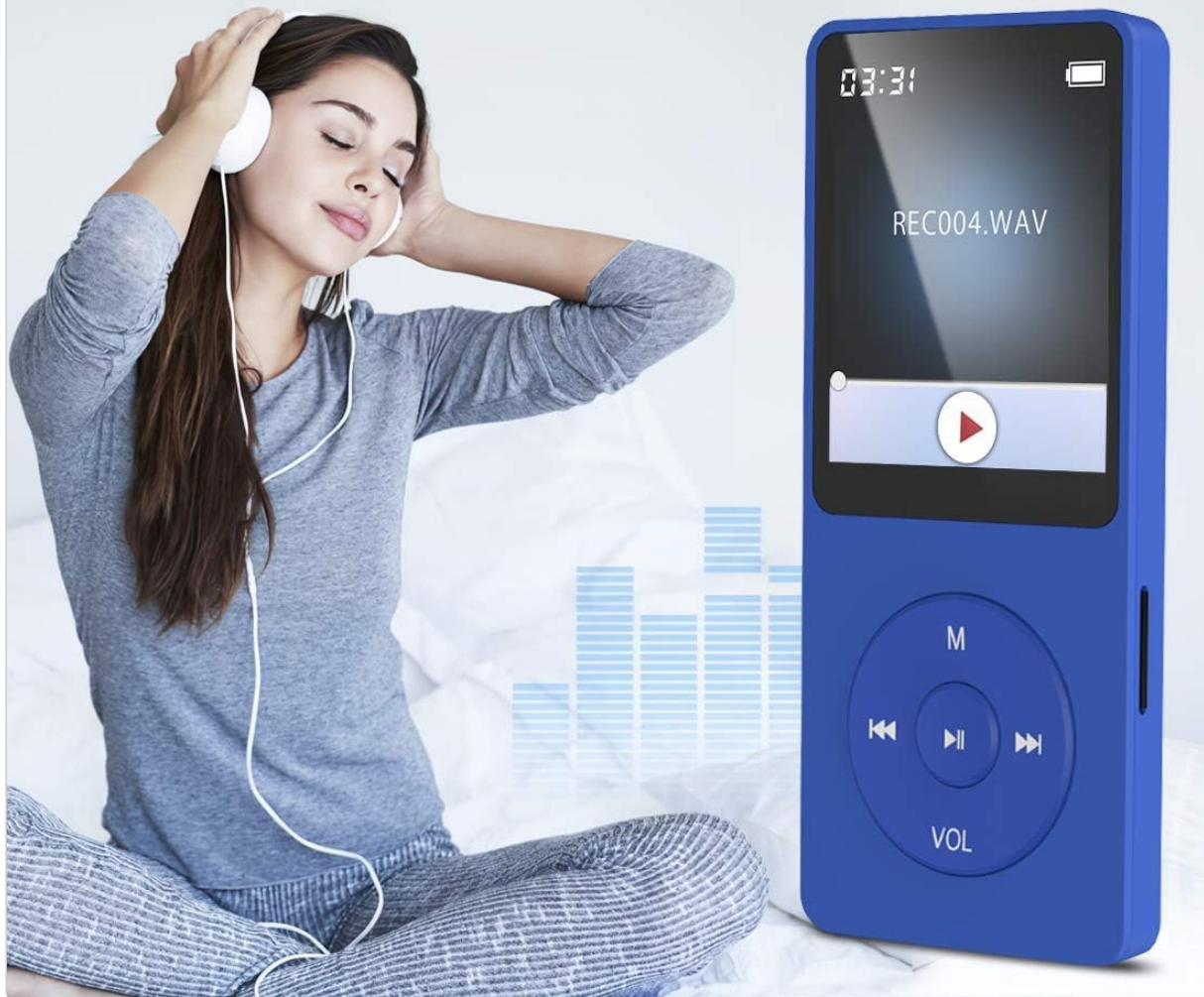
Image: A person listening to FM radio using the AGPTEK A02PL MP3 player with wired headphones.