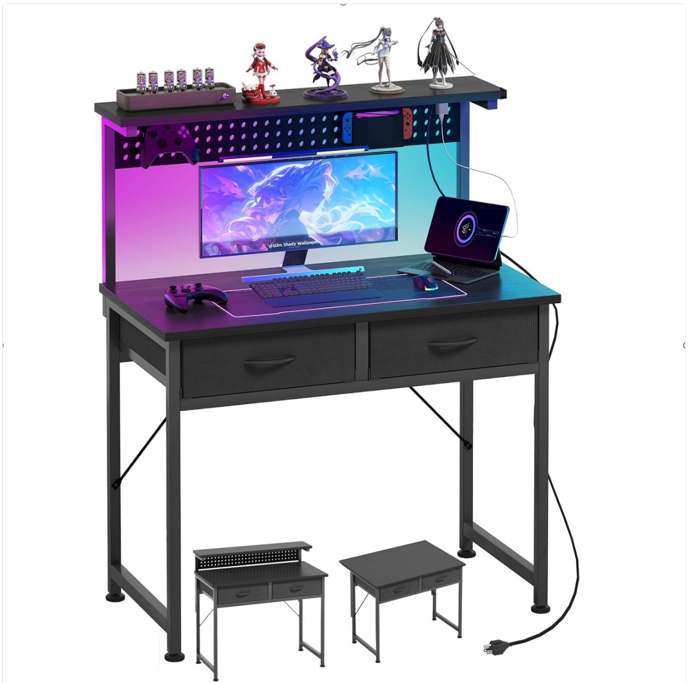
Figure 2.1: Overview of the Flrrtenv Computer Desk, showing its main components including the pegboard, monitor stand, desktop, and fabric drawers.