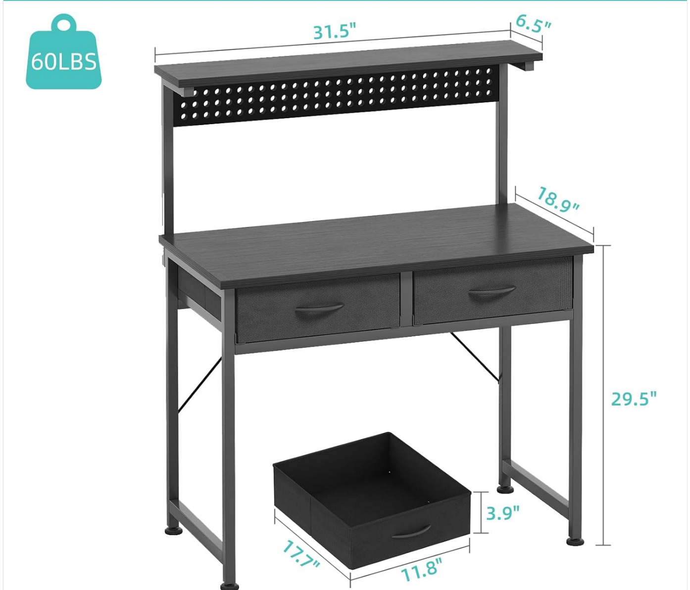
Figure 3.1: Product dimensions, useful for planning placement and assembly steps.