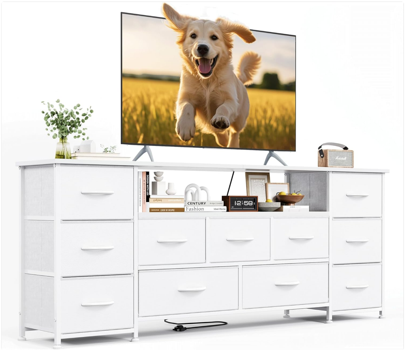
This image displays the Vermess 63-inch wide dresser in white, featuring 11 fabric drawers and a central open shelf designed to hold a television. The dresser is shown in a bedroom setting.