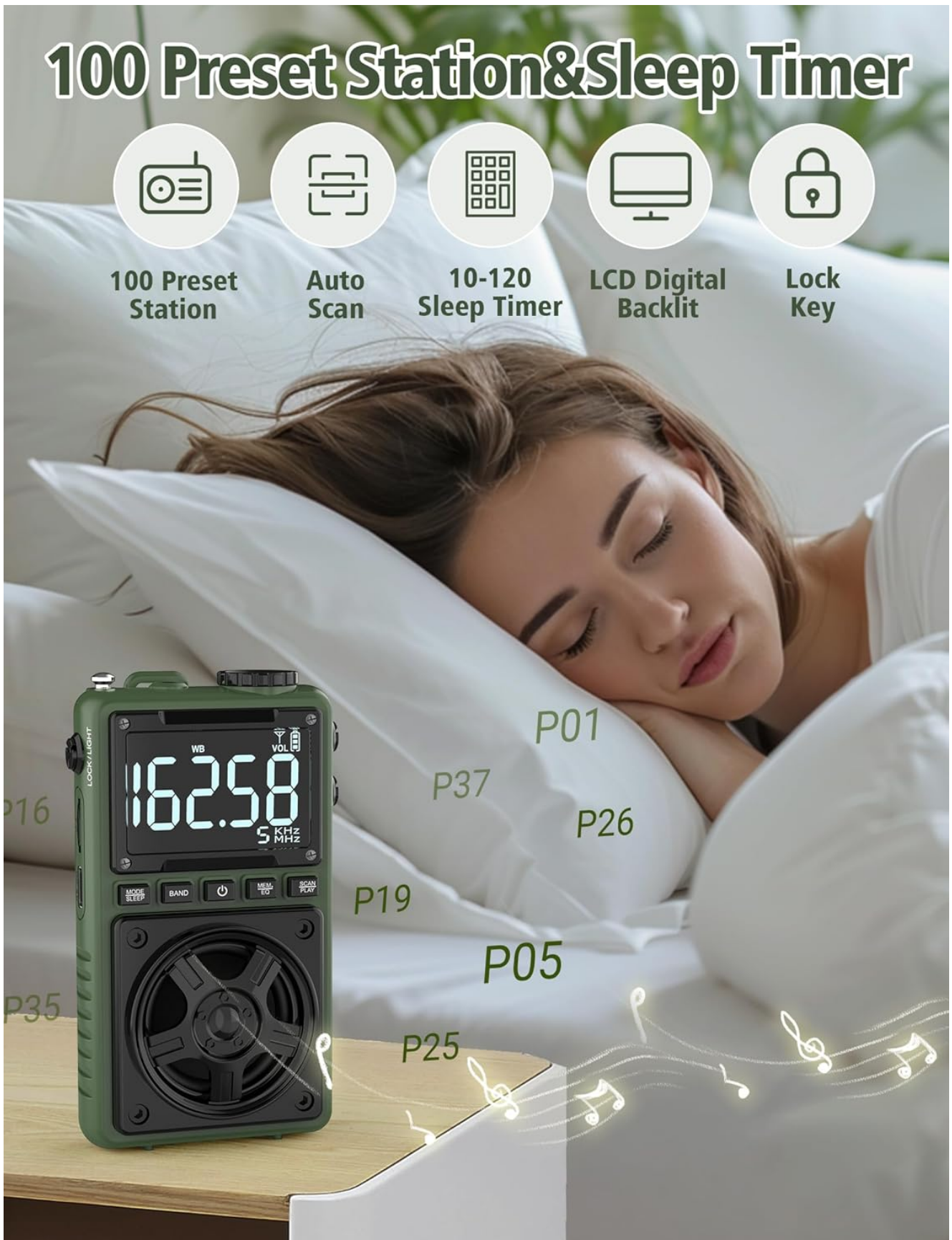
The radio displaying a preset station, indicating its capability for 100 presets and a sleep timer function.