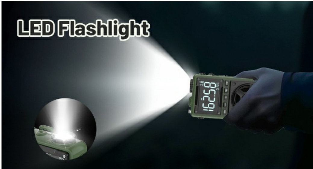
The radio's top-mounted LED flashlight illuminating a dark area.