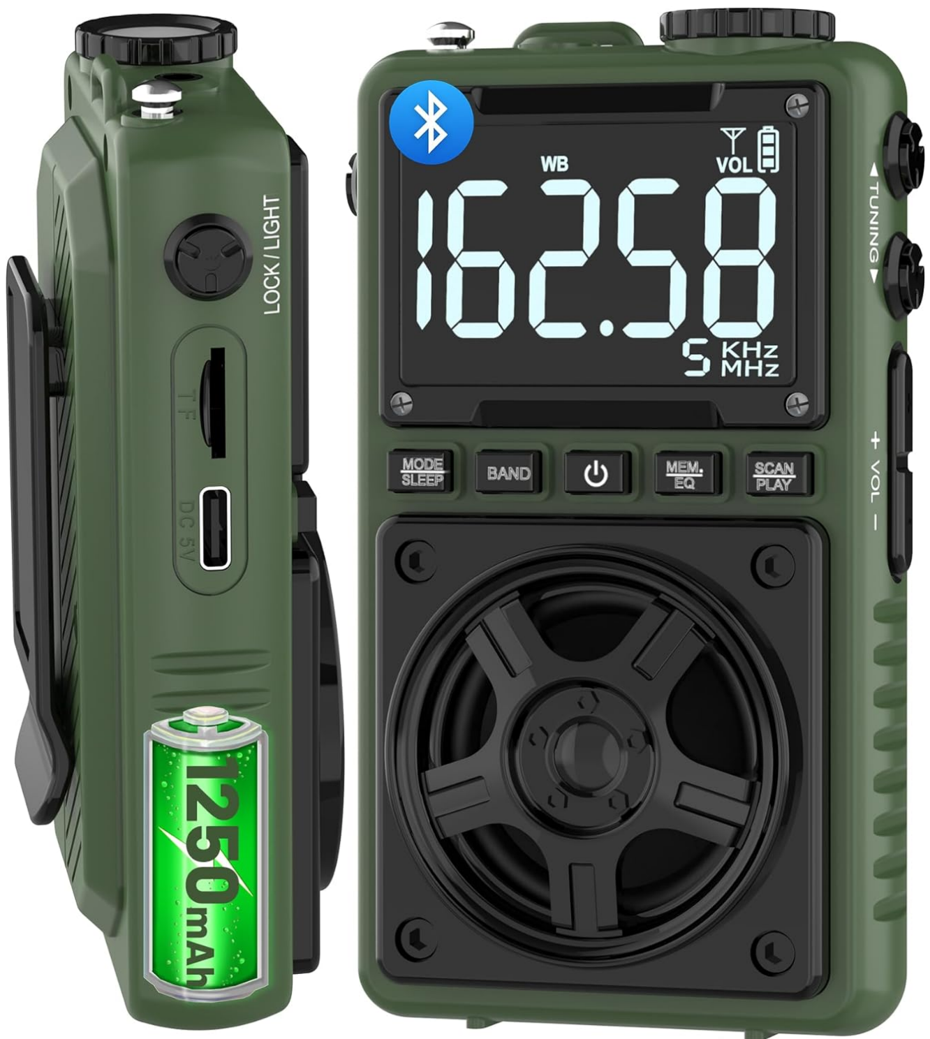
Front and side view of the Jazmm Portable Radio, highlighting its compact design, digital display, speaker, and side ports.