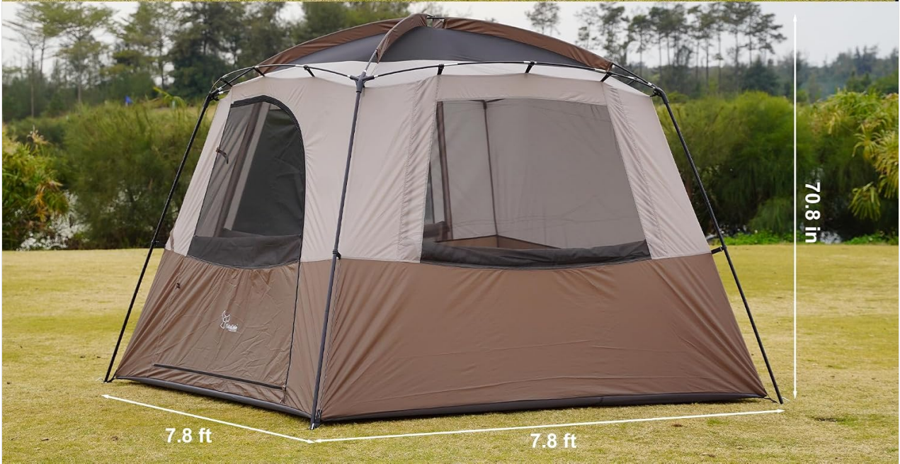
Image: Tent dimensions for setup planning.