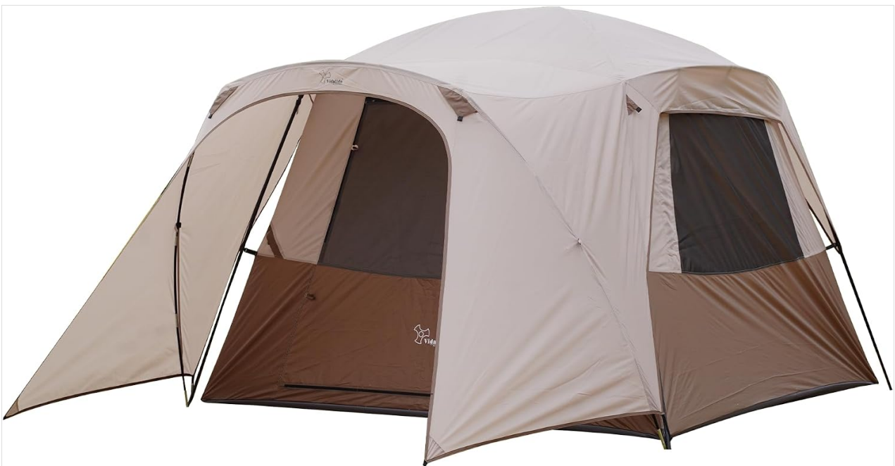
Image: The Vidalido 3-4 Person Tent, Model Shanying, fully assembled in an outdoor setting.

This manual provides detailed instructions for the assembly, use, and care of your Vidalido 3-4 Person Tent, Model Shanying. Designed for outdoor camping and hiking, this tent offers comfort and protection for 3 to 4 individuals. Key features include a mesh door, two large mesh windows, and a double-layer waterproof design for enhanced durability and ventilation.