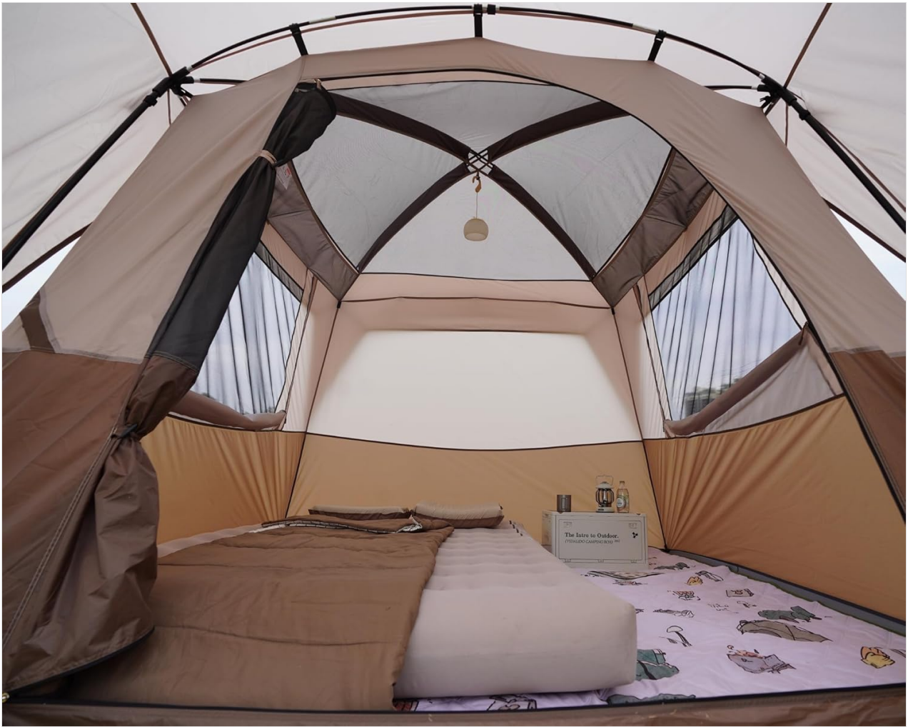
Image: Interior view showcasing the spaciousness and mesh windows.