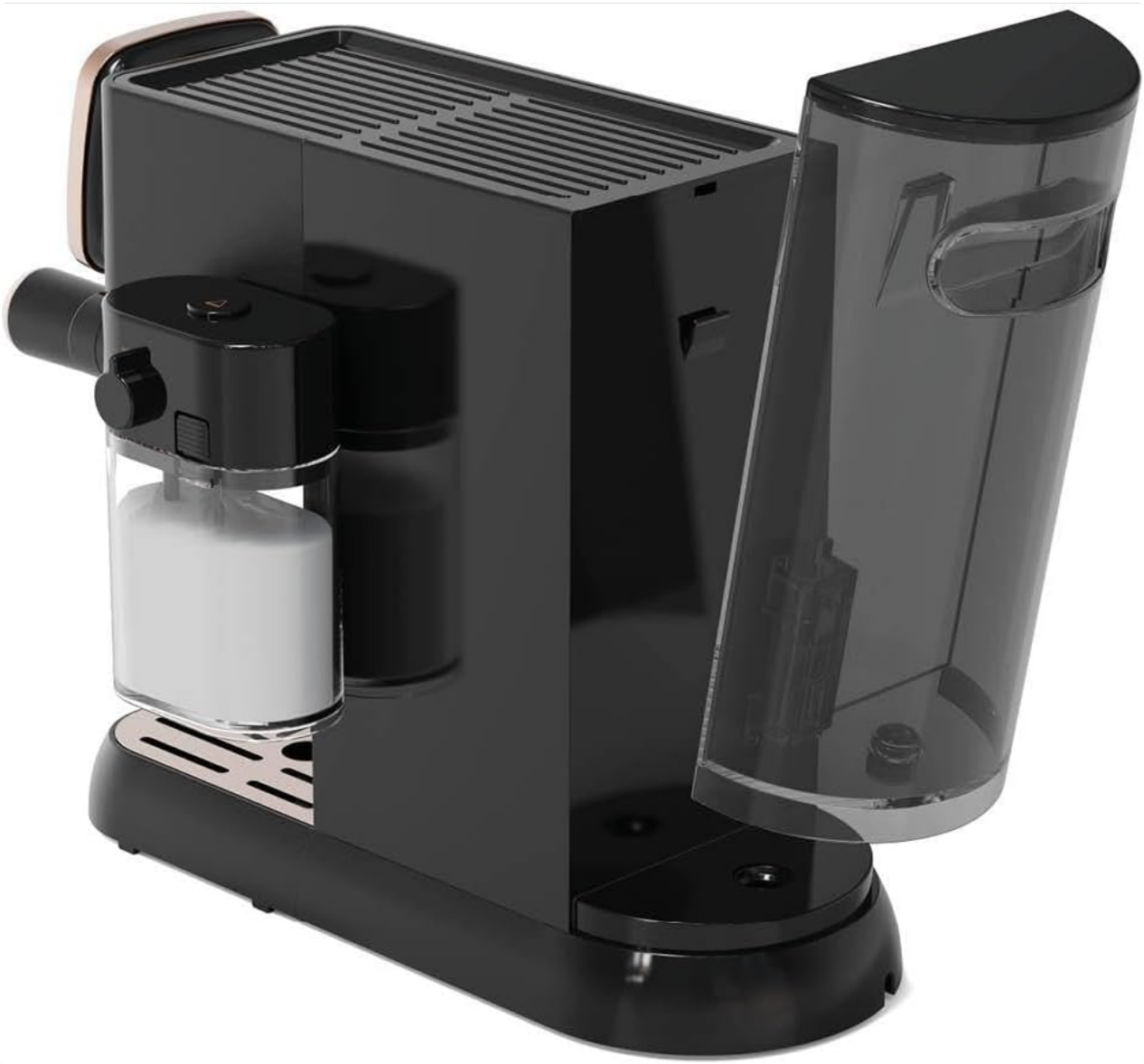
Rear view of the Arzum OK0032-04 Okka Solo M Espresso Machine, illustrating the removable water tank for easy refilling and cleaning.