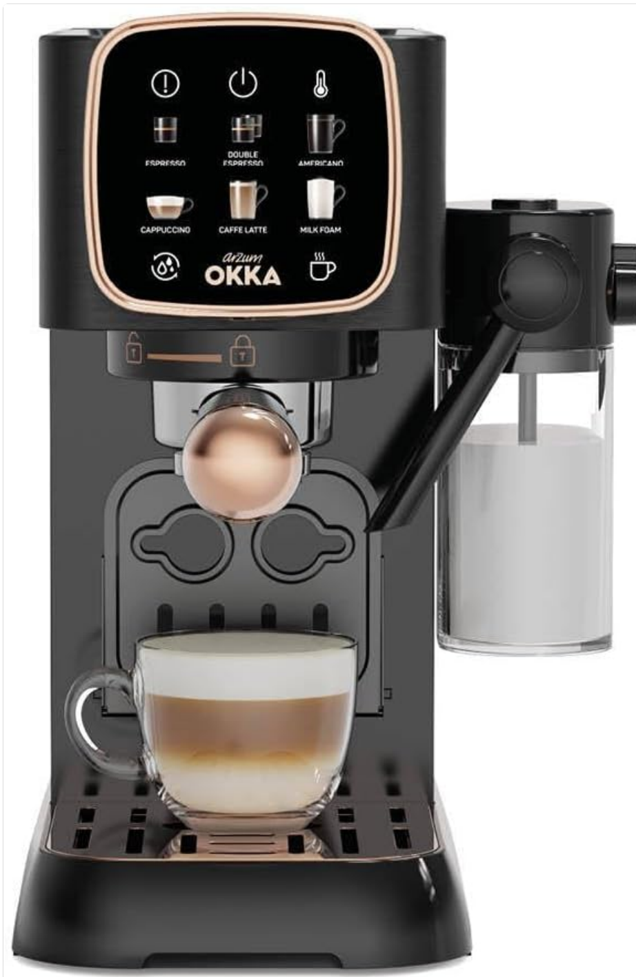
Front view of the Arzum OK0032-04 Okka Solo M Espresso Machine, showcasing its black and copper design with a latte in a glass.