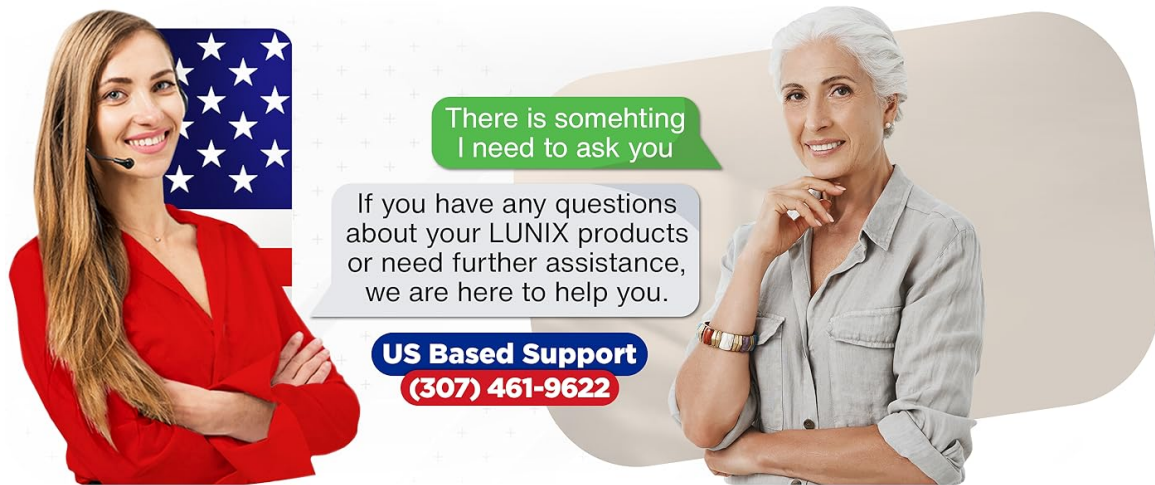
Image: Lunix customer support team members, emphasizing their readiness to assist with product inquiries.