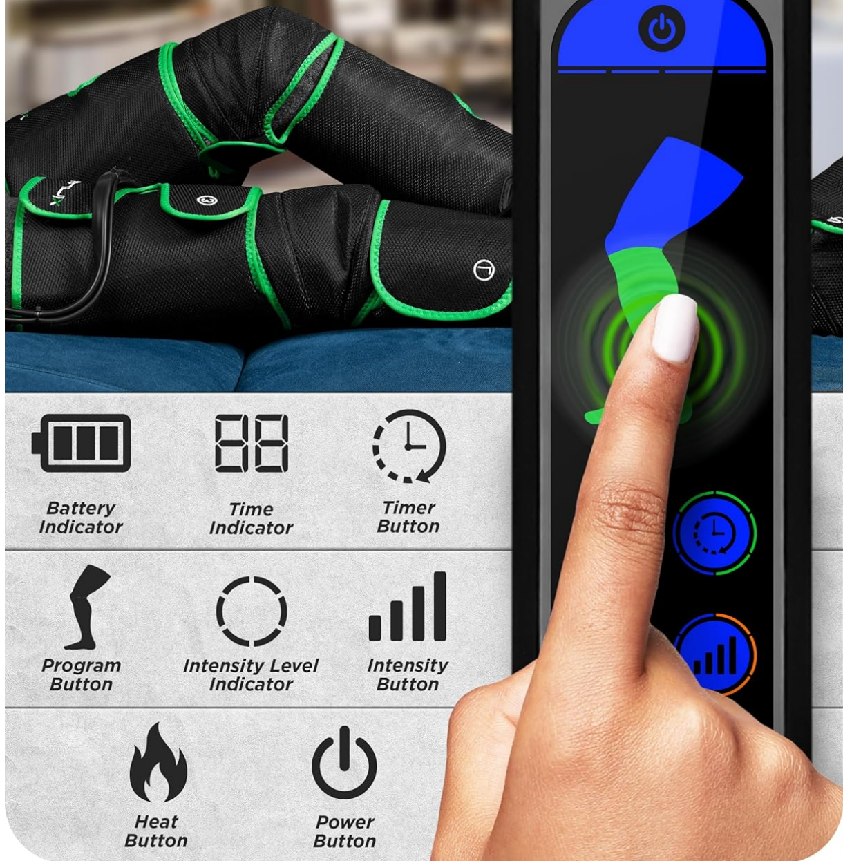
Image: A detailed view of the Linux LX10's LCD touchscreen remote control, showing buttons for power, program, intensity, timer, and heat.