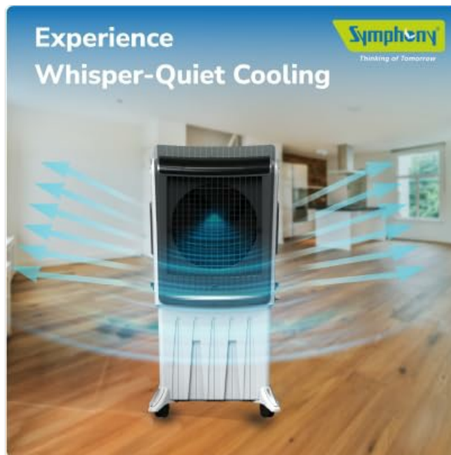
Image: The Symphony Silenzo 120i Desert Cooler demonstrating its Easy-Fill water system for convenient refilling.