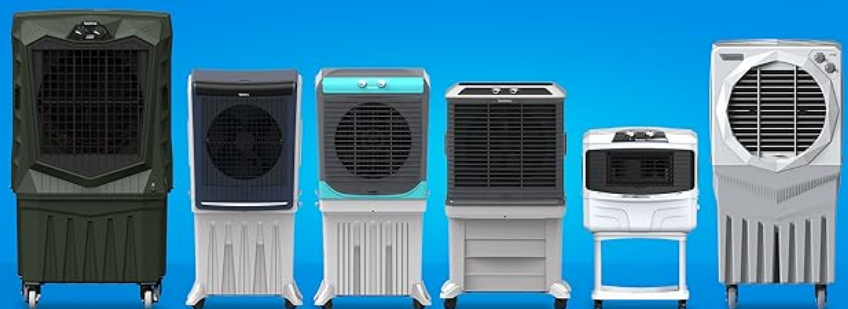
Image: This image highlights the CFD Technology for uniform cooling, inverter compatibility for uninterrupted operation, and the Easy-