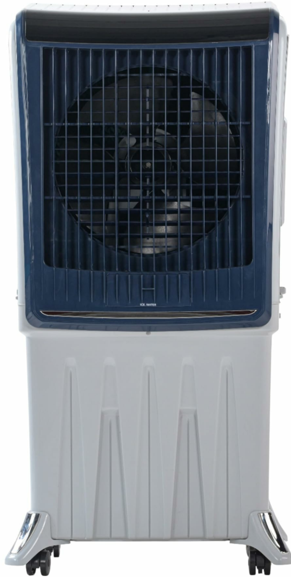
Image: The Symphony Silenzo 120i Desert Cooler delivering whisper-quiet cooling, ideal for maintaining a serene atmosphere.

The Silenzo 120i is engineered for quiet performance, featuring an Owl Wing Fan and special acoustic design. It operates at a low noise level of 30 Decibels, ensuring a peaceful environment.