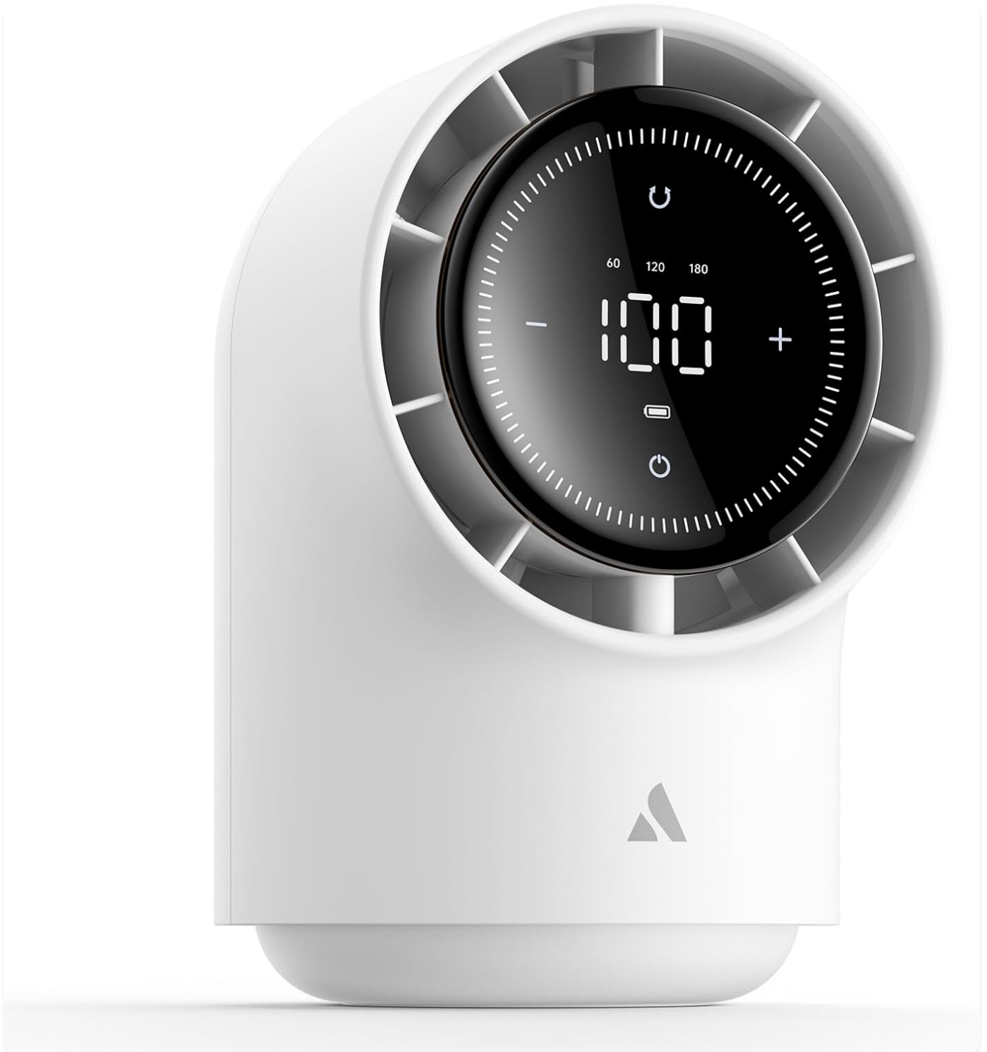
Figure 4.1: Front view of the Aeecooly Touch Control Desk Fan, highlighting the digital display.

The fan features a prominent circular LED touch display on its front, showing current fan speed and battery level. The minimalist design ensures it blends seamlessly into any environment.