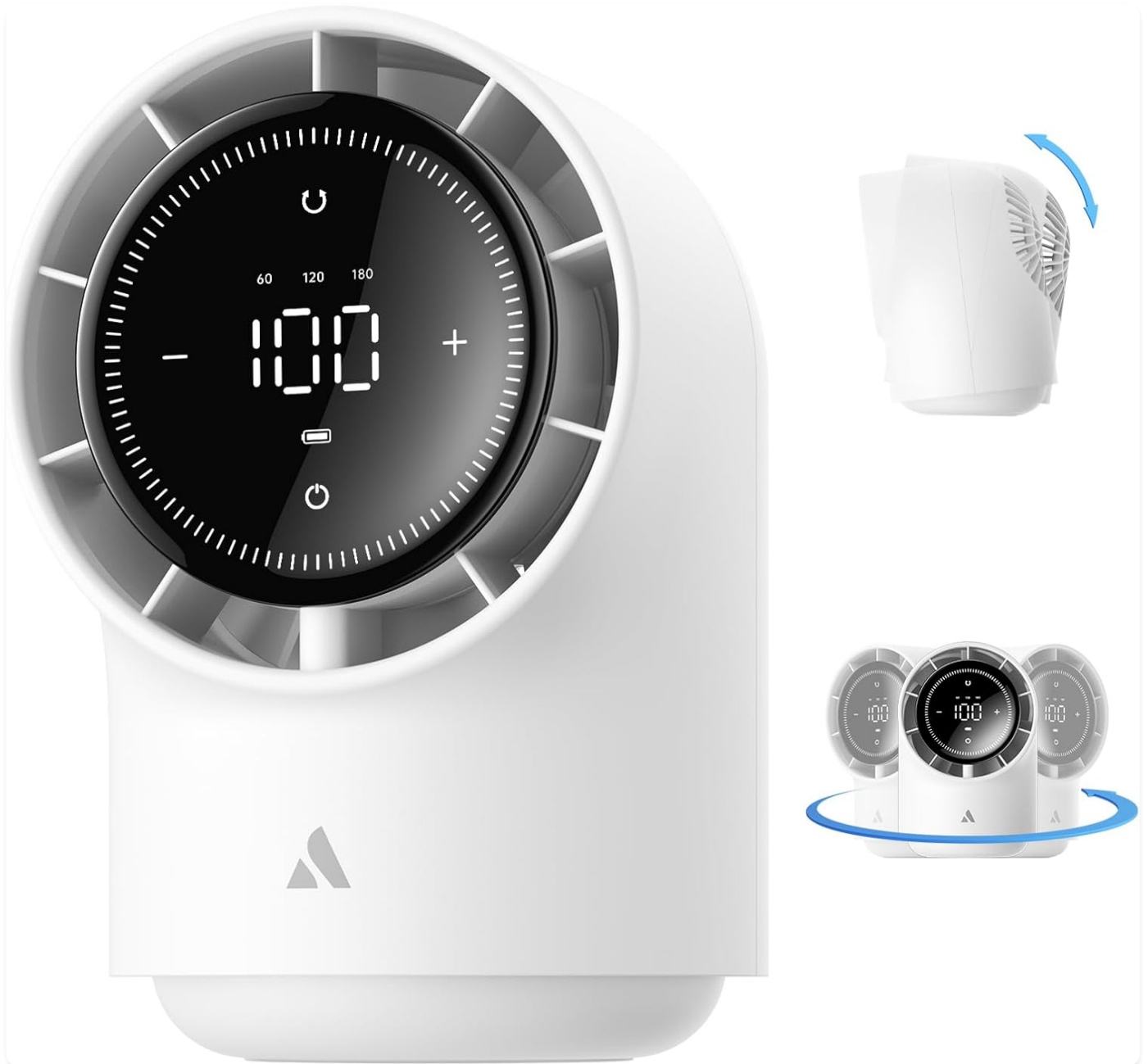
Figure 6.2: Visual representation of the fan's oscillation and tilt capabilities.

The fan offers three oscillation angles to distribute air across a wider area.