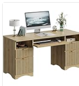
Figure 2: The Bestier Computer Desk fully assembled, showcasing its keyboard tray and storage drawers.