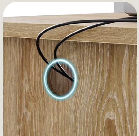
Cable Management Hole