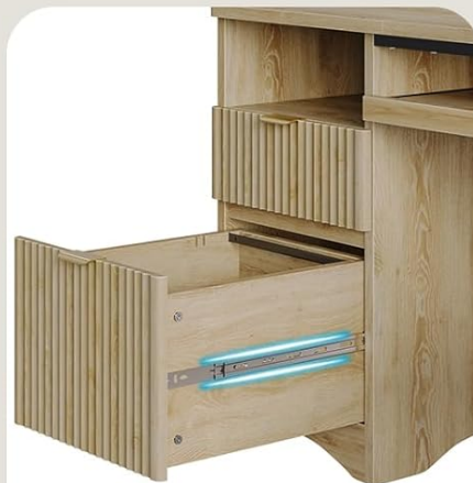
Smooth Drawer Hinges