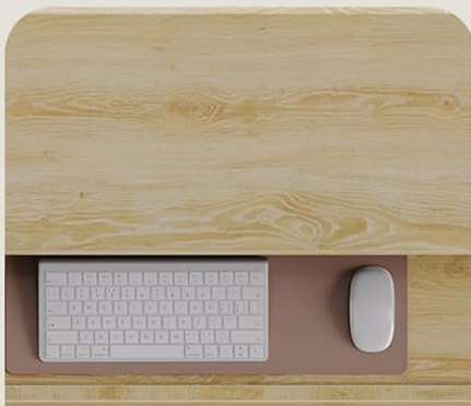
Flexible Keyboard Tray