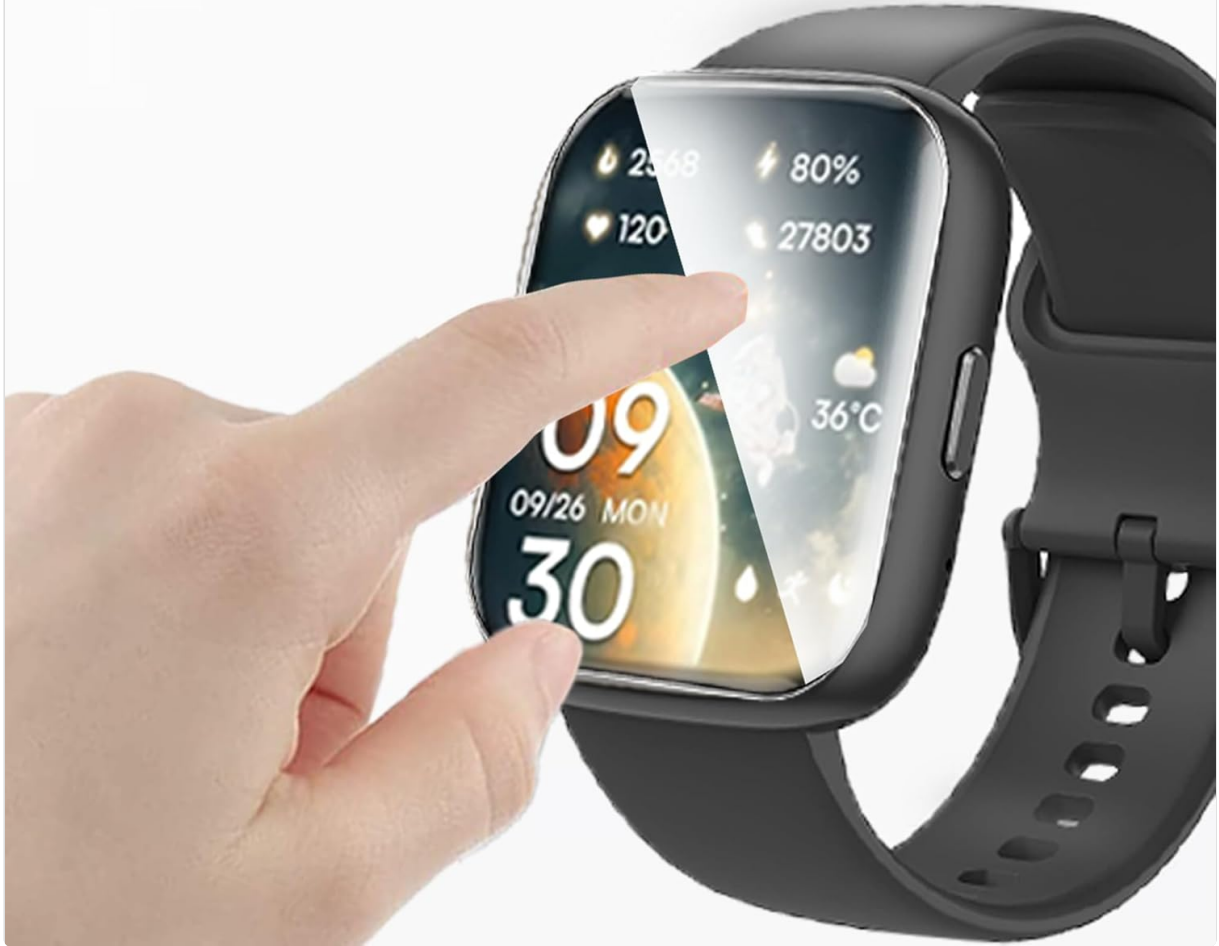
Image: A finger interacting with a screen protected by the Lamshaw film, illustrating the maintained original touch response.

Responds quickly without any lag or mistake