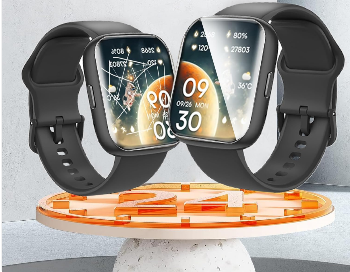
Image: Two devices with screen protectors, visually representing the automatic repair feature that eliminates minor scratches and bubbles.

The self-healing technology constantly eliminates minor scratches and bubbles within 24hrs.