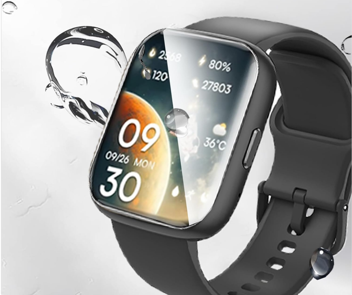
Image: Water droplets beading on the screen protector surface, demonstrating the effectiveness of the oleophobic coating against liquids and smudges.

Keep clean and clear against smudges and oil residue