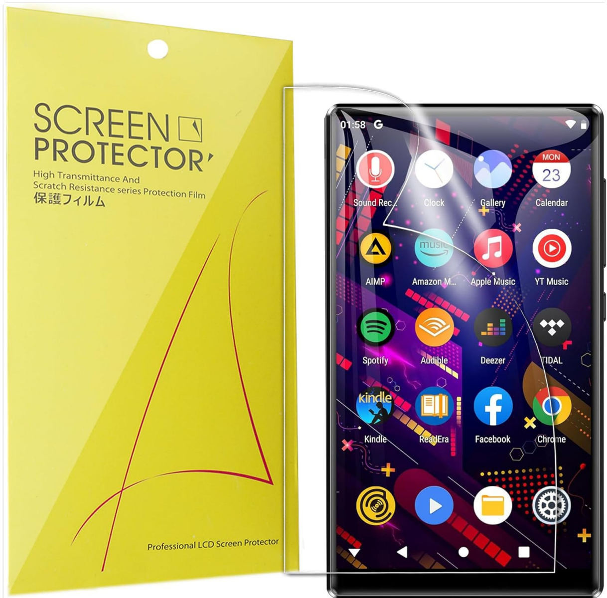
Image: Lamshaw Screen Protector applied to a device, showcasing its clear finish.