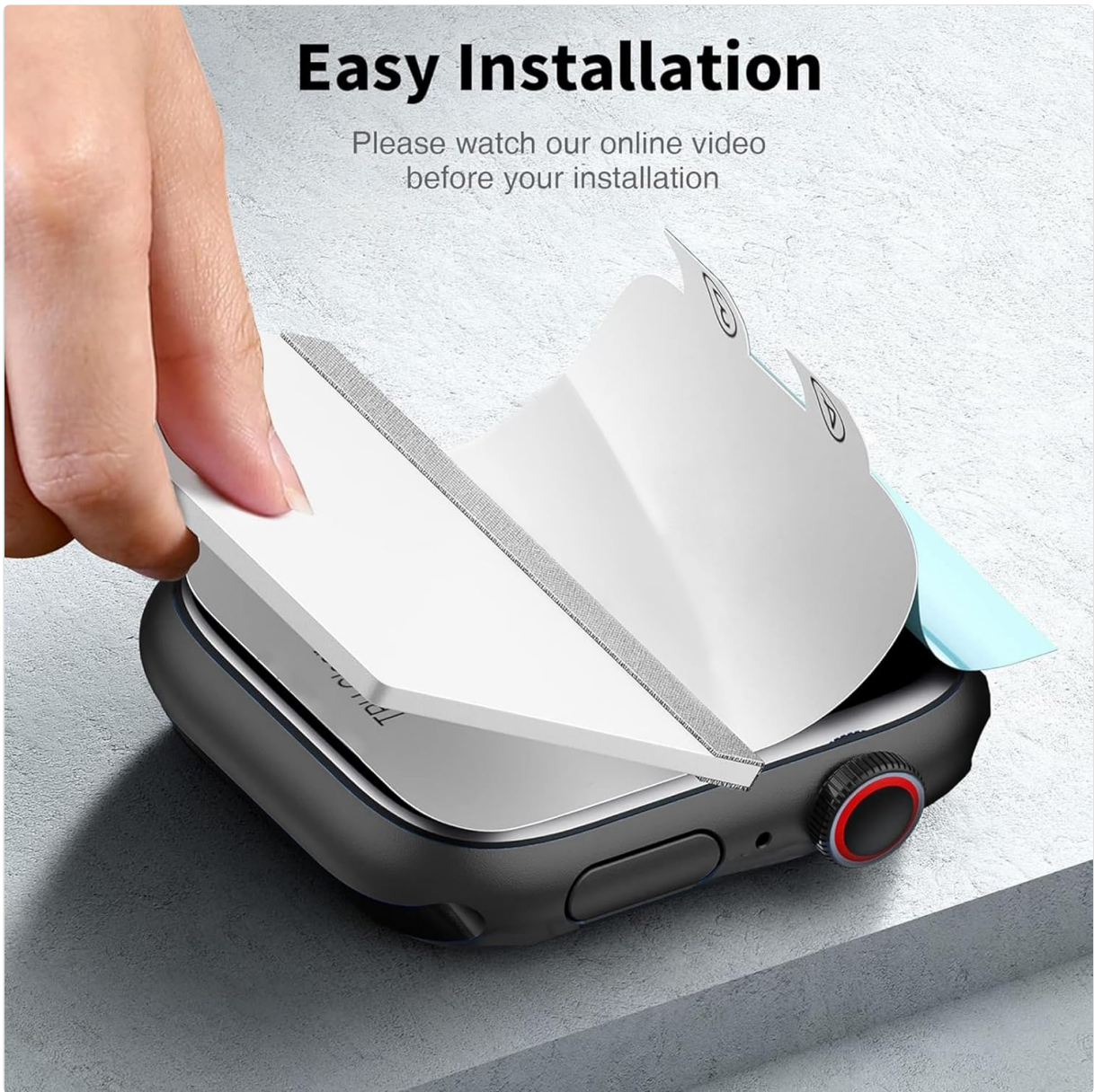
Image: A close-up of hands carefully peeling a protective film from the screen protector, illustrating the initial step of installation.

Please watch our online video before your installation