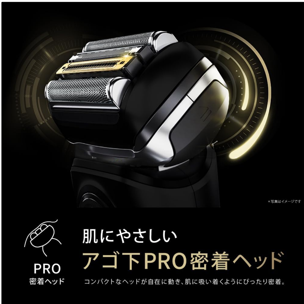
Image: A detailed view of the shaver head, highlighting its intricate design for optimal skin contact.