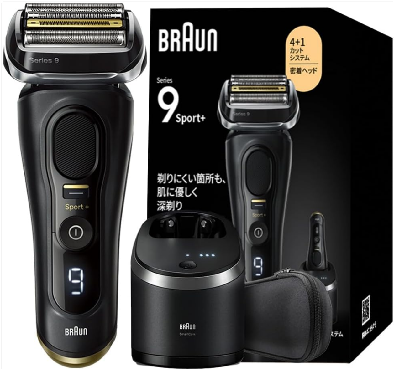
Image: Braun Series 9 Sport+ 9360cc electric shaver with its 6-in-1 alcohol cleaning system and travel case.