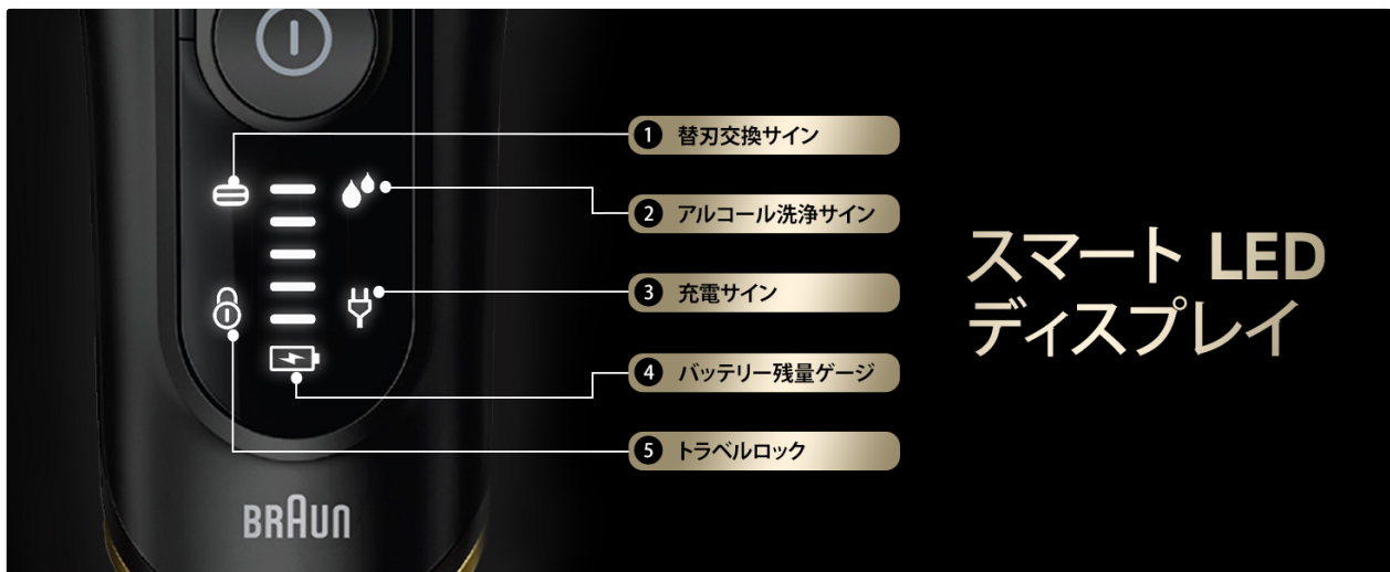
Image: An illustration detailing the various indicators on the shaver's Smart LED Display.