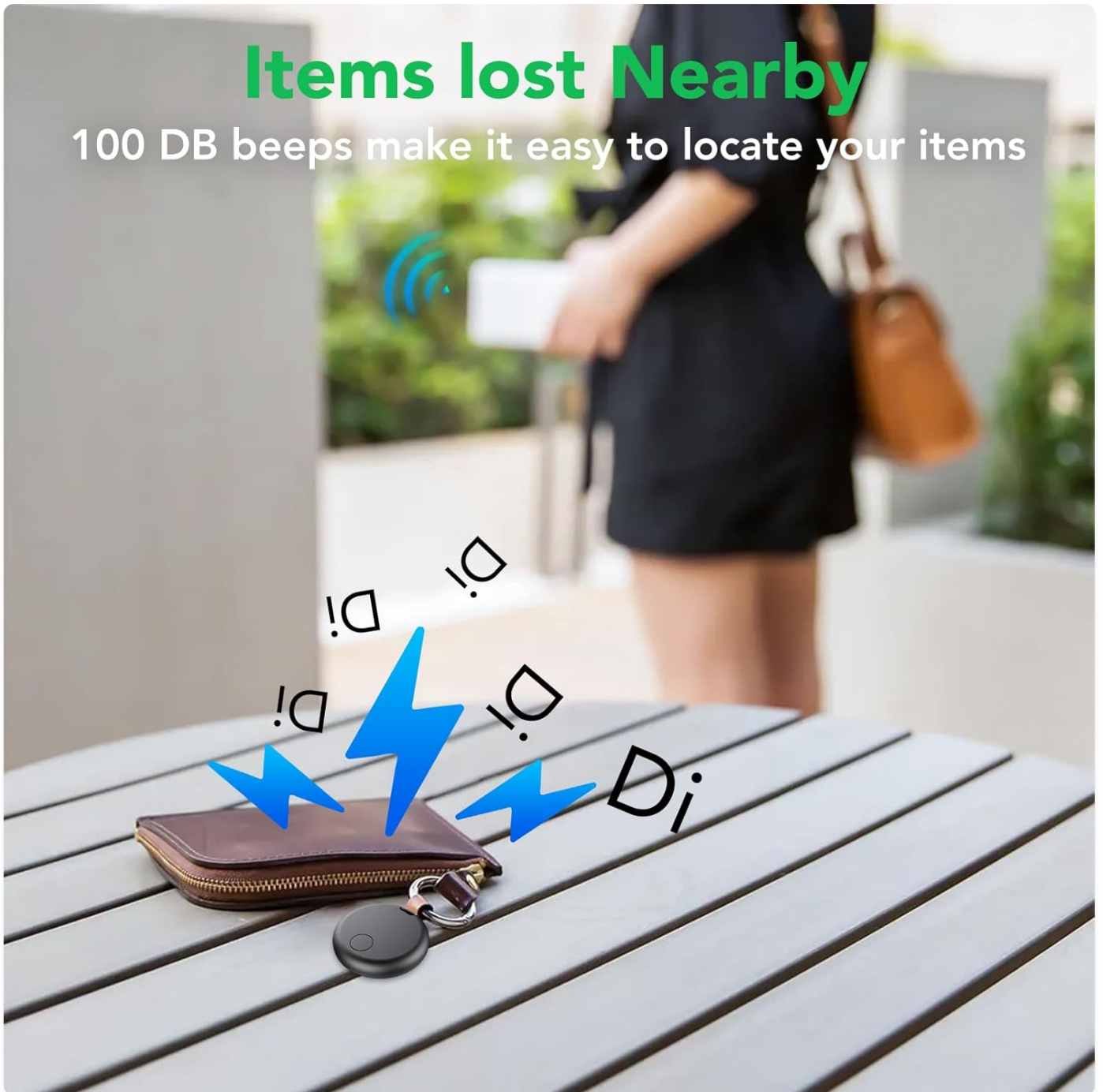
Image: The tracker emitting a loud beep (100 dB) to help locate items that are lost nearby, such as a wallet on a table.

100 DB beeps make it easy to locate your items