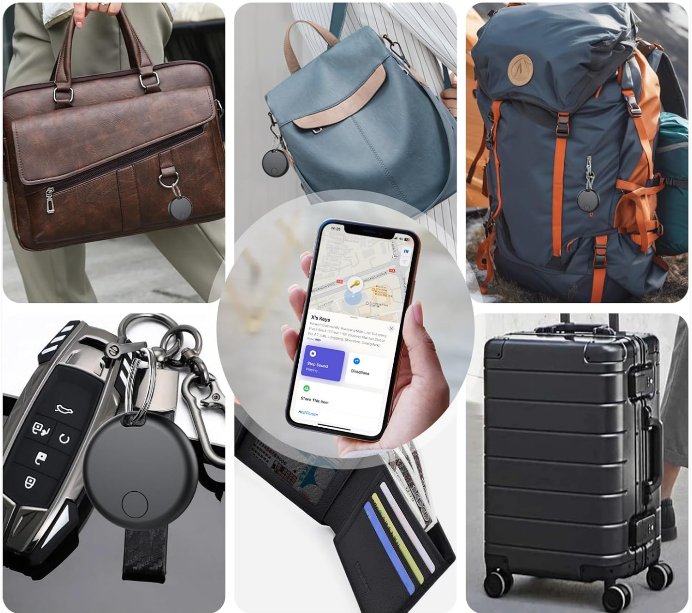
Image: A visual representation of the tracker's versatility, demonstrating its use across multiple scenarios and attached to different personal belongings.