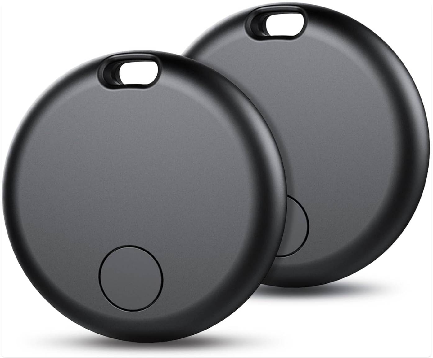
Image: Two aowoka Smart Bluetooth Trackers, showcasing their compact, circular design in jewel black.