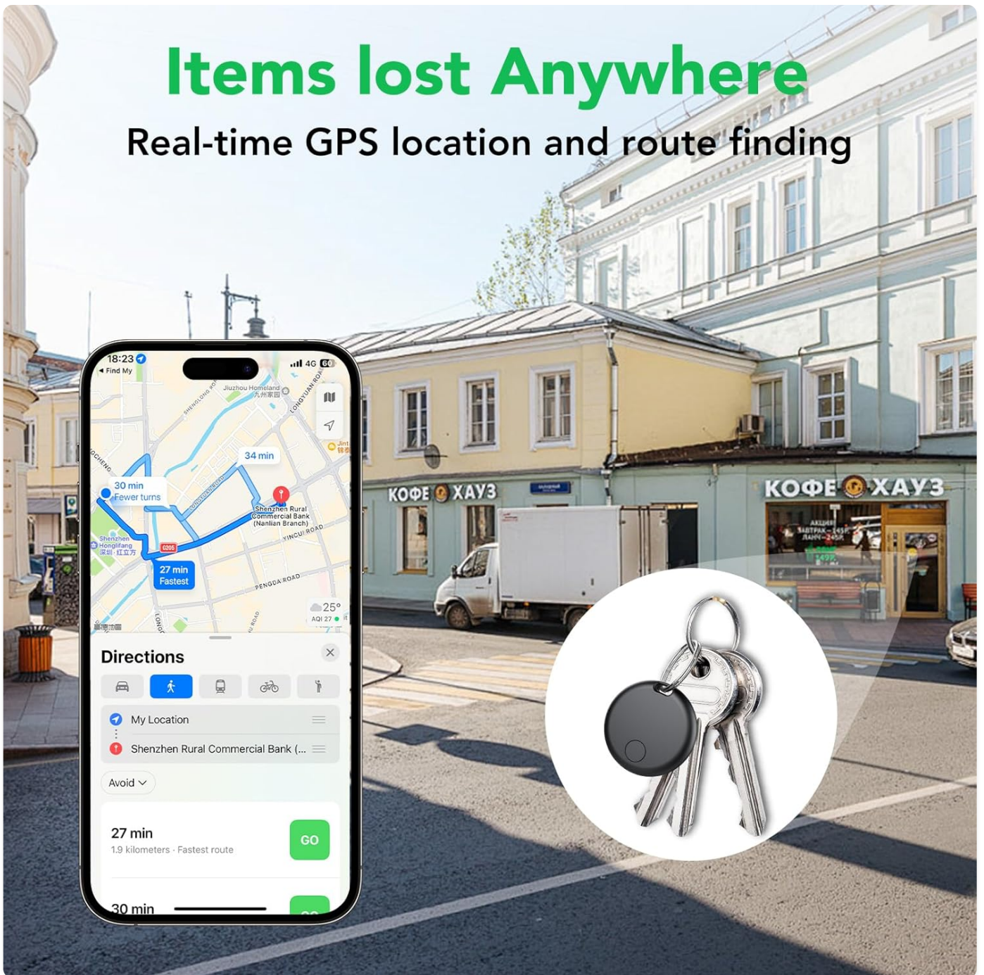
Image: An illustration of the tracker's ability to provide real-time GPS location and route finding for items lost anywhere, displayed on a smartphone map.

Real-time GPS location and route finding