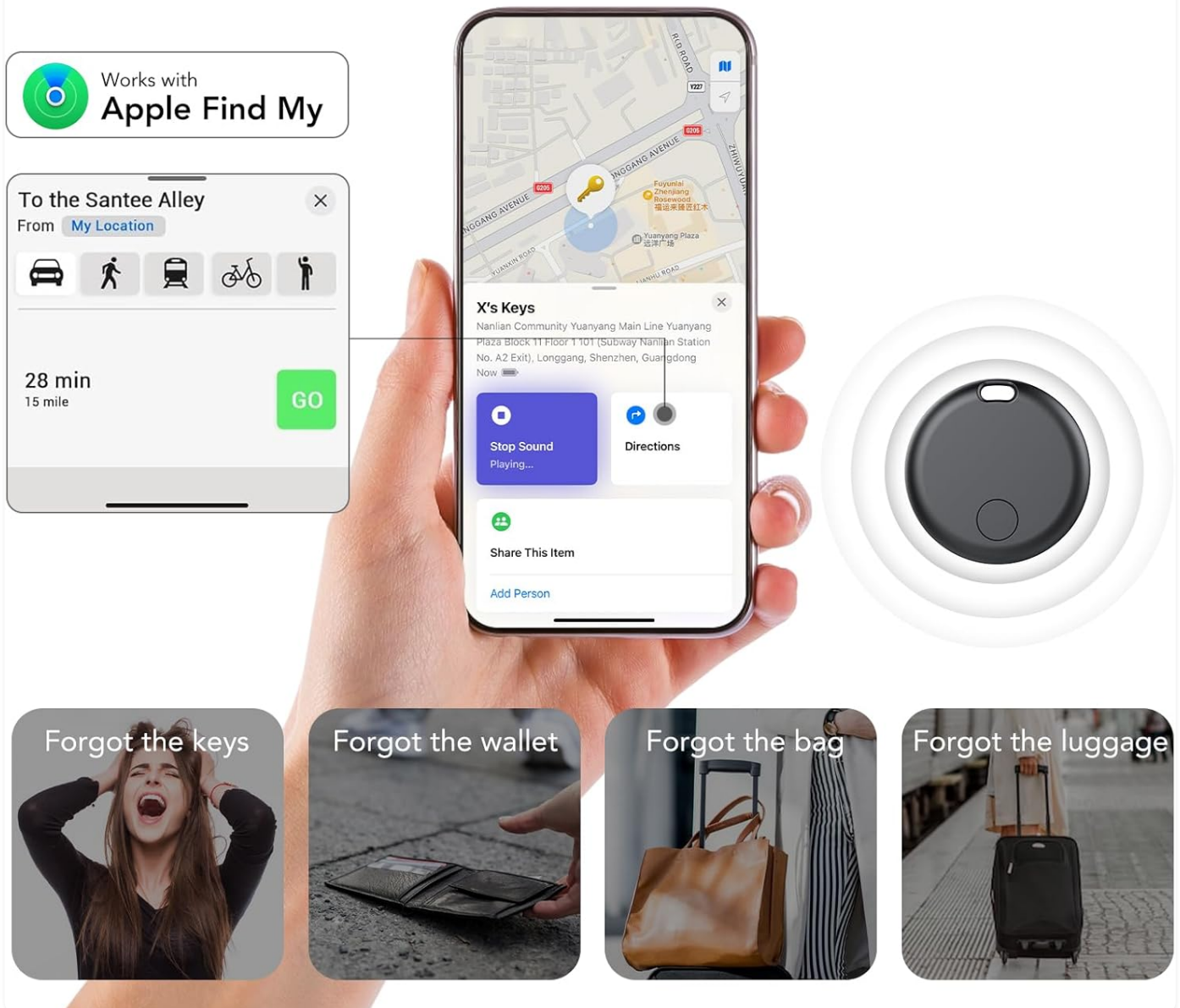
Image: Visual guide demonstrating the integration of the aowoka tracker with the Apple Find My app, showing its use for various lost items like keys, wallets, bags, and luggage.