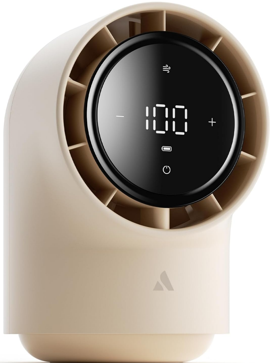
Figure 1: Front view of the Aeooly Chic 01 Lite Desk Fan.