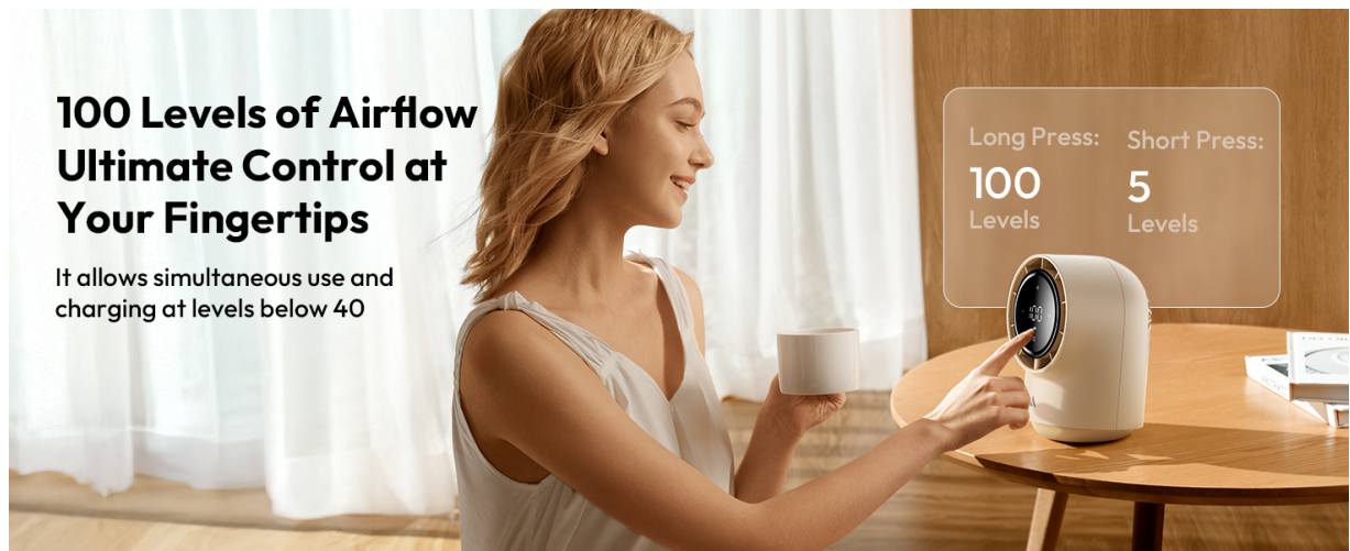
Figure 2: Detail of the LED touch control panel with speed and power indicators.