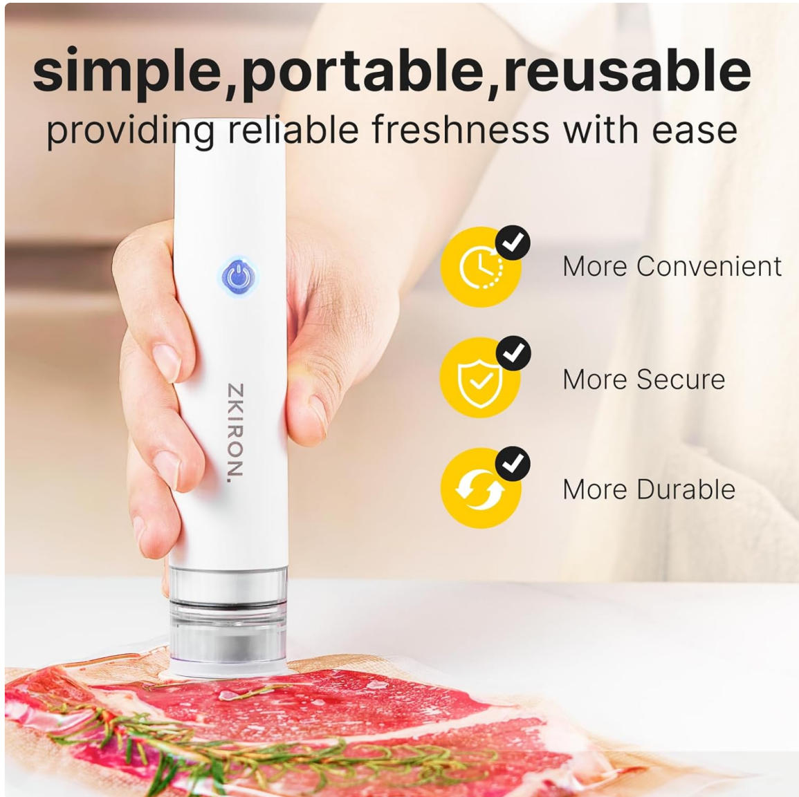
Image: The compact design of the handheld vacuum sealer.

The ZKIRON OneTouch Handheld Vacuum Sealer's ultra-compact, pepper-grinder sized design allows for easy storage in kitchen drawers or cabinets, minimizing countertop clutter. Store the device and bags in a clean, dry place.