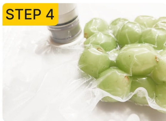
Image: Step-by-step guide for vacuum sealing using the OneTouch device.

Video: A demonstration highlighting the ease of use and compact nature of the ZKIRON OneTouch Handheld Vacuum Sealer.