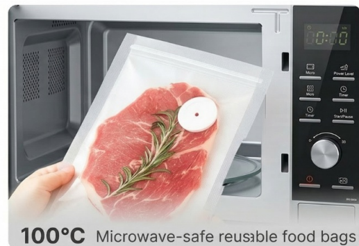
Image: Reusable bags are suitable for microwave and freezer use.