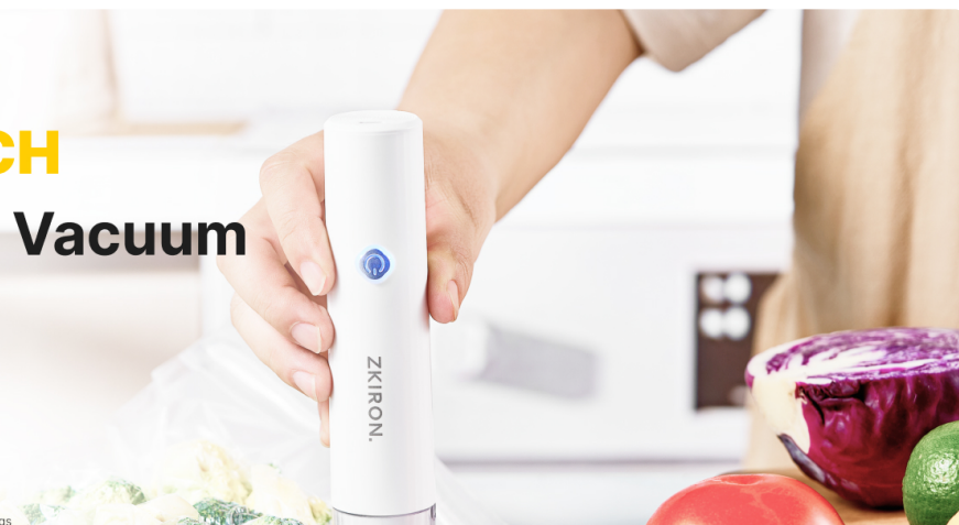
Image: ZKIRON OneTouch Handheld Vacuum Sealer in use with various foods.