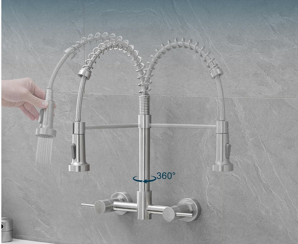
Figure 5: 360° Swivel Spout for full sink access.

Two-way rotation can stretch and clean all corners of the sink