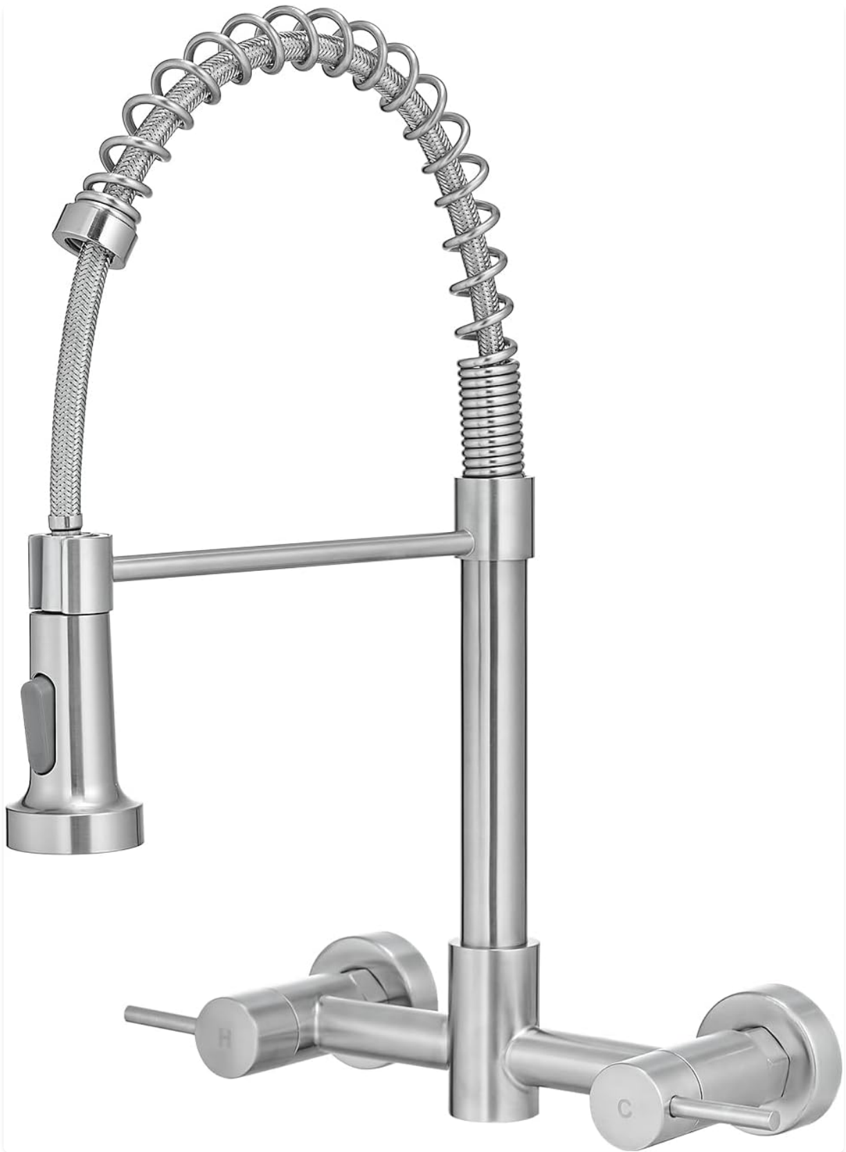
Figure 1: AIMADI Wall Mount Kitchen Faucet, Model AM14233N.