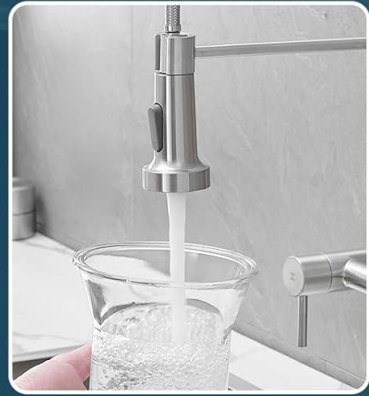
Figure 3: Hot and Cold Dual Control Faucet operation.