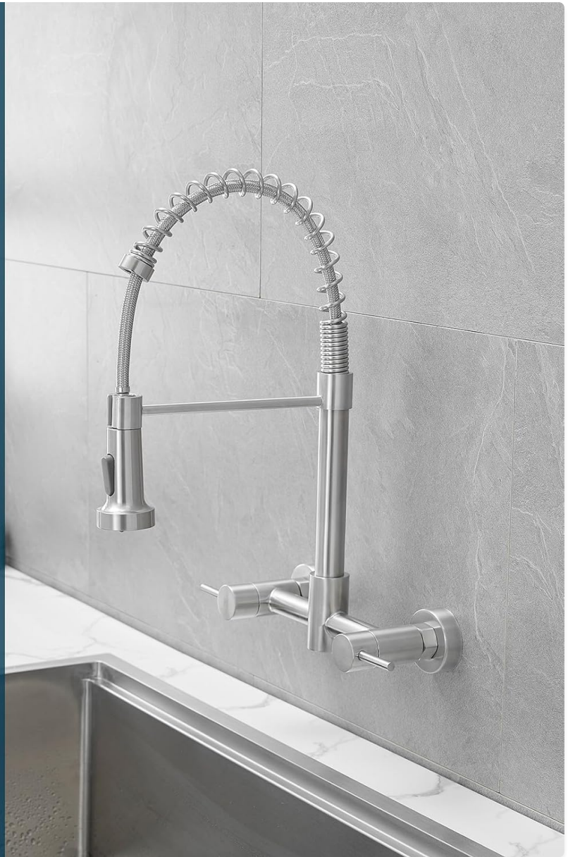
Figure 4: Dual water flow modes: Spray and Stream.