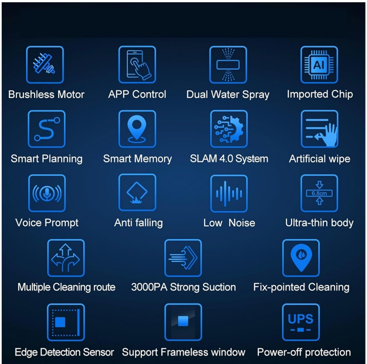
Image 2: An infographic illustrating key features such as Brushless Motor, APP Control, Dual Water Spray, Smart Memory, Anti-falling, and 3000PA Strong Suction.