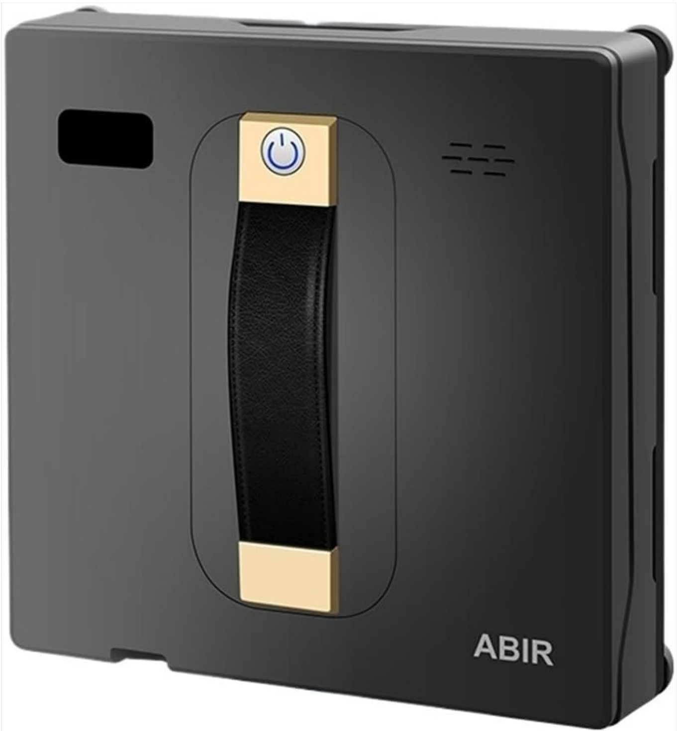
Image 1: The SGYYOFDP Robot Window Cleaner WD8, a rectangular device with a central handle and power button, designed for automated window cleaning.