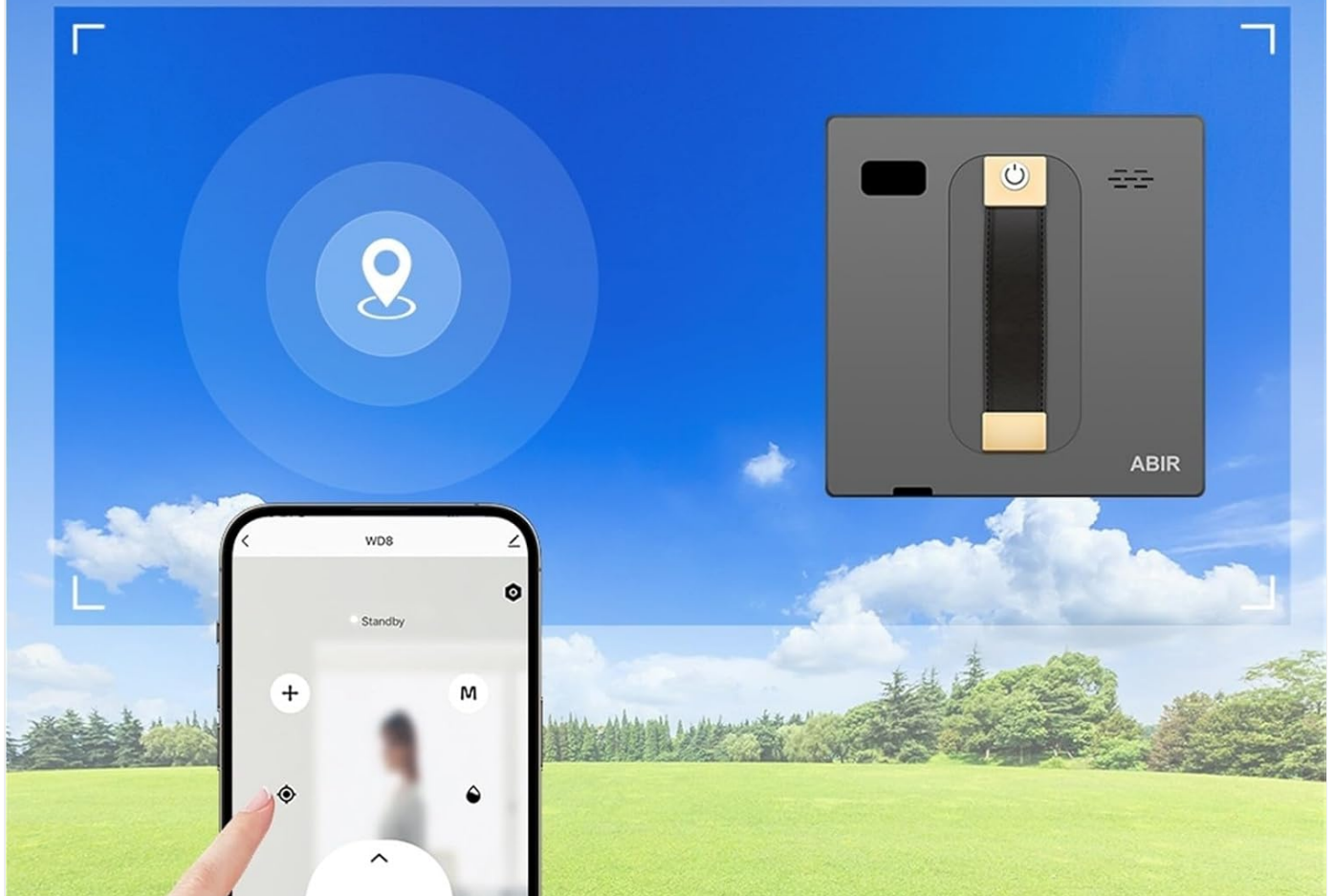
Image 5: The robot performing a simulated manual wiping motion, moving back and forth to deeply clean stubborn stains on a window.

It can do simulated manual wiping, wipe strongly back and forth, deeply clean stubborn stains. Much cleaner than other brand.