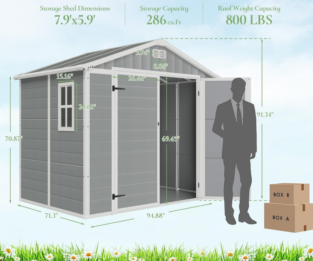
Image: A detailed diagram illustrating the overall dimensions of the storage shed, including height, width, and depth.

The installation steps are recommended to be done by two people