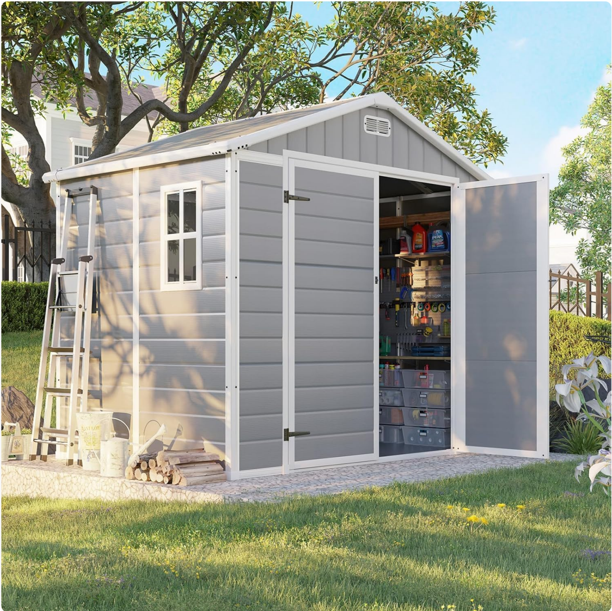
Image: The LUXOAK 8x6 ft Resin Storage Shed, showcasing its spacious interior and modern design in a garden environment.

Key features include wear-resistant ABS corner protectors, strategically placed drainage outlets to prevent water accumulation, and a robust roof engineered to withstand heavy loads. The shed is equipped with a transparent window and dual ventilation ports for excellent airflow and natural light, reducing humidity and keeping stored items dry and fresh.