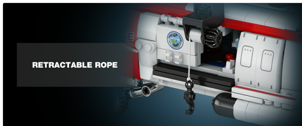
Image: The retractable rope feature, crucial for rescue simulations.

Image: Focus on the detailed dashboard design within the helicopter's cockpit.