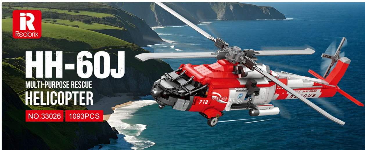
Image: The Reobrix HH-60J Multi-purpose Rescue Helicopter model, showcasing its design and features.

This instruction manual provides comprehensive guidance for assembling, operating, and maintaining your Reobrix HH-60J Rescue Helicopter Building Set, model 33026. This detailed model kit allows enthusiasts to construct a replica of the Coast Guard Black Hawk helicopter, featuring functional elements and intricate design. Please read all instructions carefully before beginning assembly.