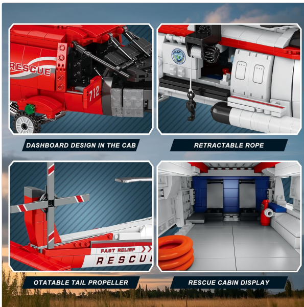
Image: Detailed views of the dashboard, retractable rope, rotatable tail propeller, and rescue cabin interior.