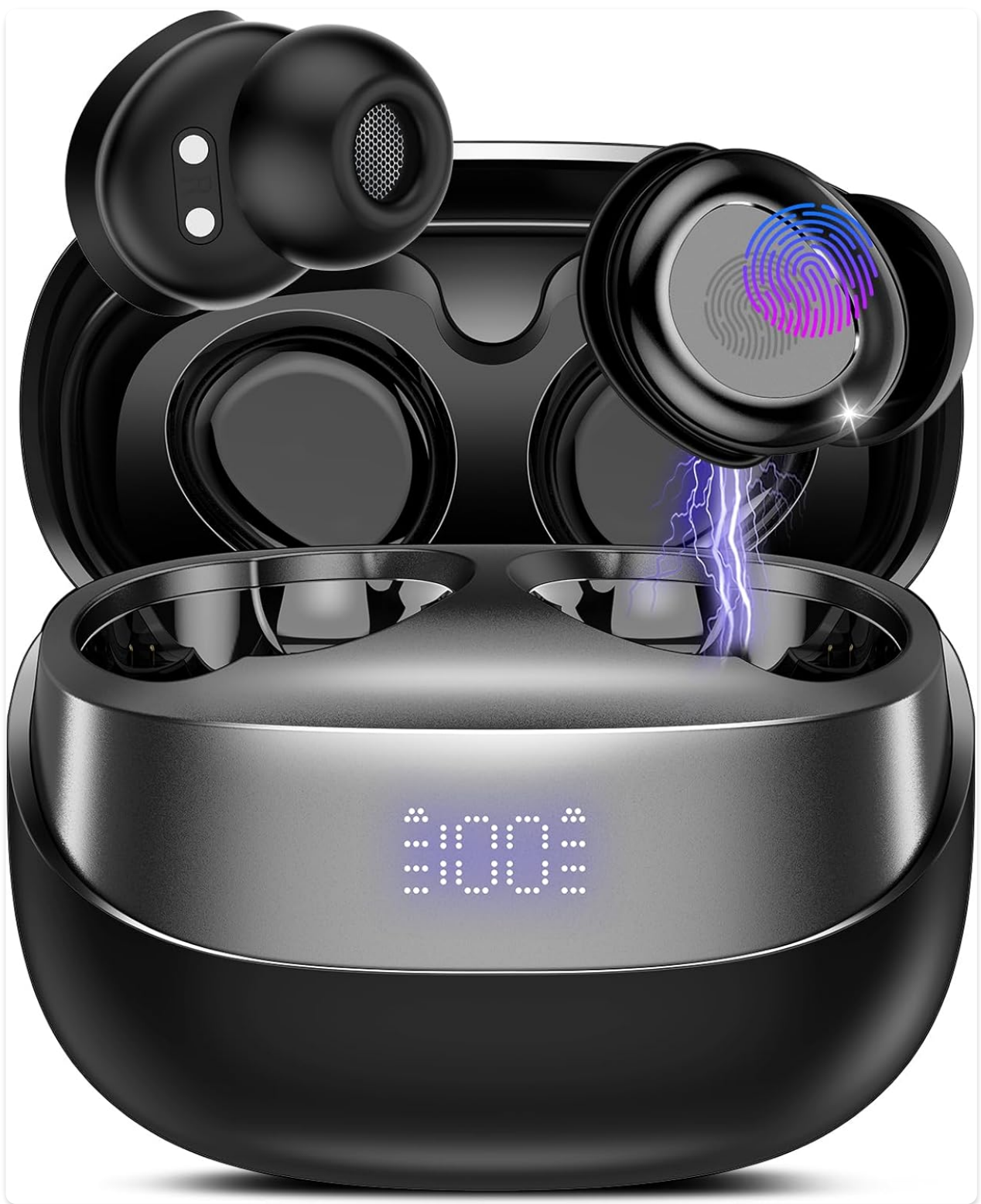
The DUSONLAP SU8 Sleep Earbuds in their charging case, showcasing their compact design and digital display.