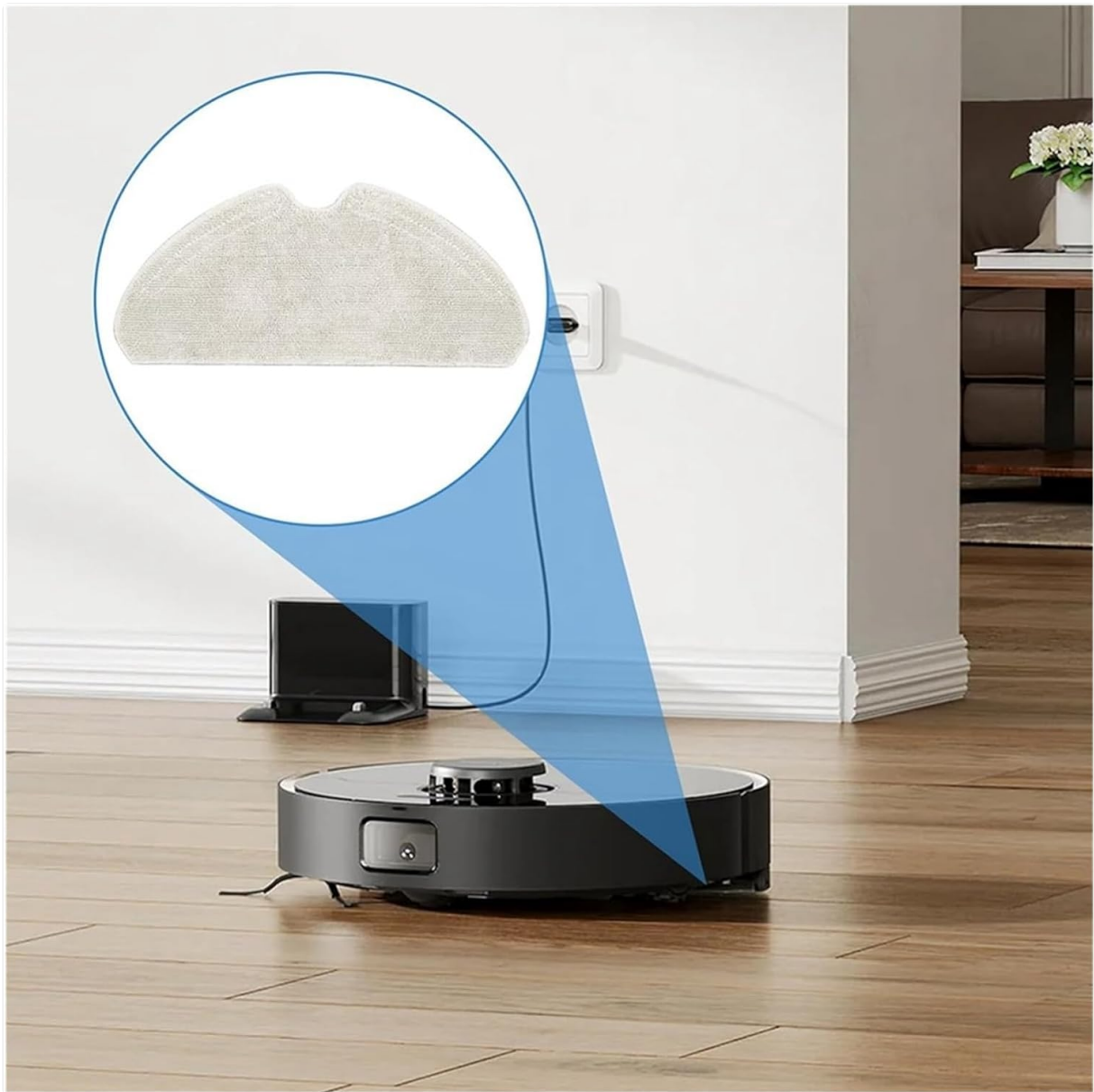
Image 2: A YANPXDOE mop pad securely attached to the underside of a robot vacuum cleaner, demonstrating the installation context.