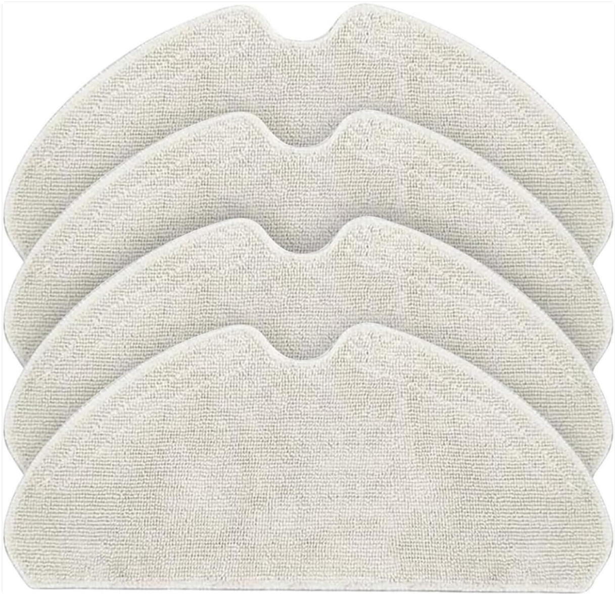
Image 1: Four YANPXDOE replacement mop pads, showing their general shape and texture.