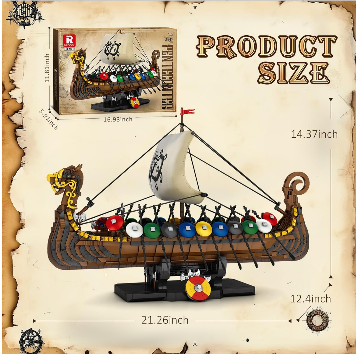
Figure 10: Product Dimensions.