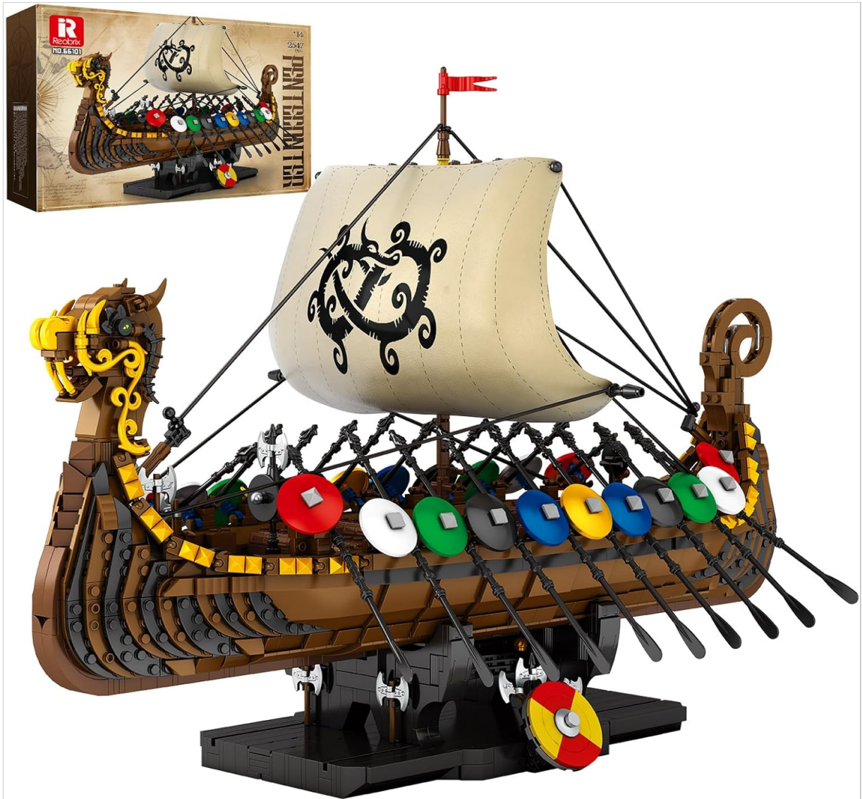
Figure 1: The completed Reobrix Viking Ship Model 66101.