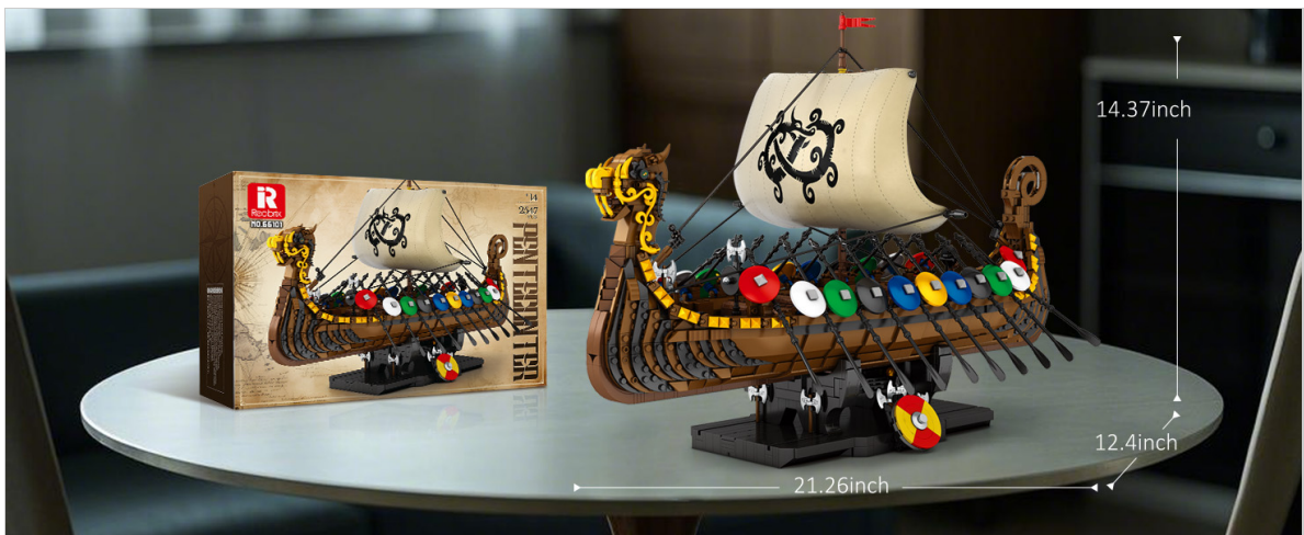
Figure 8: Sail Design.