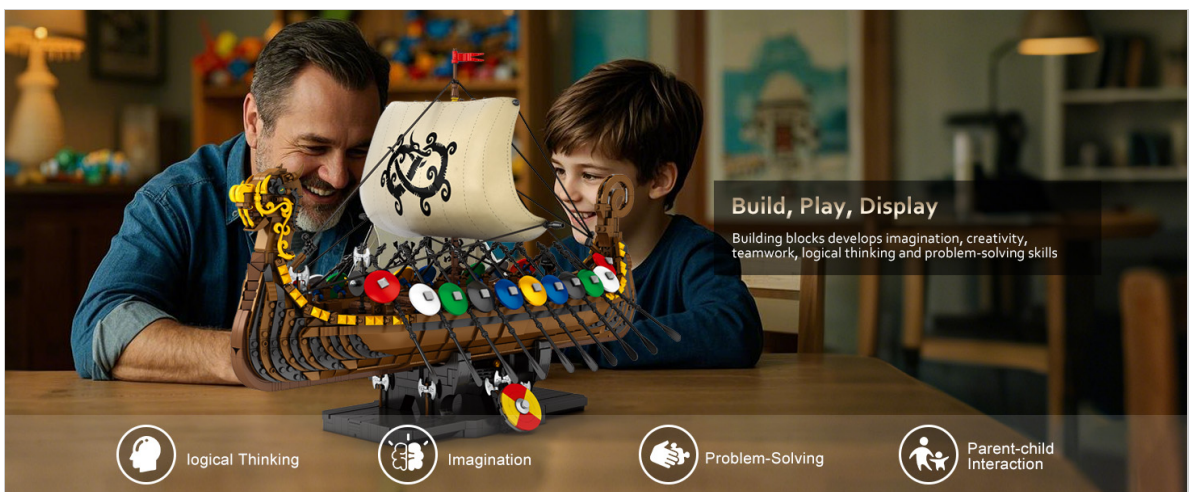
Figure 7: Oar and Shield Design.