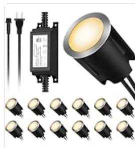
Image 5.2: The transformer unit is also designed to be waterproof.