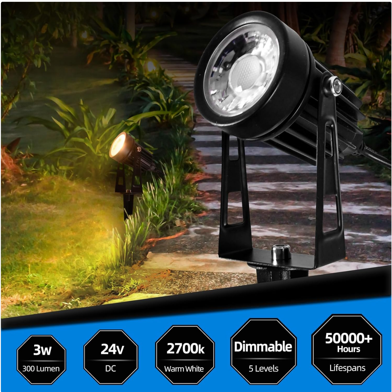
Image 7.1: Key specifications of the Sunmerit Landscape Spotlights.