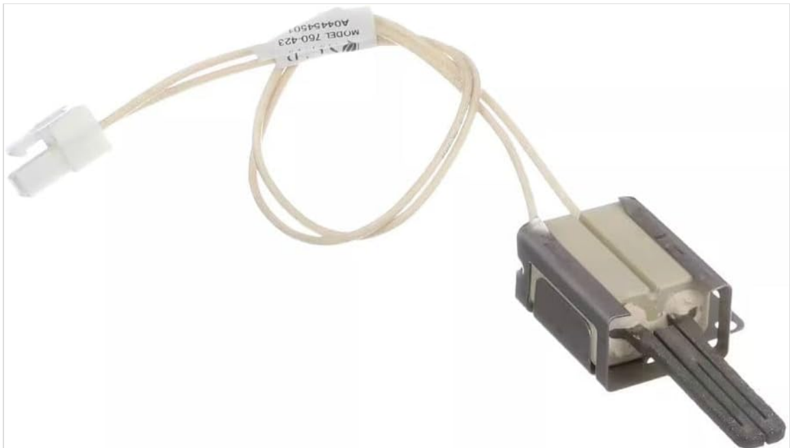
Image: The Generic Range Oven Gas Igniter, model 316489403_new, showing its full assembly with the ceramic igniter element and wiring.

Carefully disconnect the two-prong Molex plug connecting the old igniter to the oven's wiring harness. You may need to gently squeeze the tabs on the connector to release it. Remove the screws holding the old igniter in place and carefully detach it from the burner assembly.