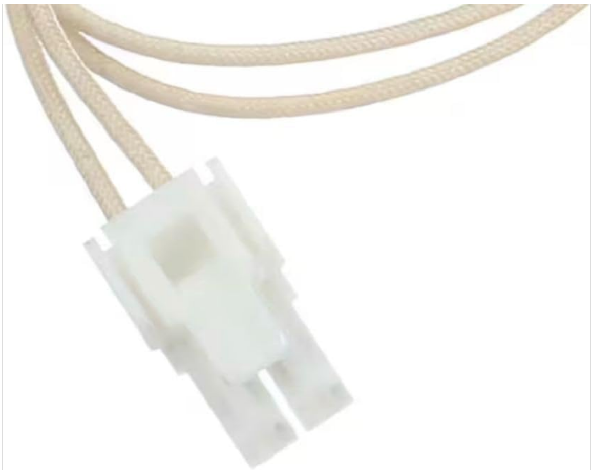
Image: A detailed view of the two-prong Molex plug, used for electrical connection to the oven's wiring harness.

Replace the oven floor panel and secure it with its screws. Reinstall the oven racks.