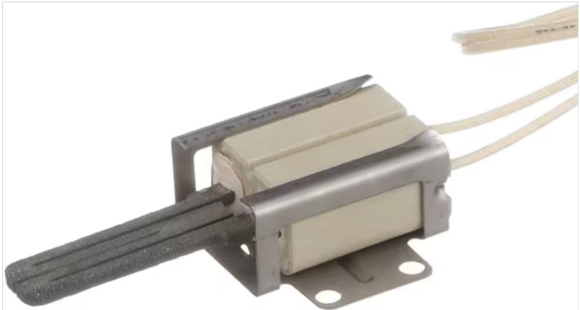
Image: A close-up view of the ceramic igniter element, which glows to ignite the gas.