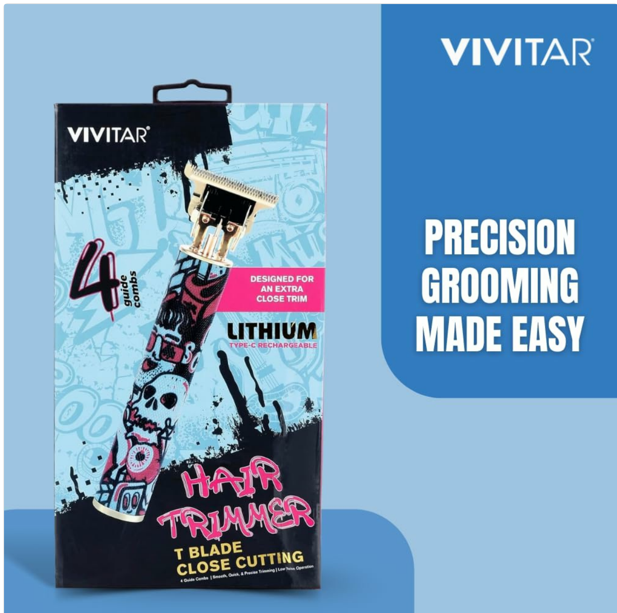
Image: Graphic illustrating key features including cordless design, lightweight build, precision T-blade, quiet motor, compact design, and ergonomic design.