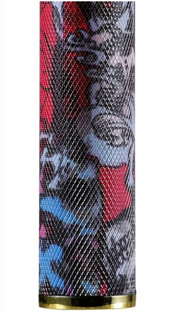
Image: Vivitar Cordless Hair Trimmer T-Blade, showcasing its design and gold-colored blade.