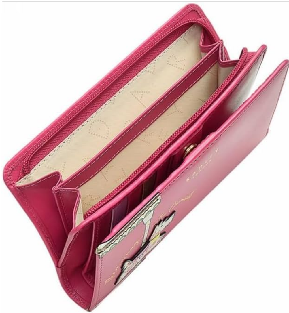
Figure 2.4: Angled view of the open purse. This image provides a perspective of the purse's depth when open, clearly showing the zipped coin pocket and the notes compartment.