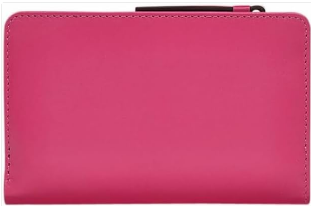
Figure 2.2: Back view of the purse. This image shows the plain back of the purse, highlighting the smooth pink leather finish and stitching details.