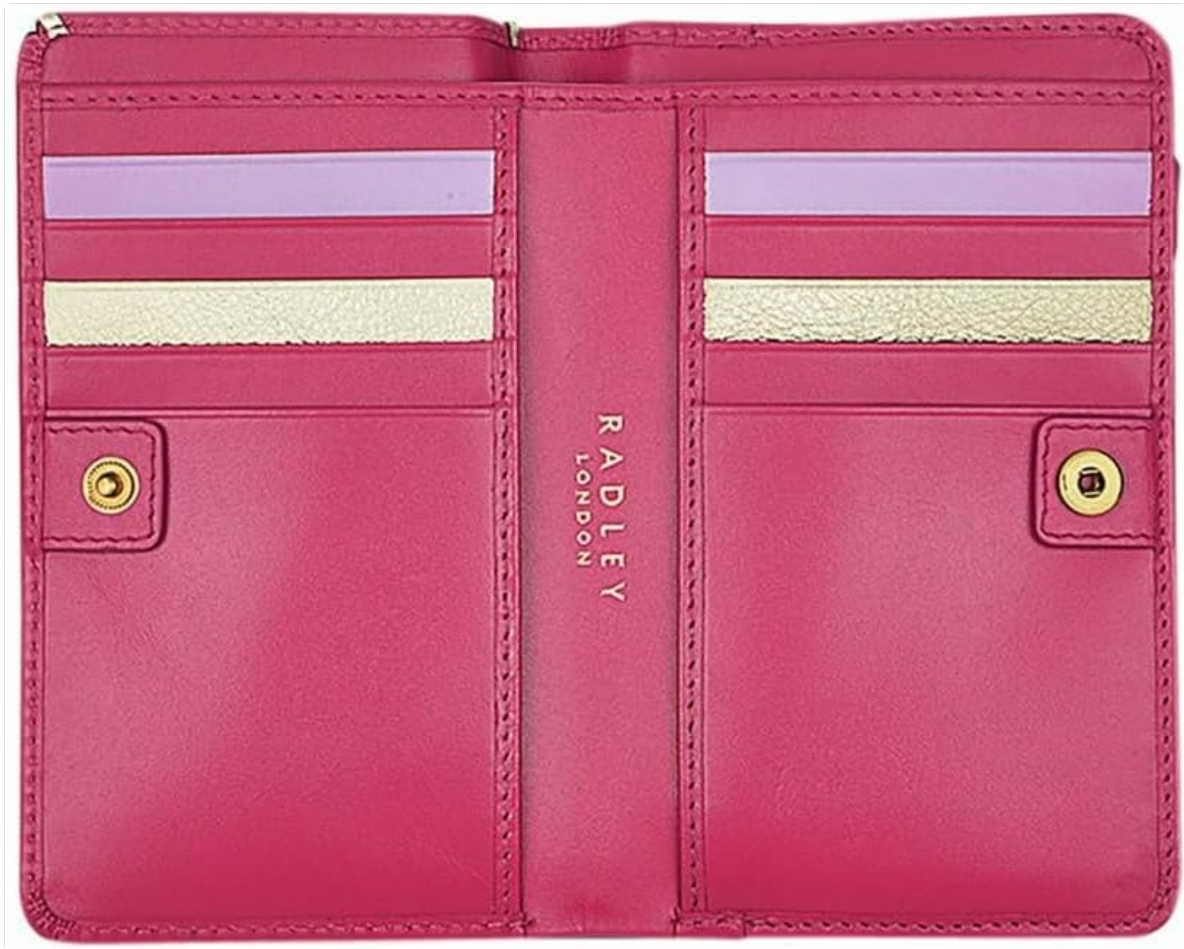
Figure 2.3: Interior view of the open purse. This image illustrates the internal organization, including multiple card slots on both sides, two slip pockets, and the embossed RADLEY LONDON logo.