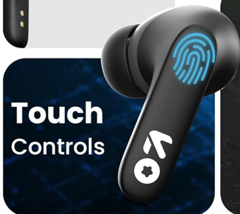
Image: An overview highlighting key features of the GOBOULT Z20, including Bluetooth 5.3, 51H Playtime, BoomX™ Tech bass drivers, IPX5 water resistance, Zen™ ENC Mode, Knurled Design, and Touch Controls.