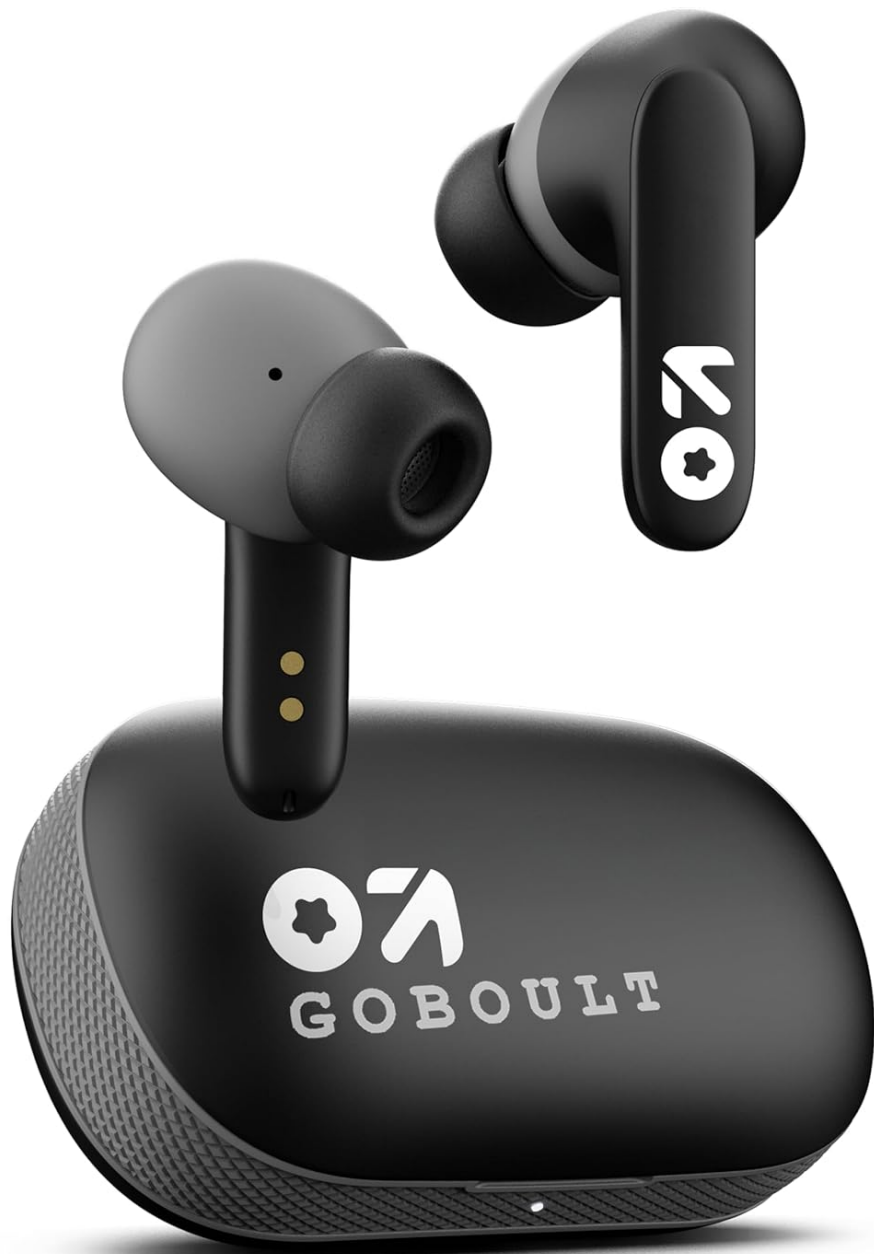
Image: The GOBOULT Z20 Truly Wireless Bluetooth Ear Buds in Jet Black, shown with their charging case. The earbuds feature a sleek design with the GOBOULT logo.