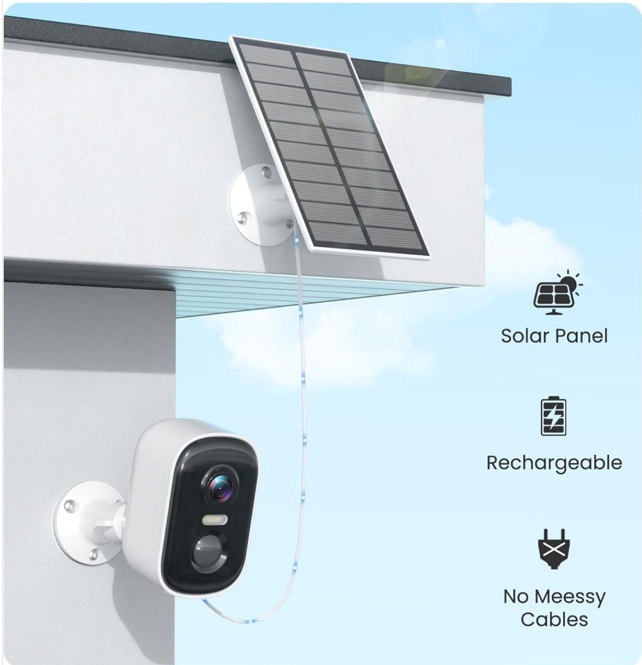
Image 3.1: MISECU solar camera and panel mounted, illustrating continuous power.

100% Wireless, install once, use forever