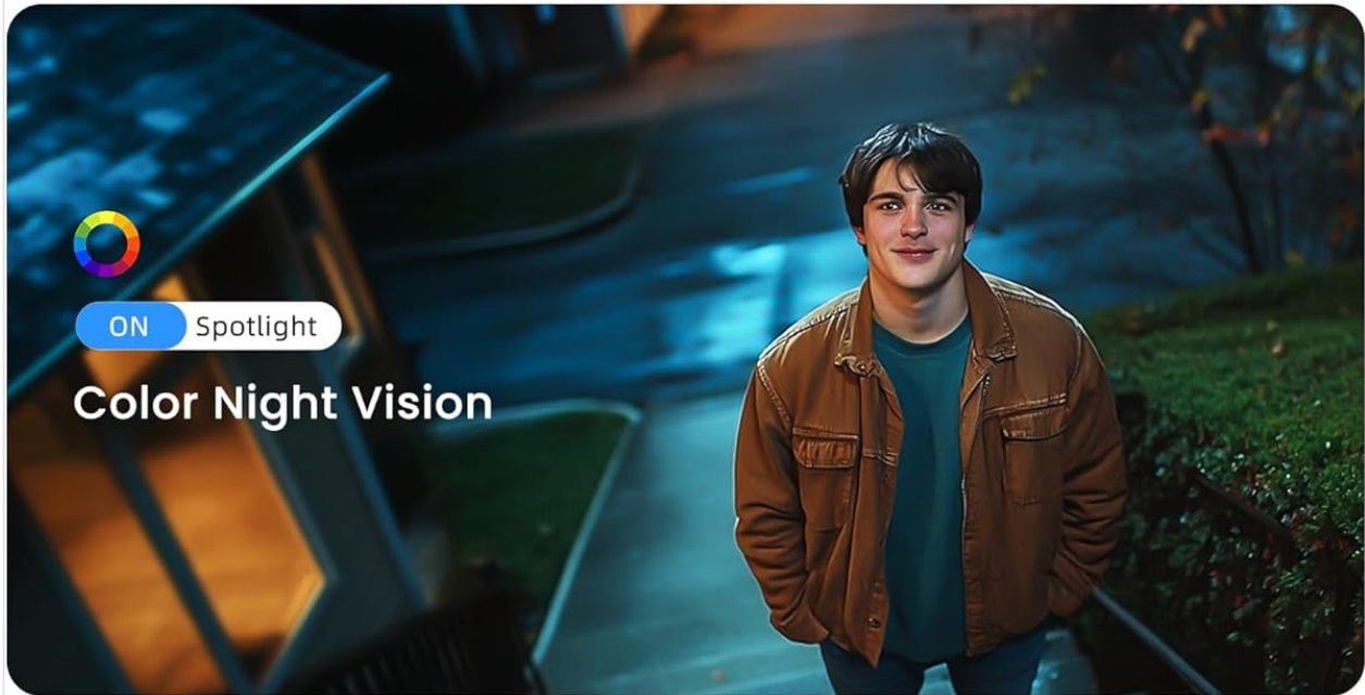
Image 4.2: Comparison of color night vision and infrared night vision.