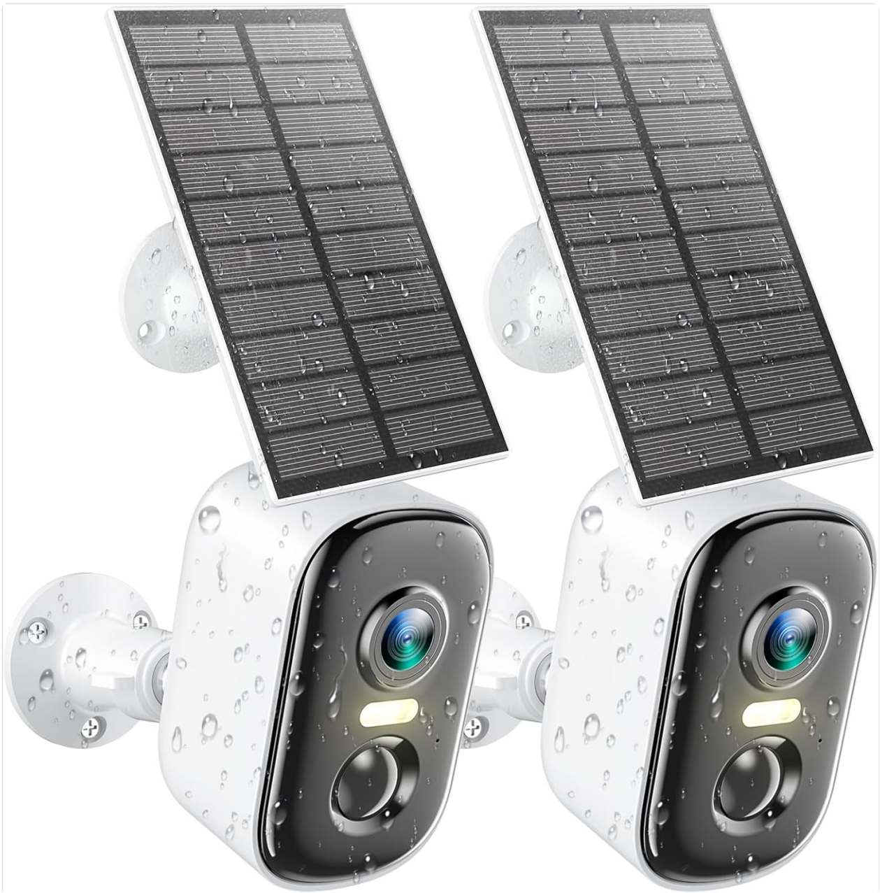
Image 1.1: Two MISECU 2K Solar Cameras with solar panels, showcasing their weather-resistant design.