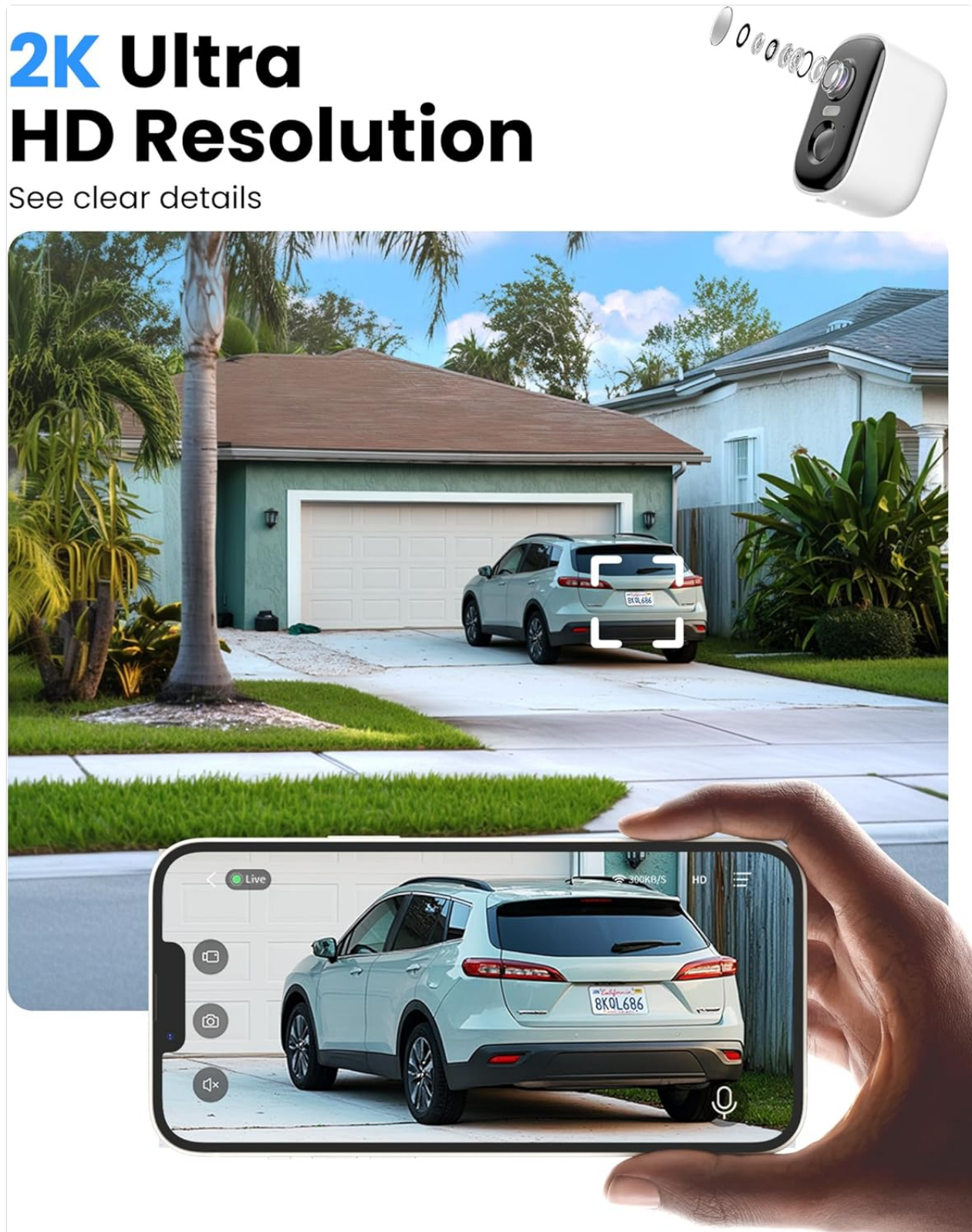
Image 4.1: Live view on a smartphone demonstrating 2K Ultra HD resolution.

The camera provides 2K Ultra HD resolution for clear and detailed video footage. This enhanced resolution allows for better identification of objects and individuals within the camera's field of view.