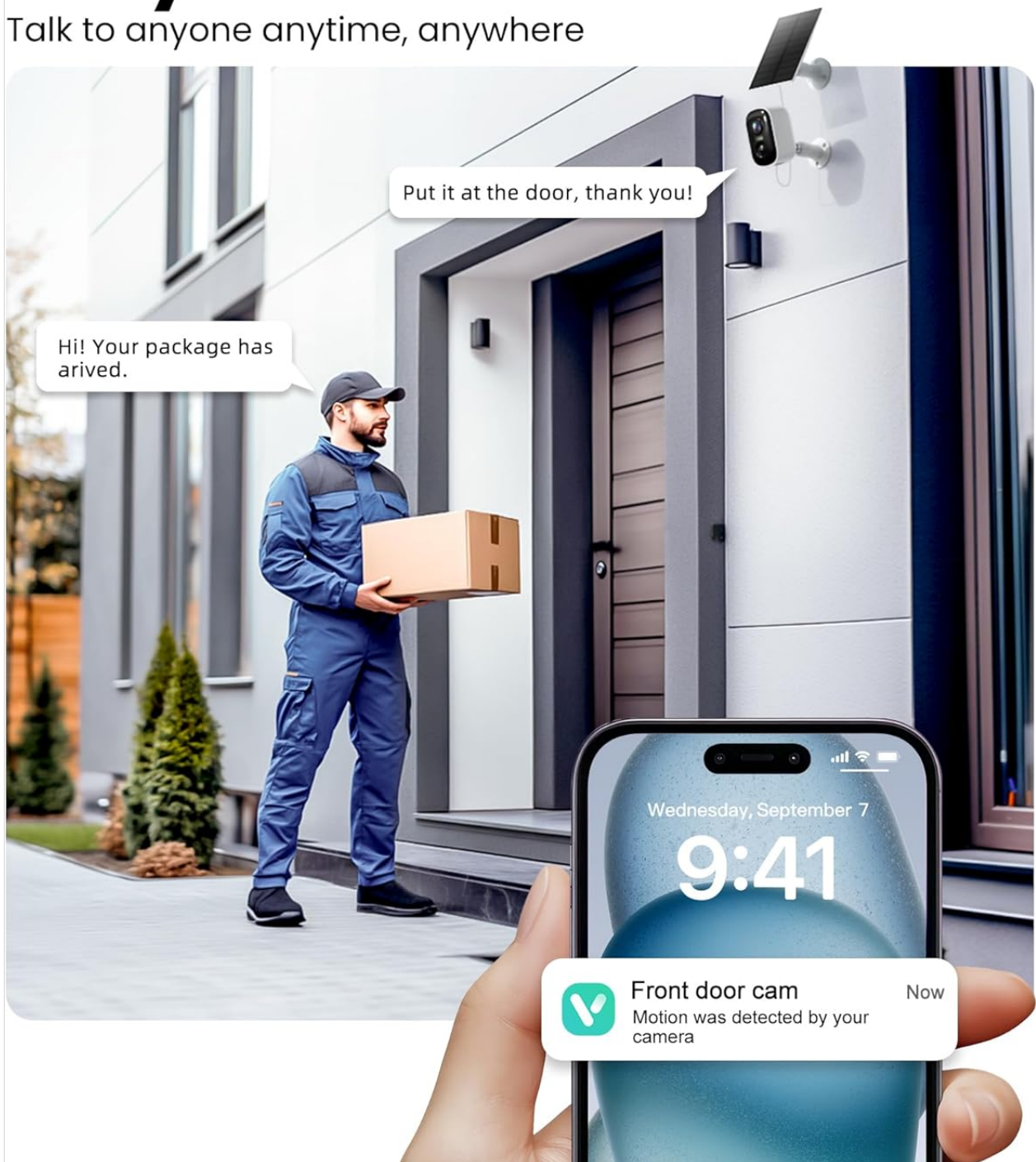
Image 4.4: Demonstrating the two-way talk feature with a delivery person.