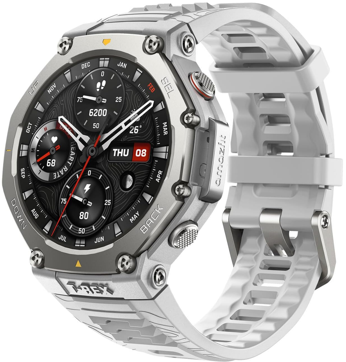
The Amazfit T-Rex 3 Smart Watch in Haze Gray, showcasing its rugged design and digital watch face.