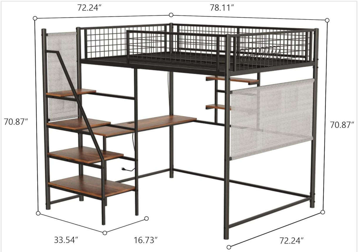
Image: Overall dimensions of the loft bed, including length, width, and height.