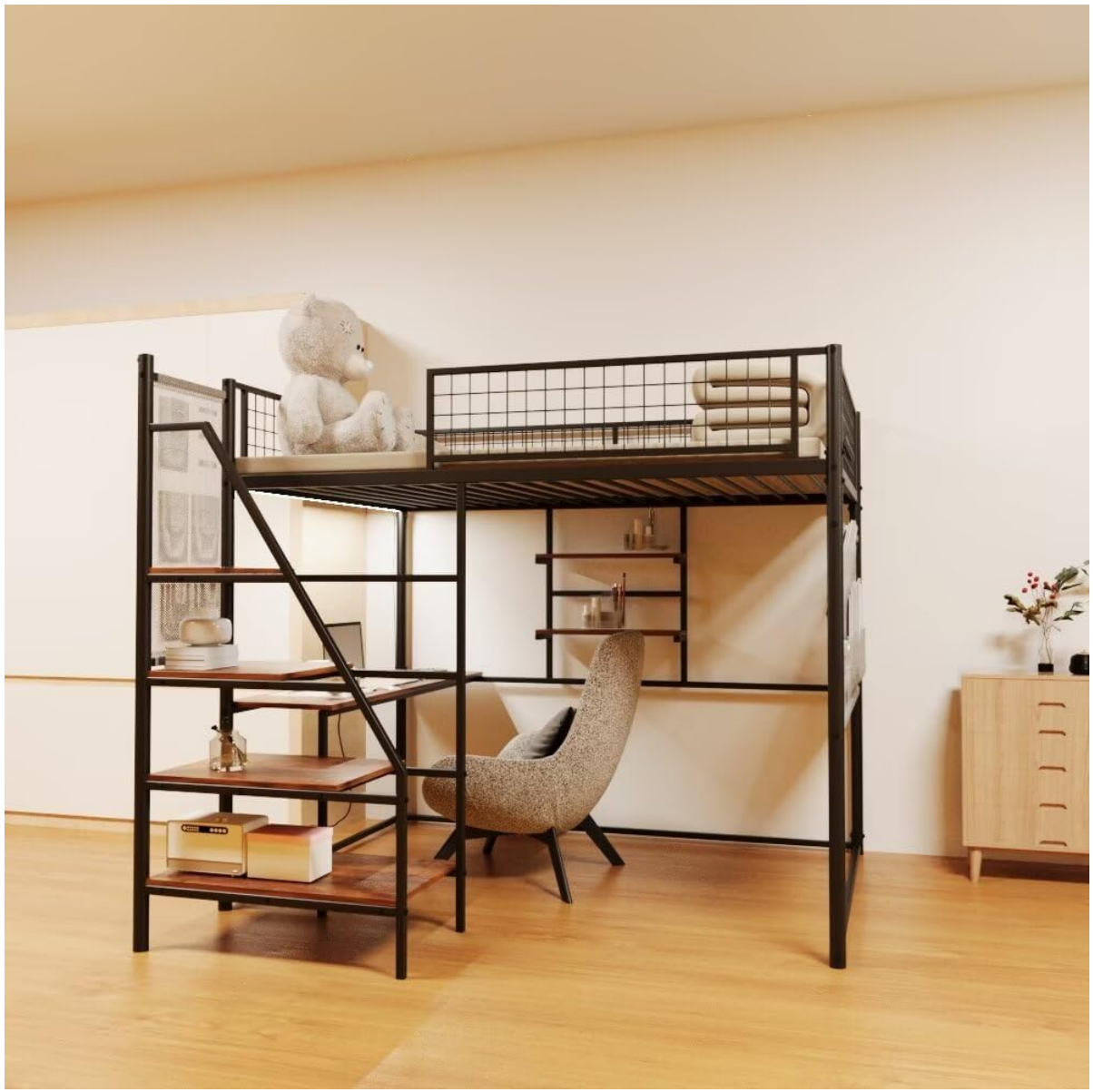
Image: Fully assembled loft bed showcasing the integrated desk and storage shelves.