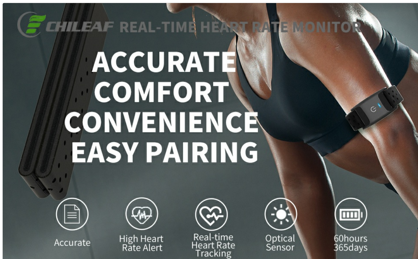
Image: A person wearing the CHILEAF Heart Rate Monitor Armband on their forearm, demonstrating the recommended placement for accurate readings.