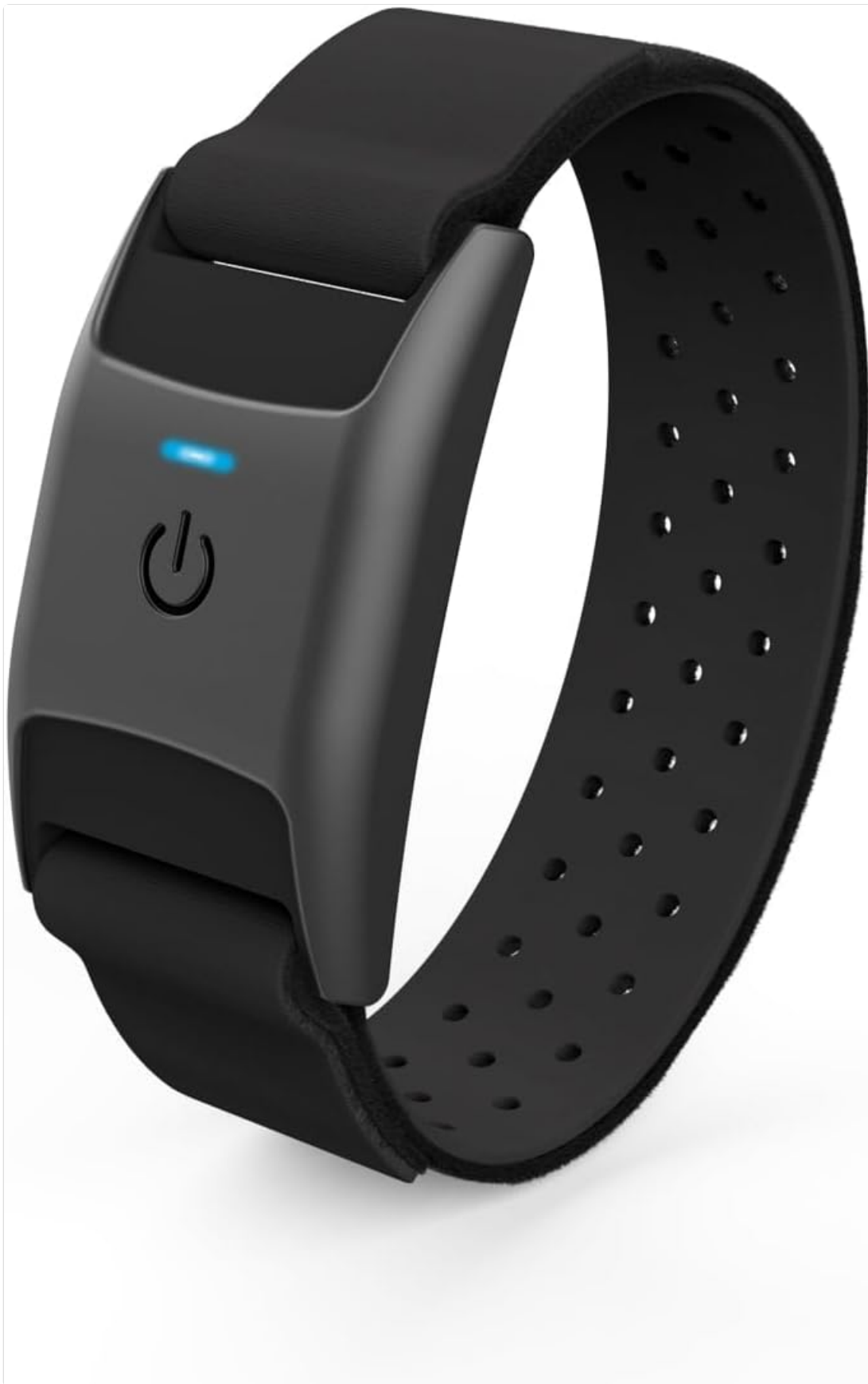
Image: The CHILEAF Heart Rate Monitor Armband, featuring a sleek black design with a power button and an LED indicator light.