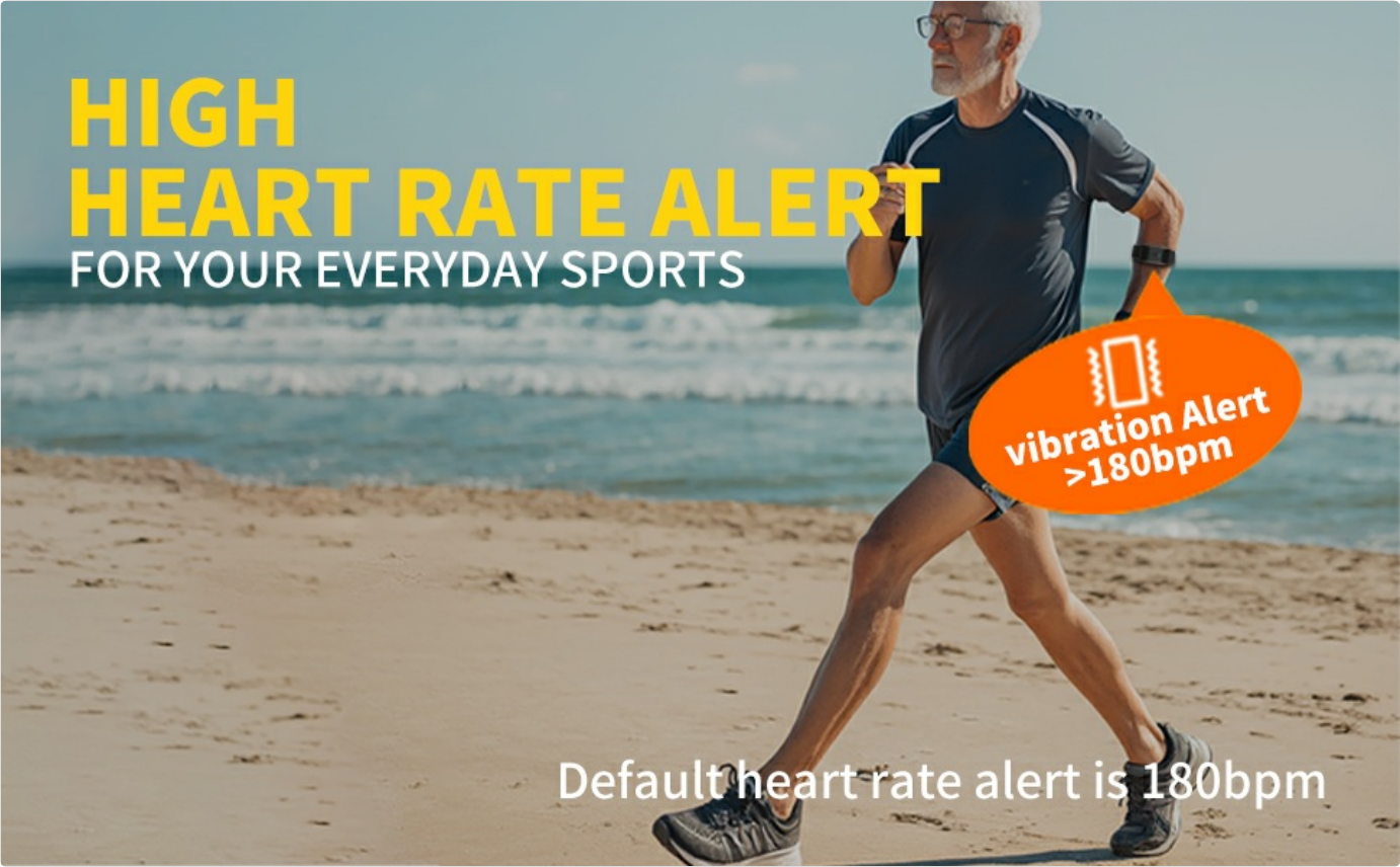
Image: A visual showing a person running with an overlay indicating a vibration alert for heart rates above 180 bpm.