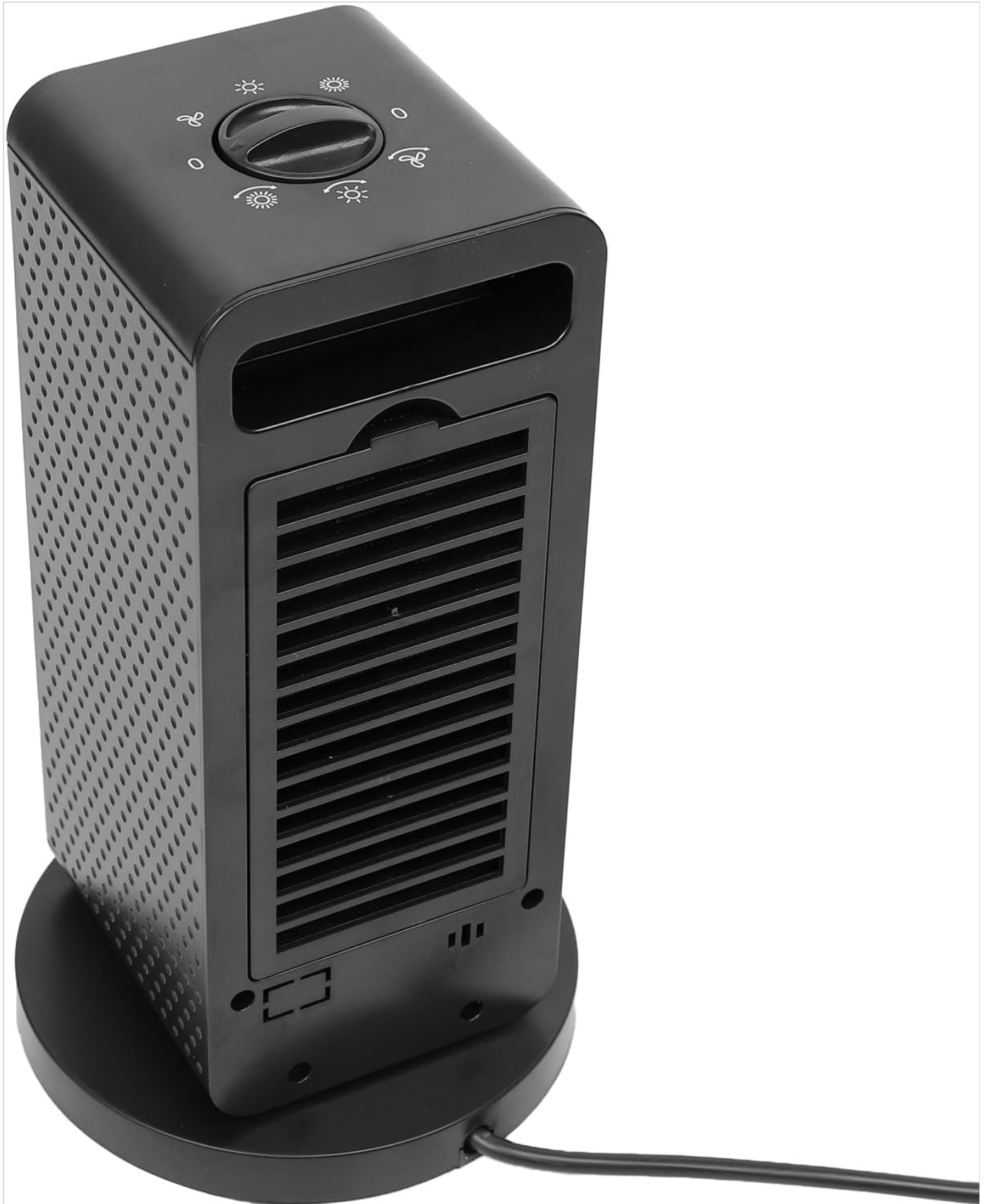
Figure 3: Close-up of the control panel on the top of the Pasapair Space Heater, showing mode and oscillation controls.

The Pasapair Space Heater features a control panel on the top for easy operation.