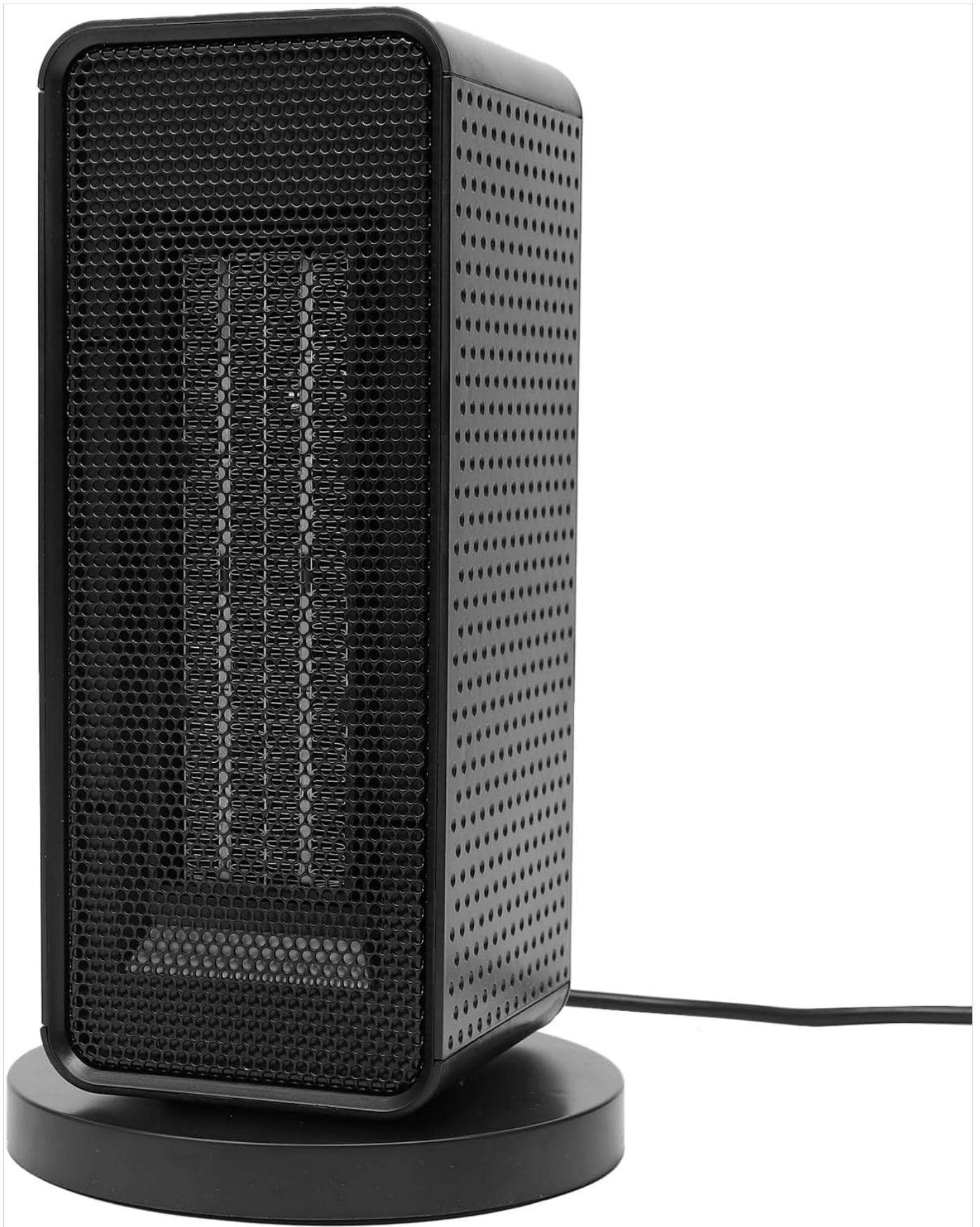
Figure 1: Front view of the Pasapair 1200W Space Heater. Shows the black mesh grille covering the heating element.