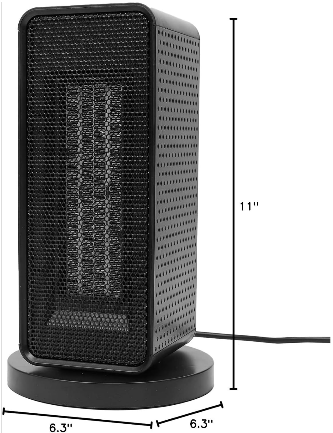
Figure 5: Pasapair 1200W Space Heater with its dimensions (6.3"D x 6.3"W x 11"H) clearly indicated.