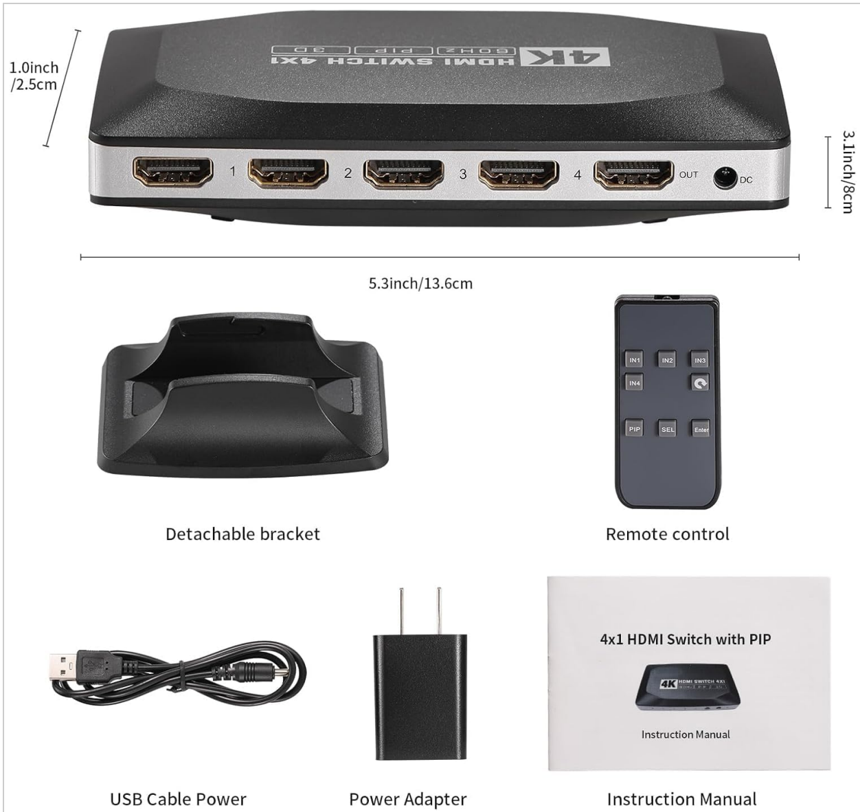
Image: A visual representation of the Tendak 4K HDMI Switch Box and its accessories, including the main unit, remote control, power adapter, USB power cable, detachable bracket, and the instruction manual.