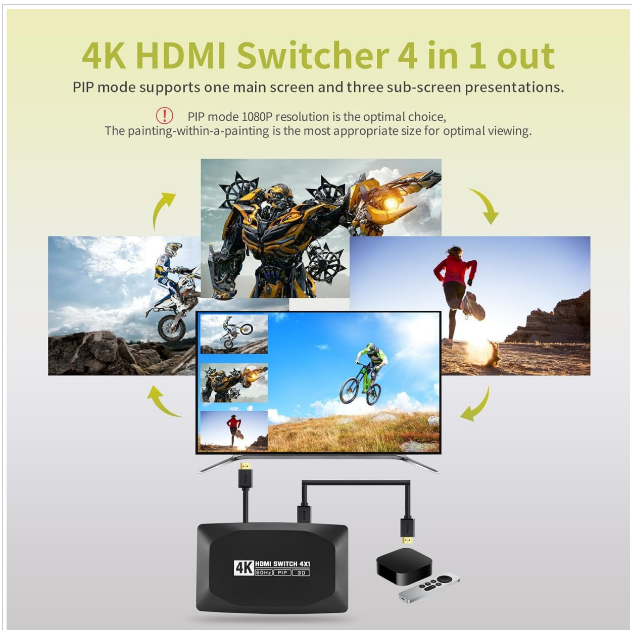
Image: A visual demonstration of the Picture-in-Picture (PIP) mode, displaying a large central image from one source and three smaller images from other sources around it, with the Tendak HDMI Switch Box and remote control shown below.