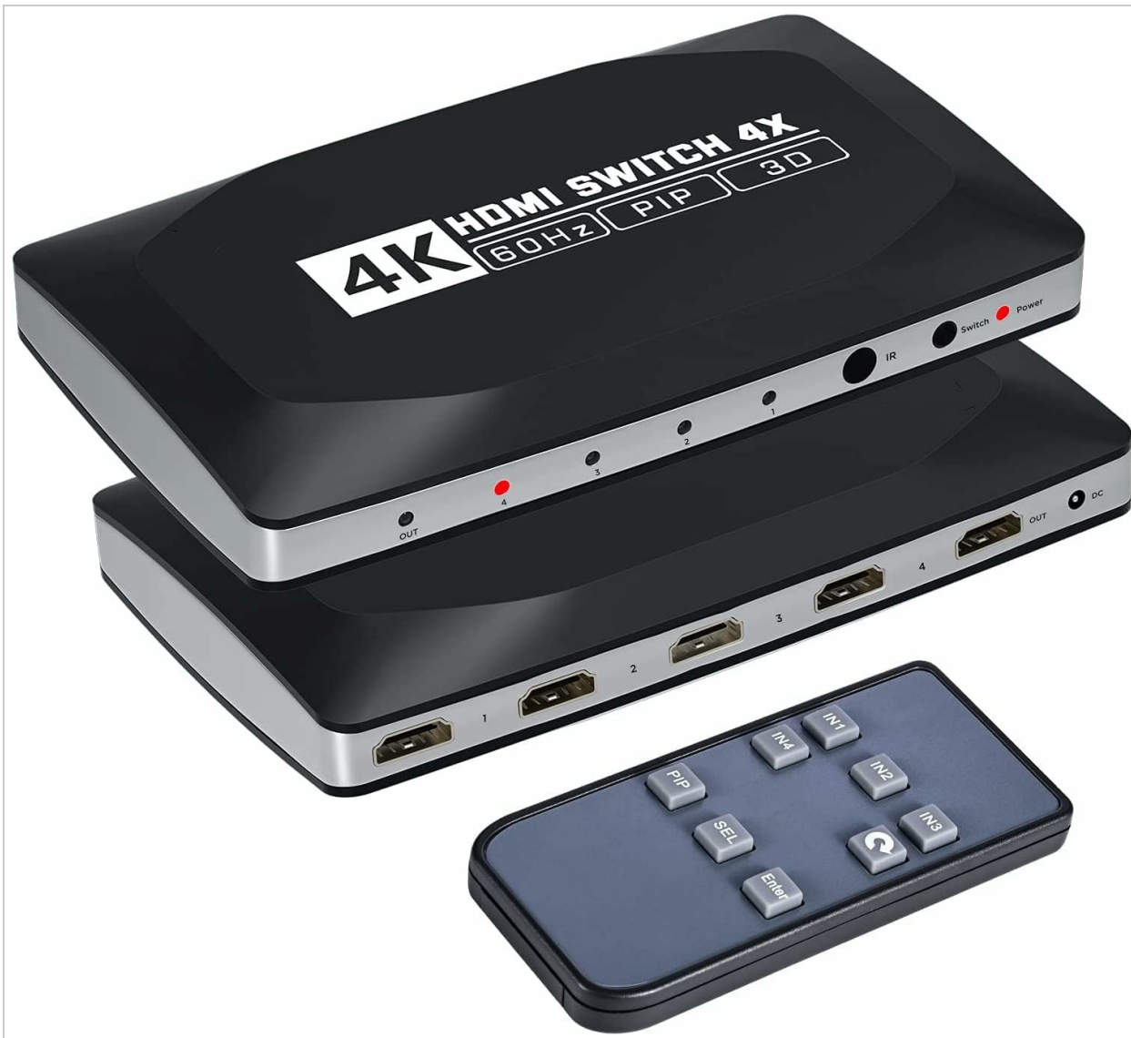
Image: The Tendak 4K HDMI Switch Box, its remote control, and power adapter, displayed in front of a screen showing a high-resolution image.