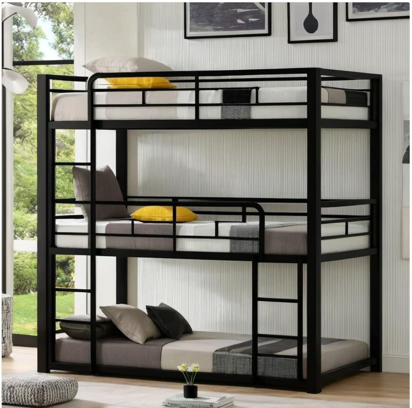
Figure 1: Fully assembled UOCFYK Metal Triple Bunk Bed, Full Over Full Over Full, in black finish, shown with mattresses and bedding.