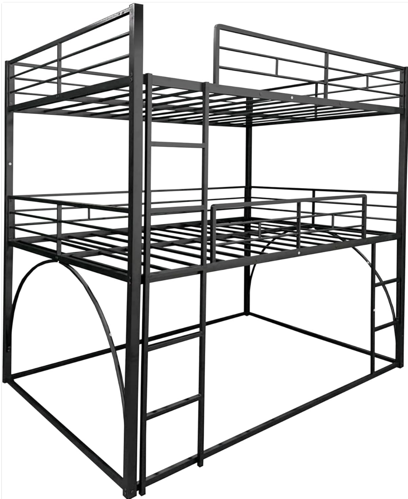
Figure 2: An angled view of the UOCFYK Metal Triple Bunk Bed frame during assembly, highlighting the metal slat support system.

Note: No box spring is required for this bunk bed. The integrated metal slats provide sufficient support for your mattress.