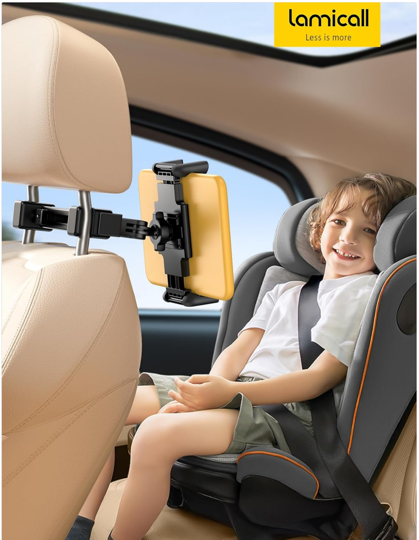
Image: A child comfortably interacting with a tablet mounted on the Lamicall Car Headrest Tablet Holder, demonstrating ease of access and entertainment during car rides.

This image highlights the user-friendly nature of the holder, allowing children to easily reach and control their devices, making long journeys more enjoyable.