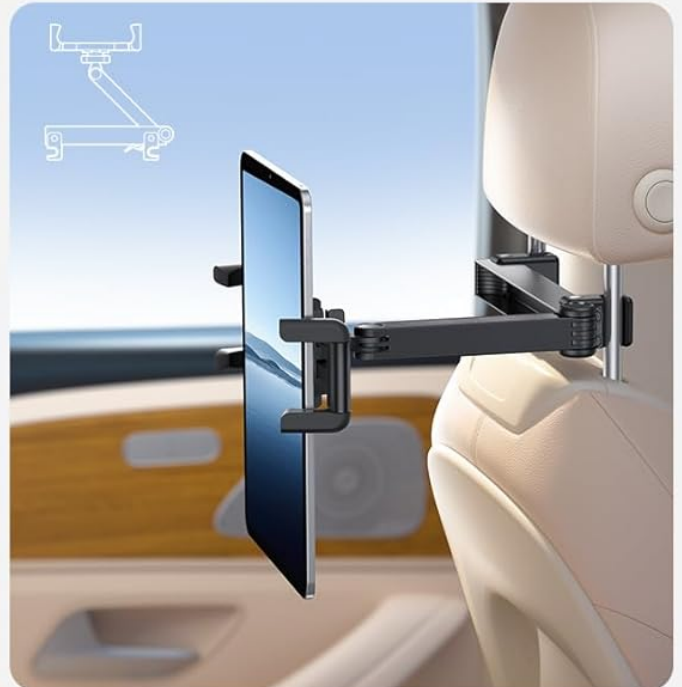
Image: The multi-angle extension arm allows for easy adjustment of the viewing distance and angle, providing optimal comfort for backseat viewers.

This image demonstrates the flexibility of the extension arm, which can be positioned to suit individual viewing preferences, ensuring a comfortable experience for all passengers.