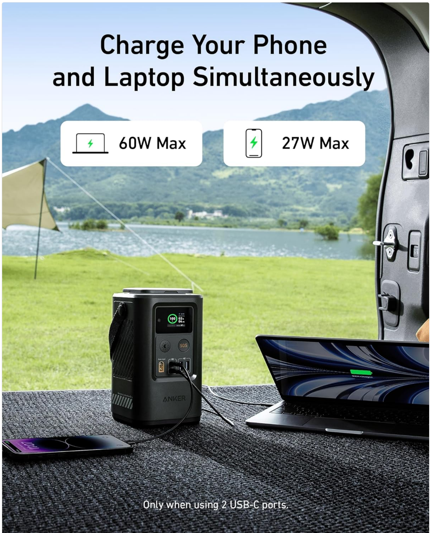
Image: The Anker Power Station in an outdoor setting, simultaneously charging a smartphone and a laptop, demonstrating its versatility.