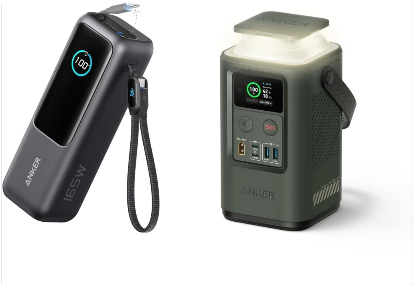
Image: The Anker Power Bank (left) and Anker Power Station (right), showcasing their compact designs and power indicators.

This manual provides detailed instructions for the Anker Power Bank 25K 165W and the Anker Power Station 60,000mAh 87W. These devices are designed to provide reliable portable power for a wide range of electronic devices, from smartphones and tablets to laptops and other high-power gadgets.