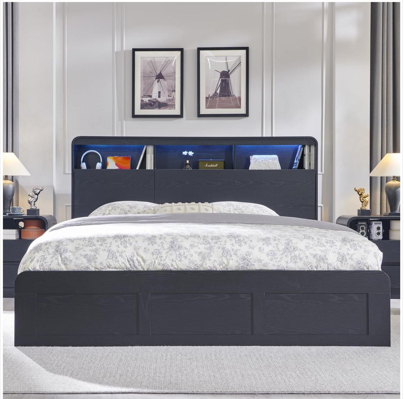
Image: The Aitjuz King Size Bed Frame with its 50-inch tall headboard and integrated LED lighting.