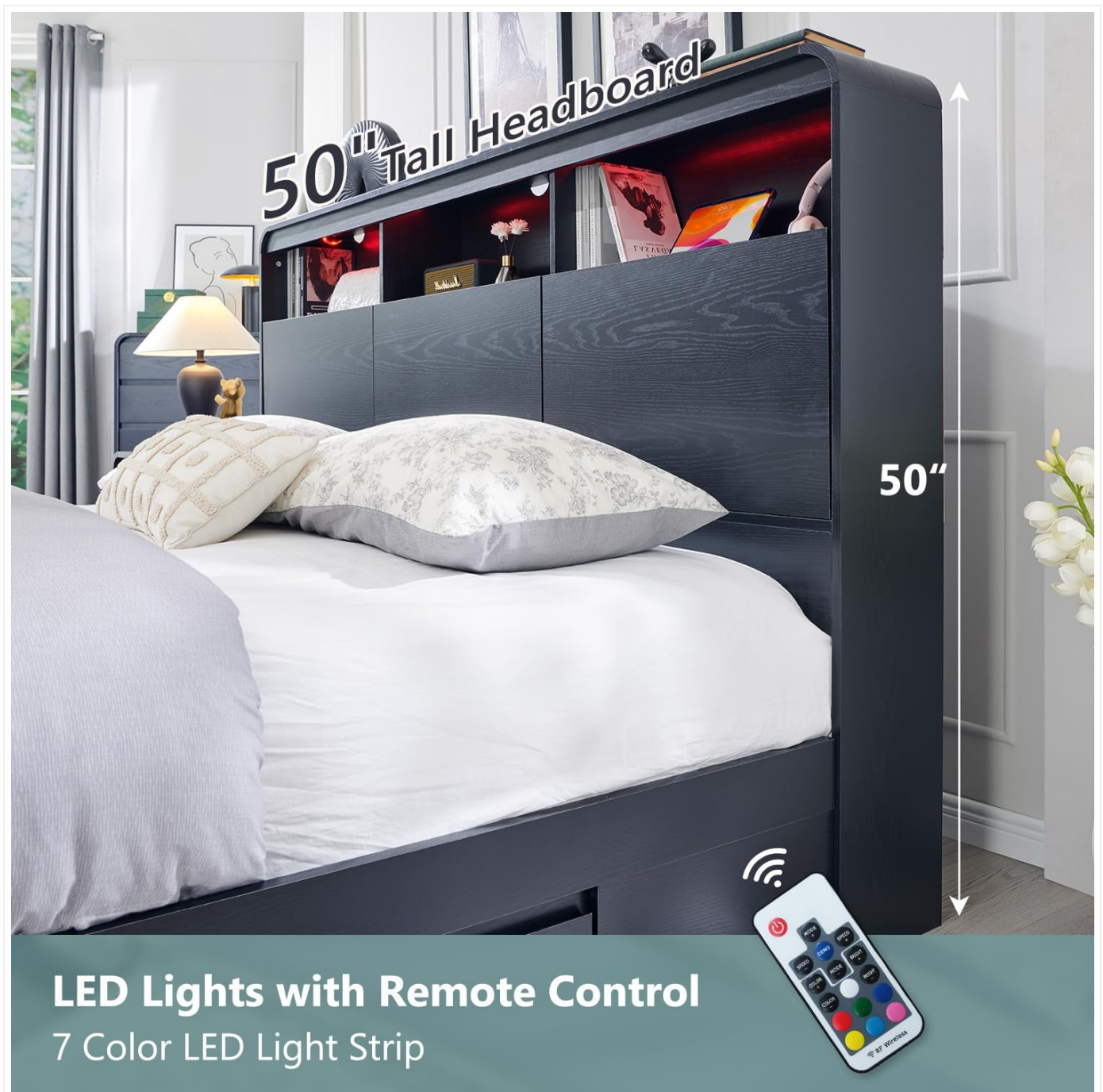
Image: The 50-inch tall headboard with the LED light strip illuminated, alongside the remote control for color and brightness adjustments.