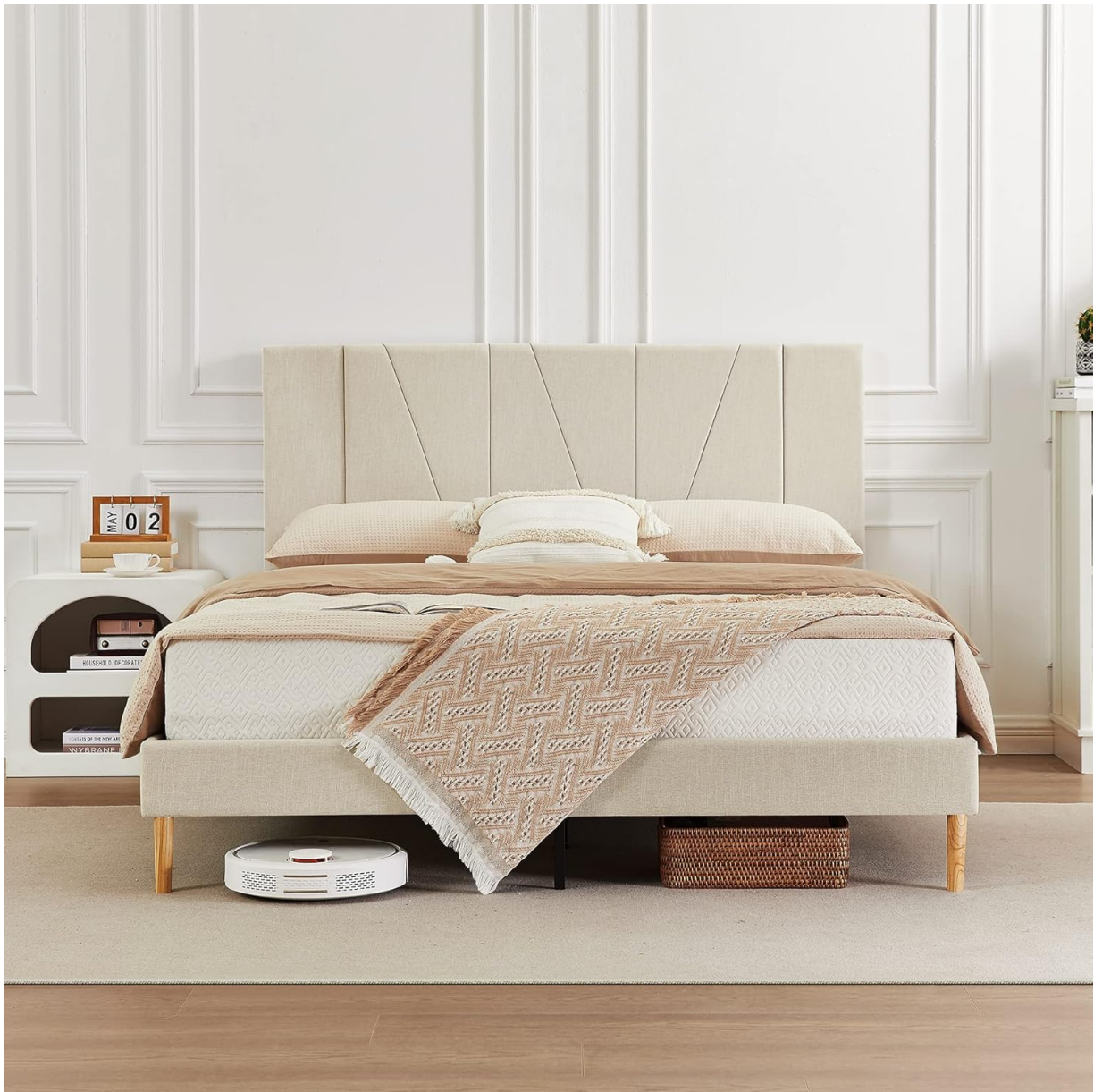
Image 1.1: Fully assembled Flolinda Queen Size Upholstered Platform Bed Frame.