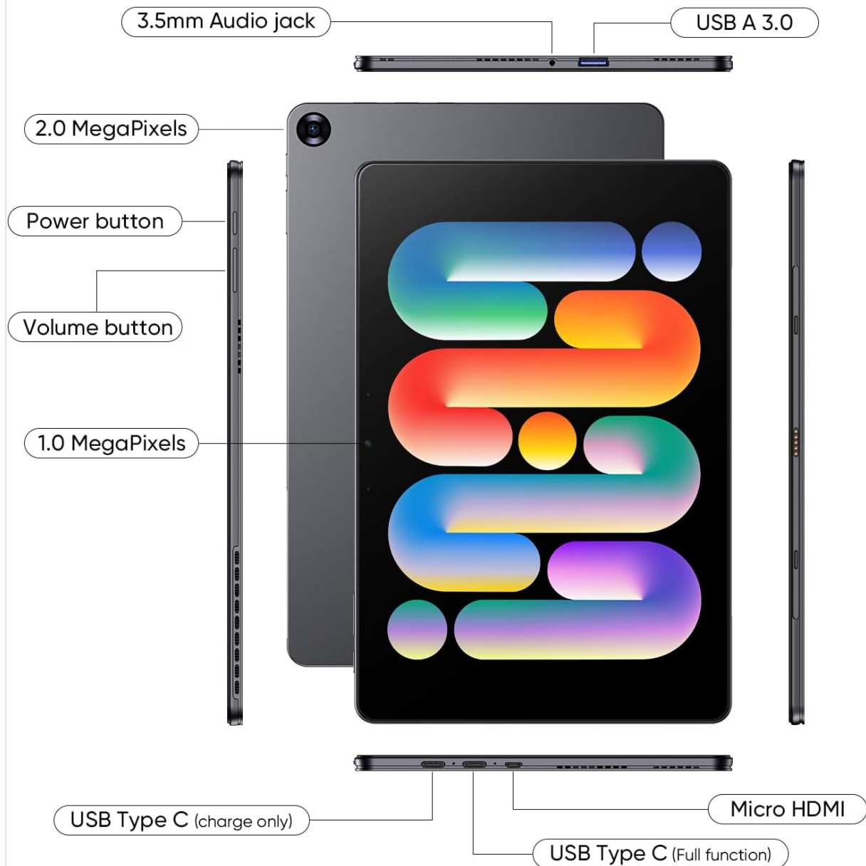
Image: Diagram illustrating the various ports and buttons on the AE86 tablet, including USB A 3.0, 3.5mm Audio jack, Power button, Volume button, USB Type C (charge only), USB Type C (full function), and Micro HDMI.