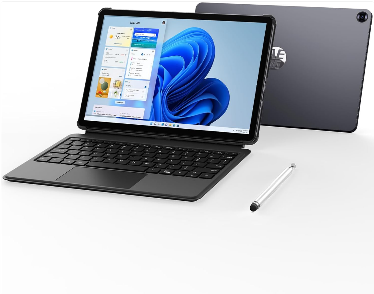
Image: The AE86 2-in-1 Tablet/Laptop shown with its detachable keyboard and stylus pen, illustrating the complete package.