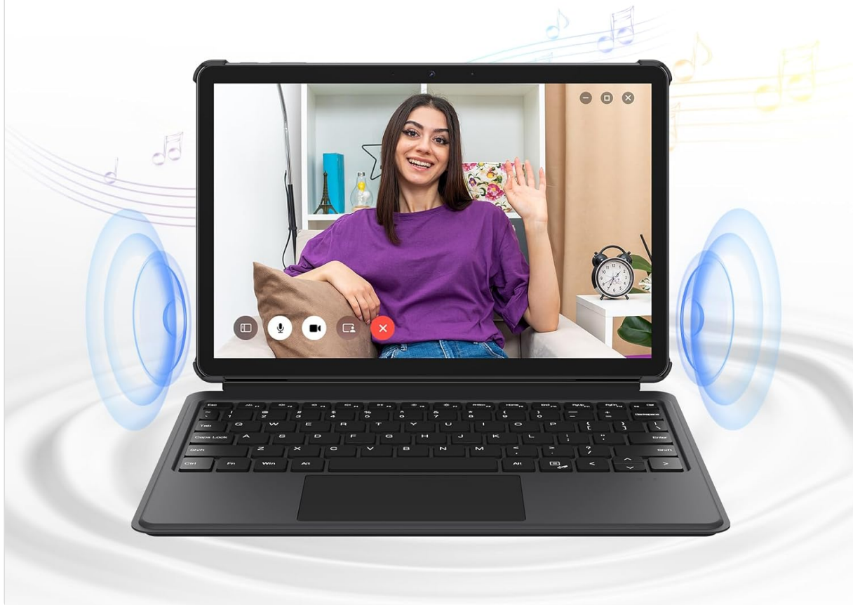
Image: The AE86 tablet displaying content, with icons highlighting its HD Camera, Stereo speakers, WiFi, and Bluetooth 4.2 capabilities, contributing to an immersive audio-visual experience.