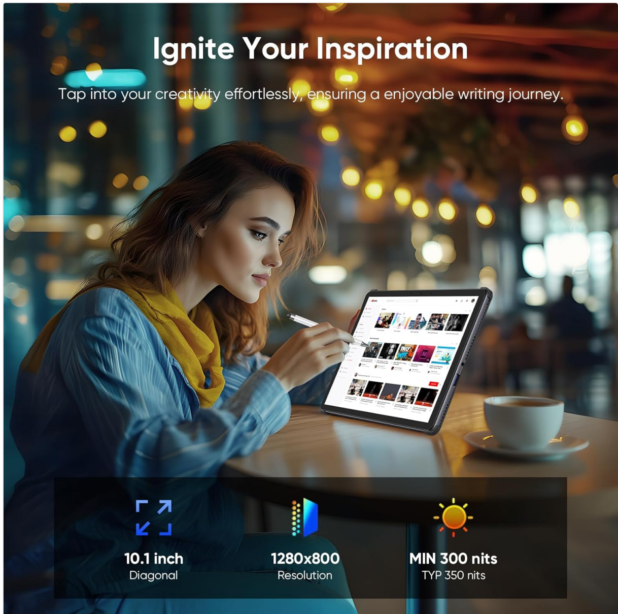
Image: A person using the AE86 tablet with the stylus pen, demonstrating its use for creative tasks and note-taking.