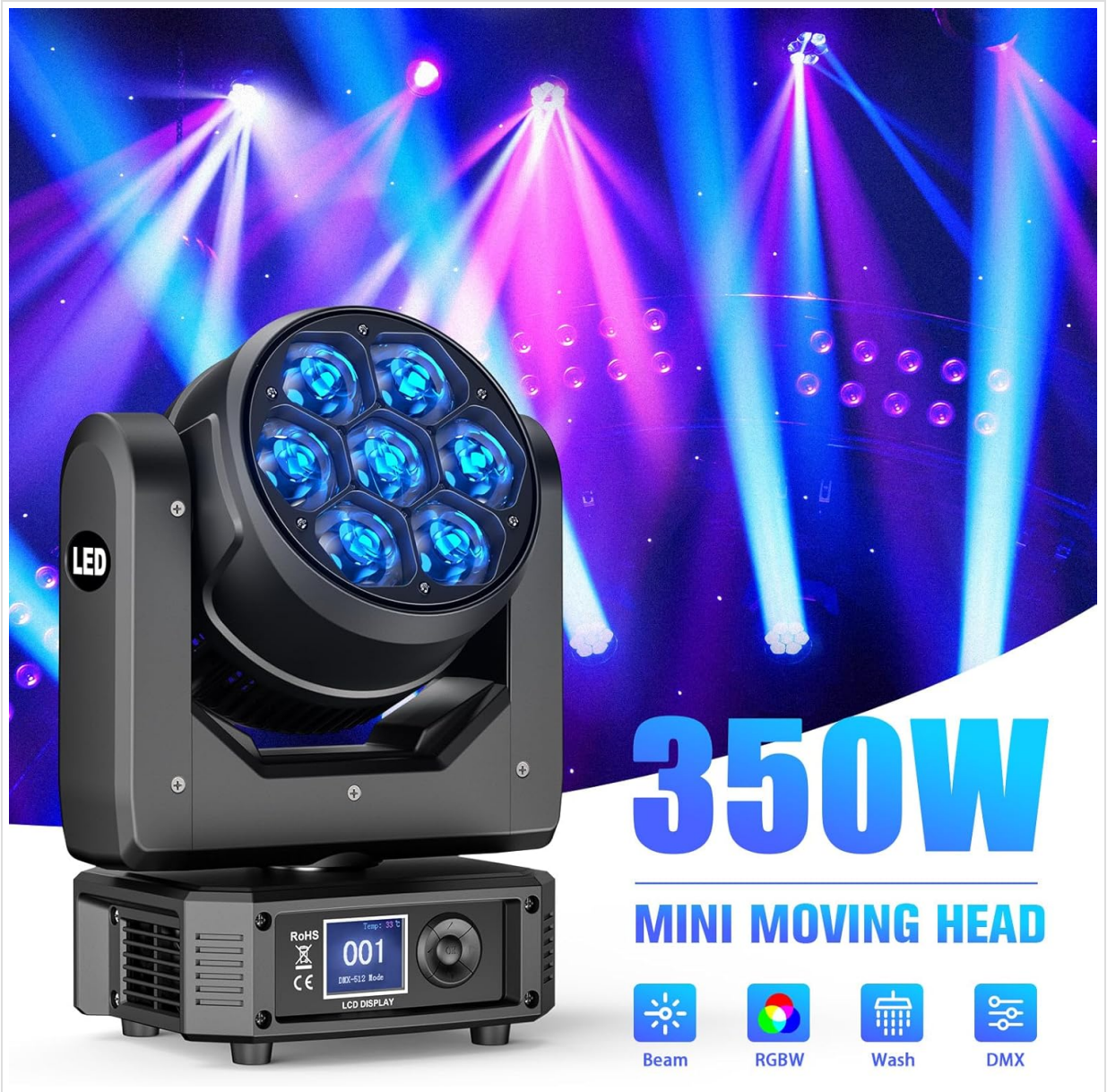
The HOLDLAMP ZQ02356US Mini Moving Head DJ Light, highlighting its 350W power and capabilities including Beam, RGBW, Wash, and DMX control.