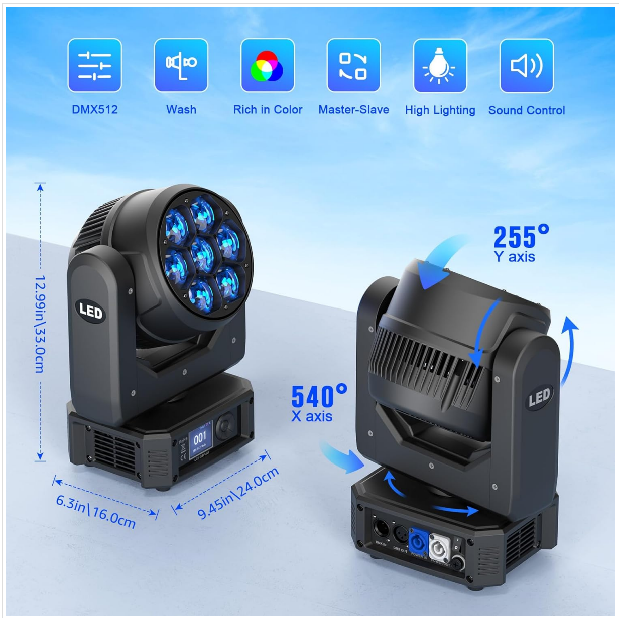
An illustration showing the dimensions of the light and its pan (540° X-axis) and tilt (255° Y-axis) movement capabilities.