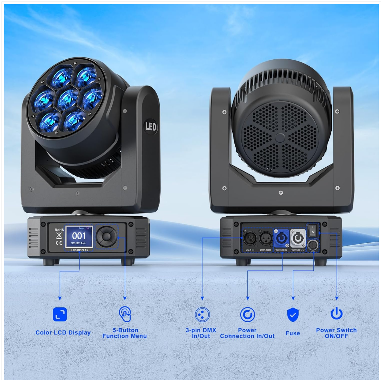
The rear panel of the light fixture, detailing the DMX input/output, power input/output, fuse, and power switch for connections.