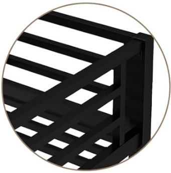
Large thick metal bracket