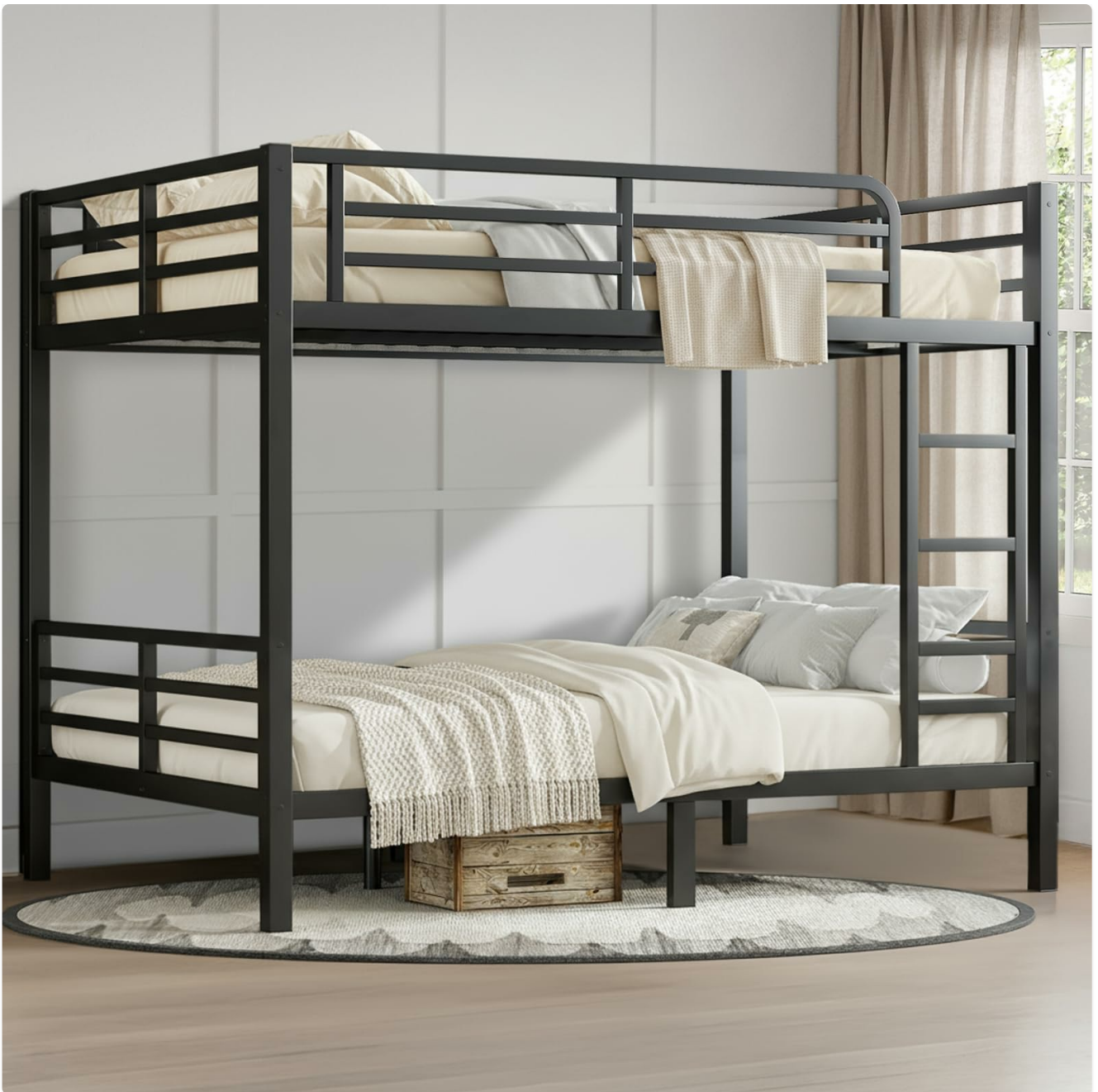
Image: Assembled HKOLIE Full Over Full Metal Bunk Bed in black finish.