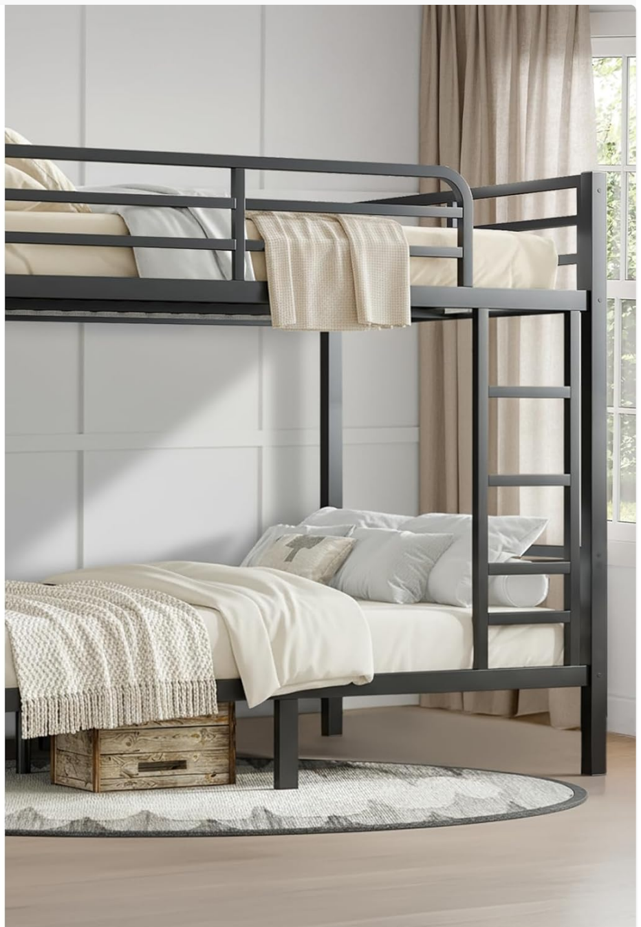
Image: Detailed view of the bunk bed's sturdy metal construction, including brackets, support slats, and additional