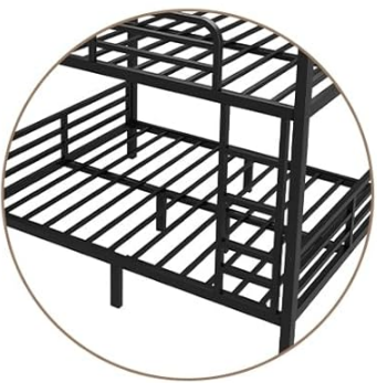
12 metal strips for support