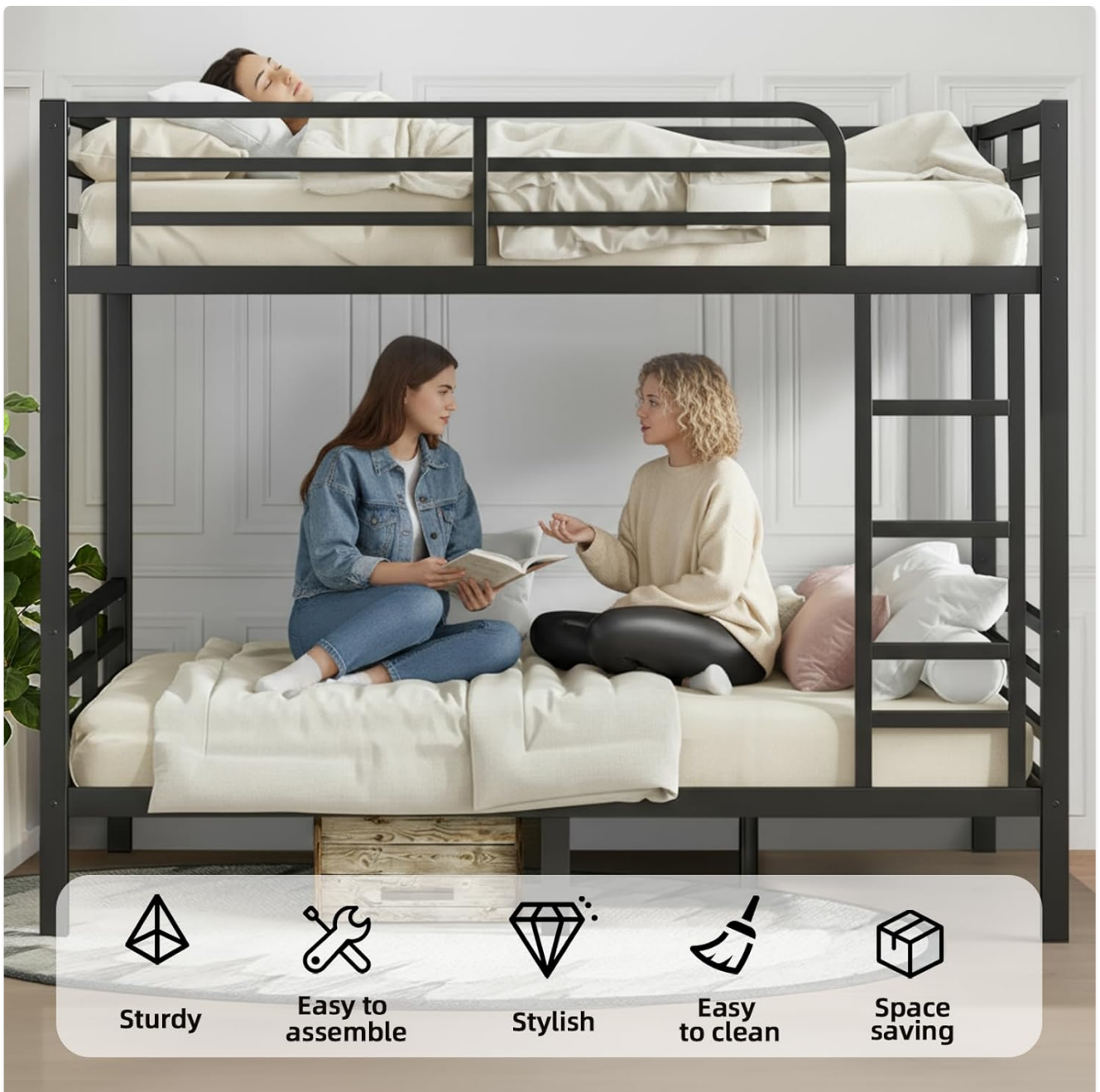
Image: Users enjoying the bunk bed, demonstrating its sturdy, easy-to-assemble, stylish, easy-to-clean, and space-saving features.