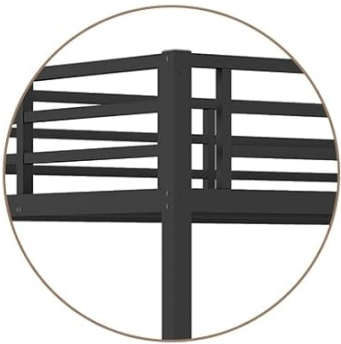
Additional support legs