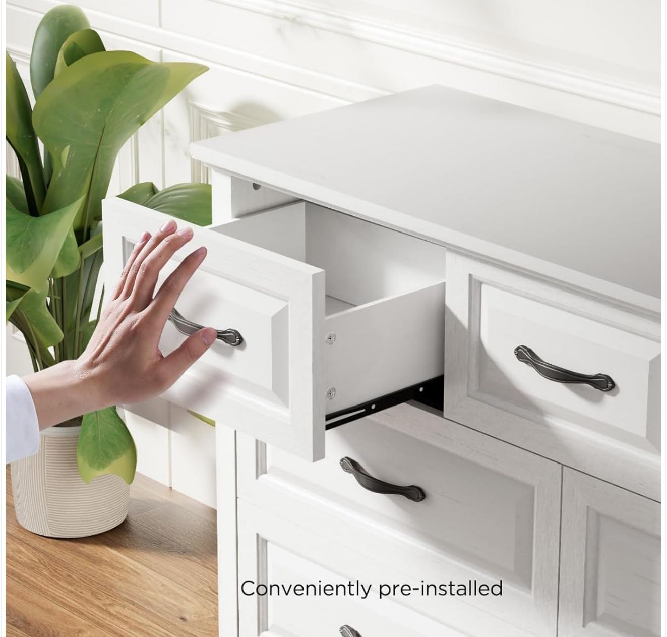
Image: A hand demonstrating the smooth, quiet operation of a drawer, highlighting the pre-installed metal drawer slides.