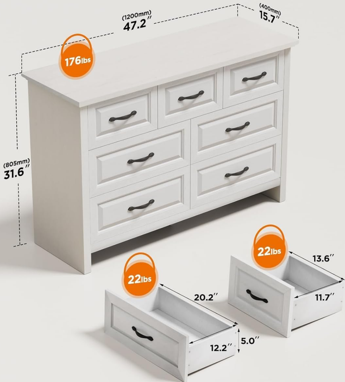
Image: A detailed diagram illustrating the overall dimensions of the dresser (47.2" W x 15.7" D x 31.6" H) and individual drawer dimensions, along with weight capacities.