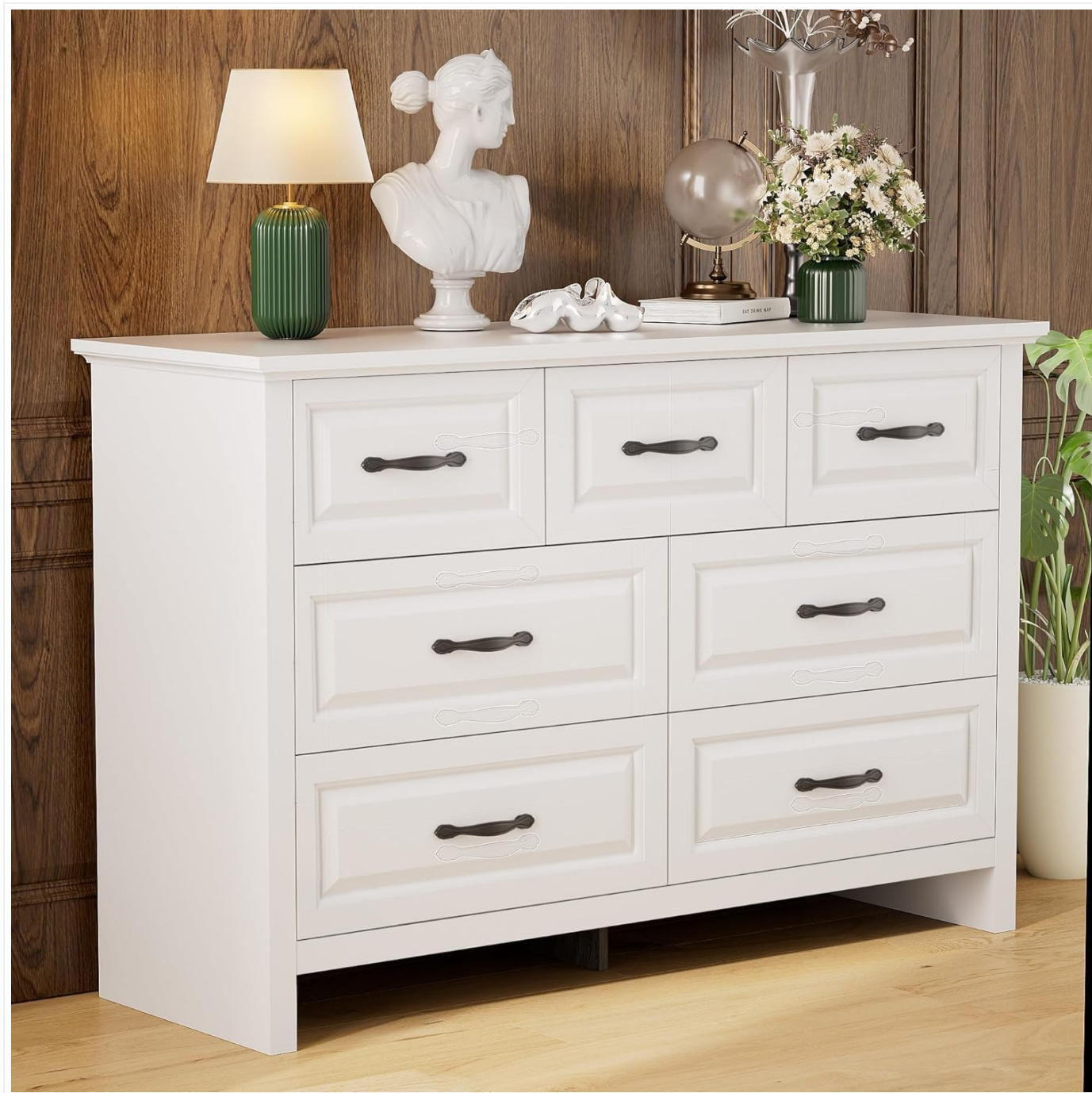
Image: The Pipishell White 7-Drawer Dresser, showcasing its design and storage capacity in a room.