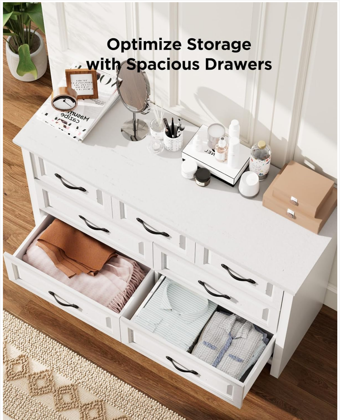
Image: An aerial view of the dresser with several drawers open, revealing neatly folded clothes, illustrating its spacious storage capabilities.