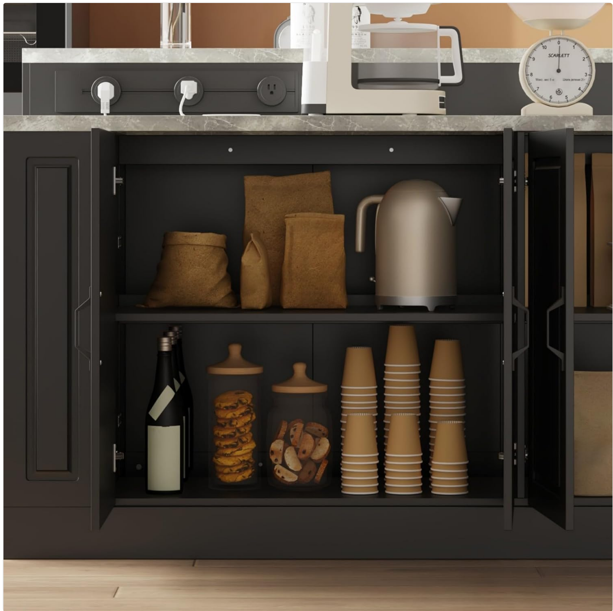
Image: An open cabinet revealing organized storage space for various kitchen essentials.