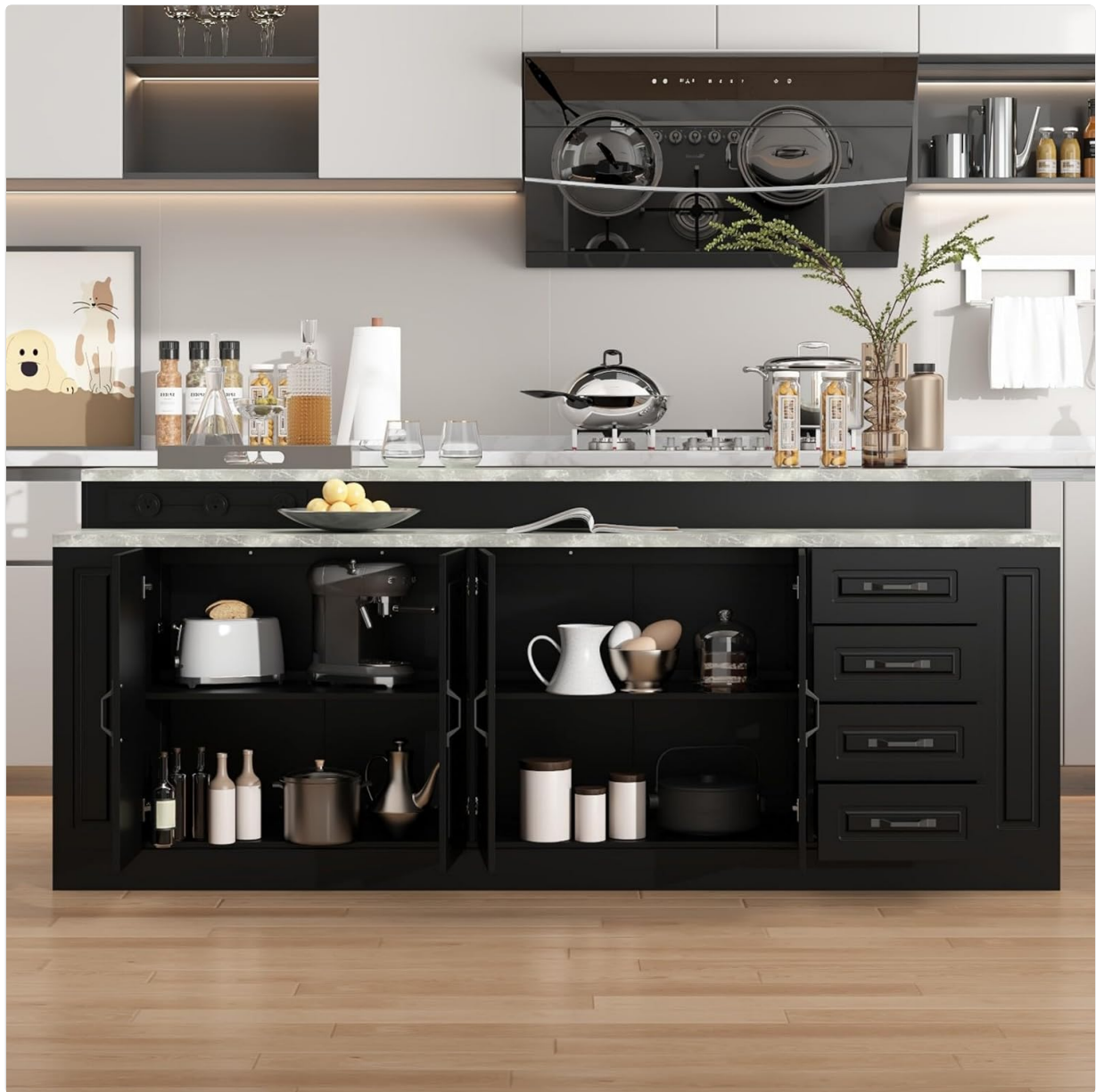
Image: The FAMAPY Large Stationary Kitchen Island, featuring its spacious design, open cabinets, and drawers, with a marble grey countertop.