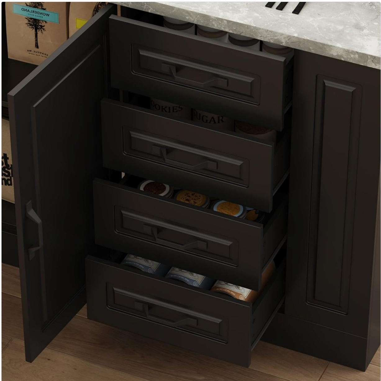
Image: Open drawers showcasing organized storage for smaller kitchen items.