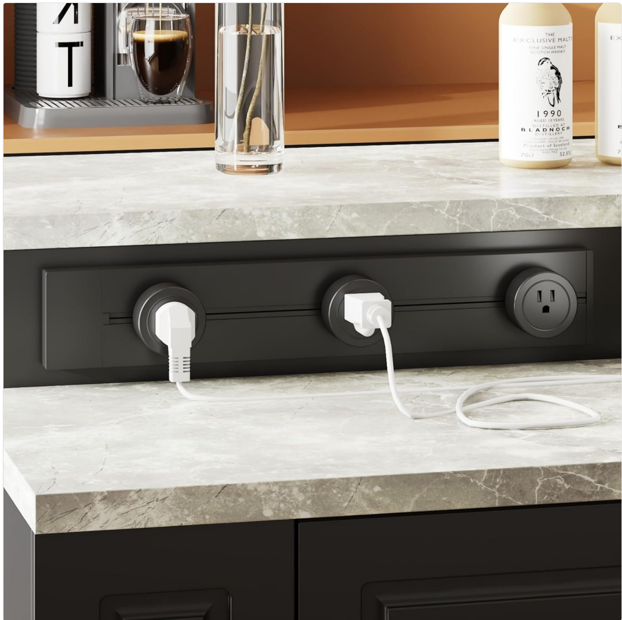
Image: A detailed view of the integrated charging station with multiple power outlets.