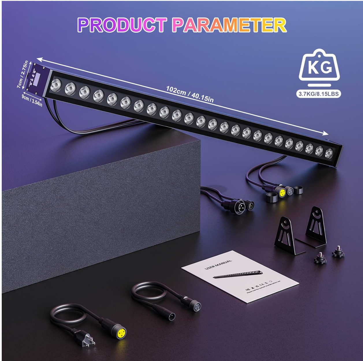
Image 3.1: The complete package contents of the Sparklingtrack ZQ06139 LED Wall Washer Stage Light Bar.