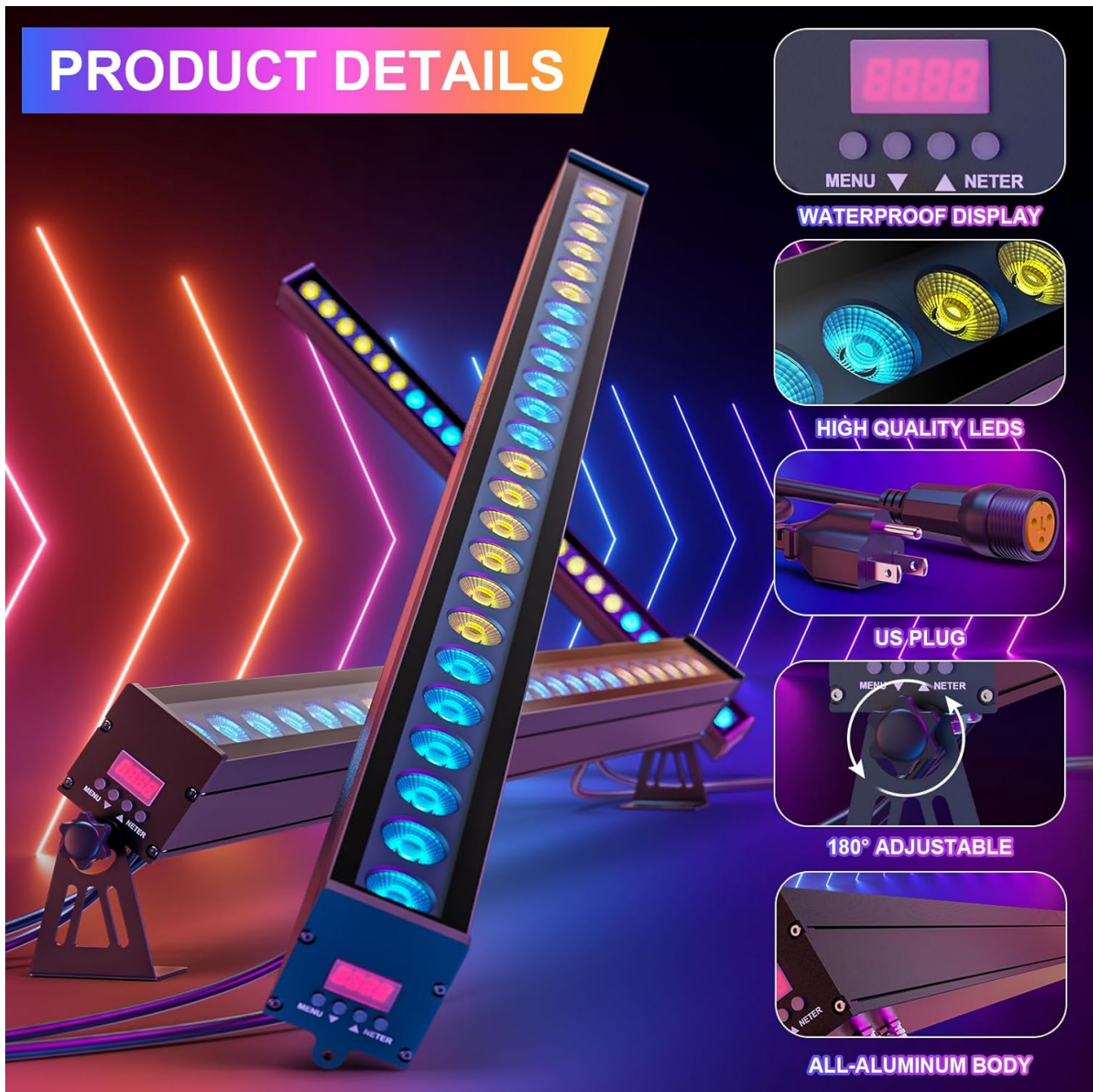
Image 4.2: Detailed view of the product's components and adjustable features.