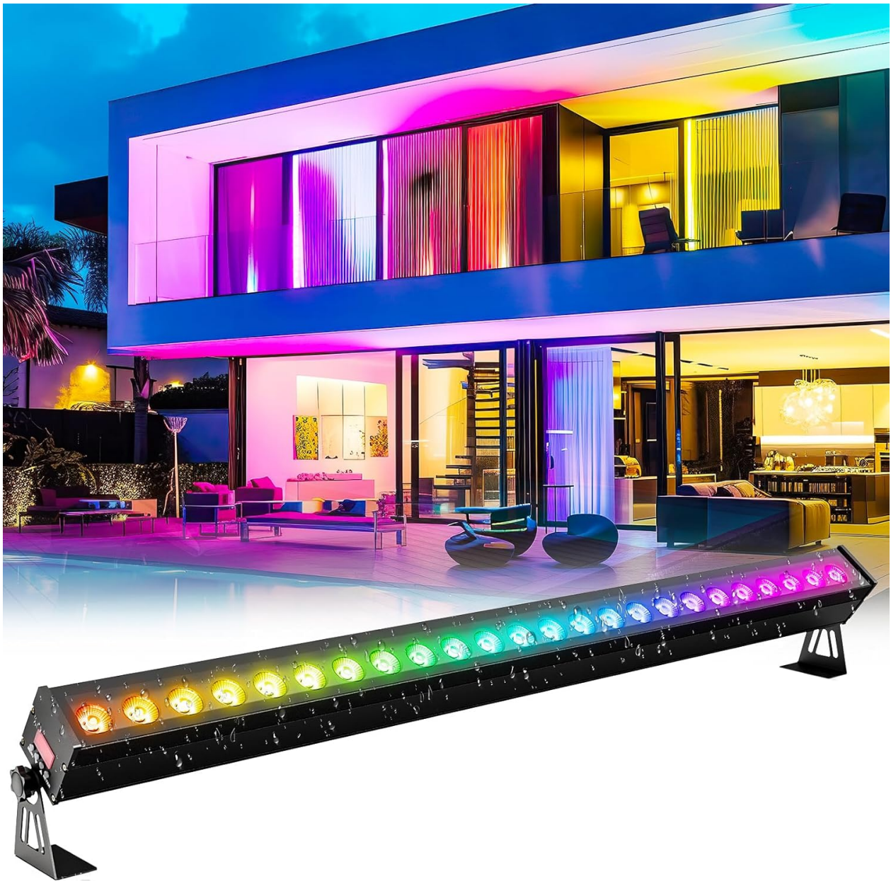
Image 1.1: The Sparklingtrack ZQ06139 LED Wall Washer Stage Light Bar illuminating a modern home exterior with dynamic RGB colors.