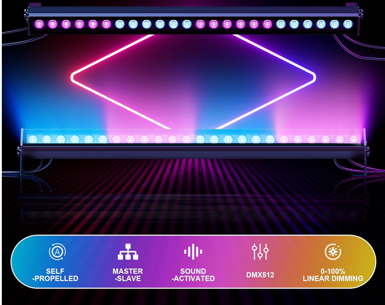
Image 6.2: Visual representation of the different control modes available.