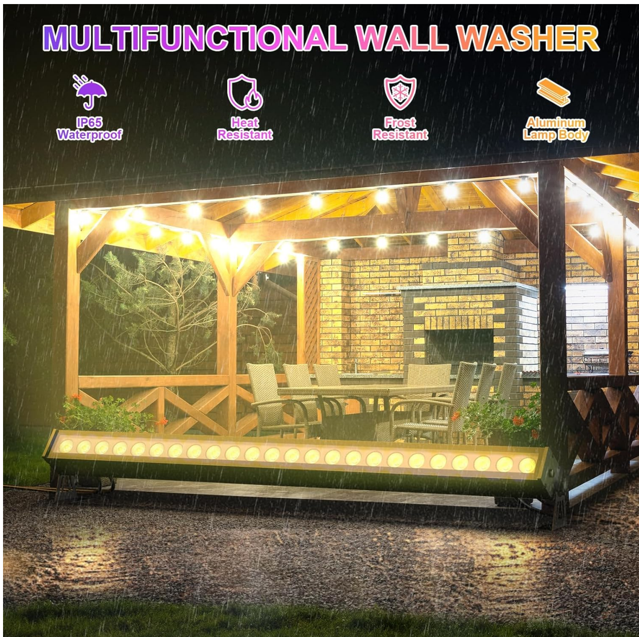
Image 4.1: The robust and weatherproof design of the Sparklingtrack ZQ06139.