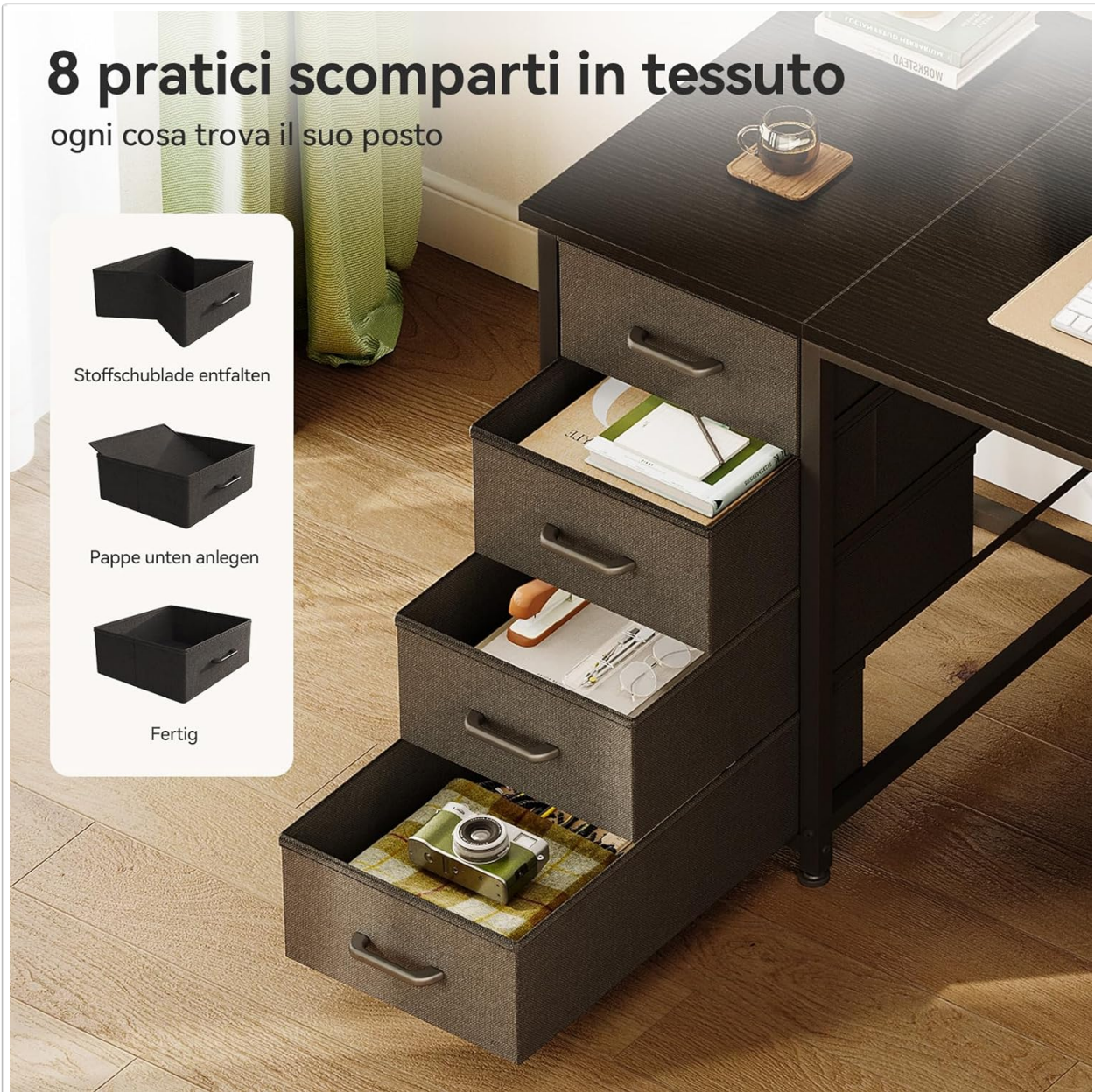
Illustration of the 8 practical fabric compartments, demonstrating their use for organizing various items. The inset shows the simple steps to prepare a fabric drawer for use.