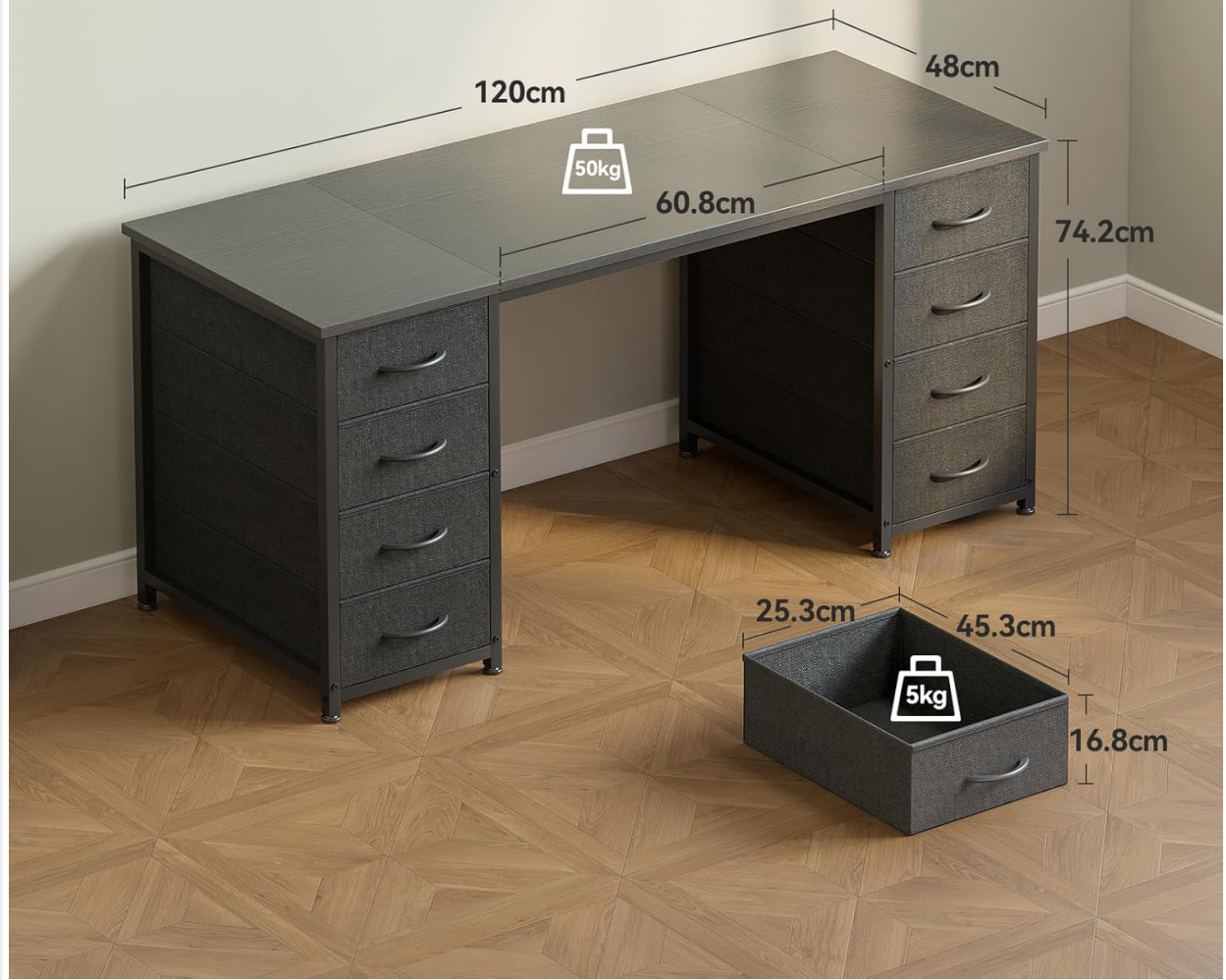
Desk dimensions and drawer capacity overview.