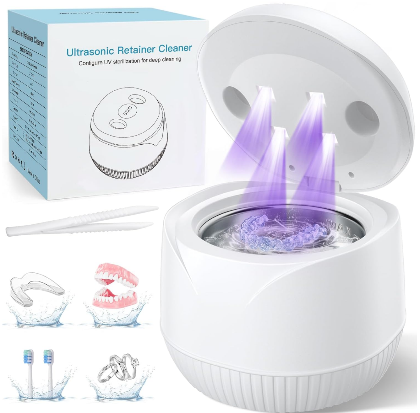
Image: The UEOFEN Ultrasonic Retainer Cleaner with its lid open, revealing the stainless steel cleaning tank inside. The device is white and compact.

Open the lid of the ultrasonic cleaner. Ensure the stainless steel tank is clean and free of debris.