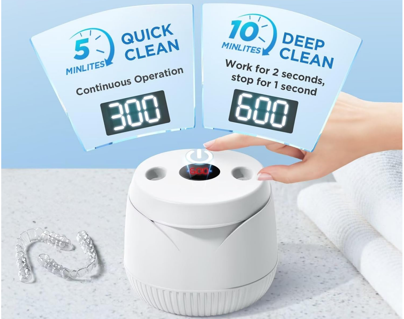
Image: A visual representation of the two cleaning modes available on the UEOFEN cleaner: a 5-minute quick clean and a 10-minute deep clean, both with digital timer displays.