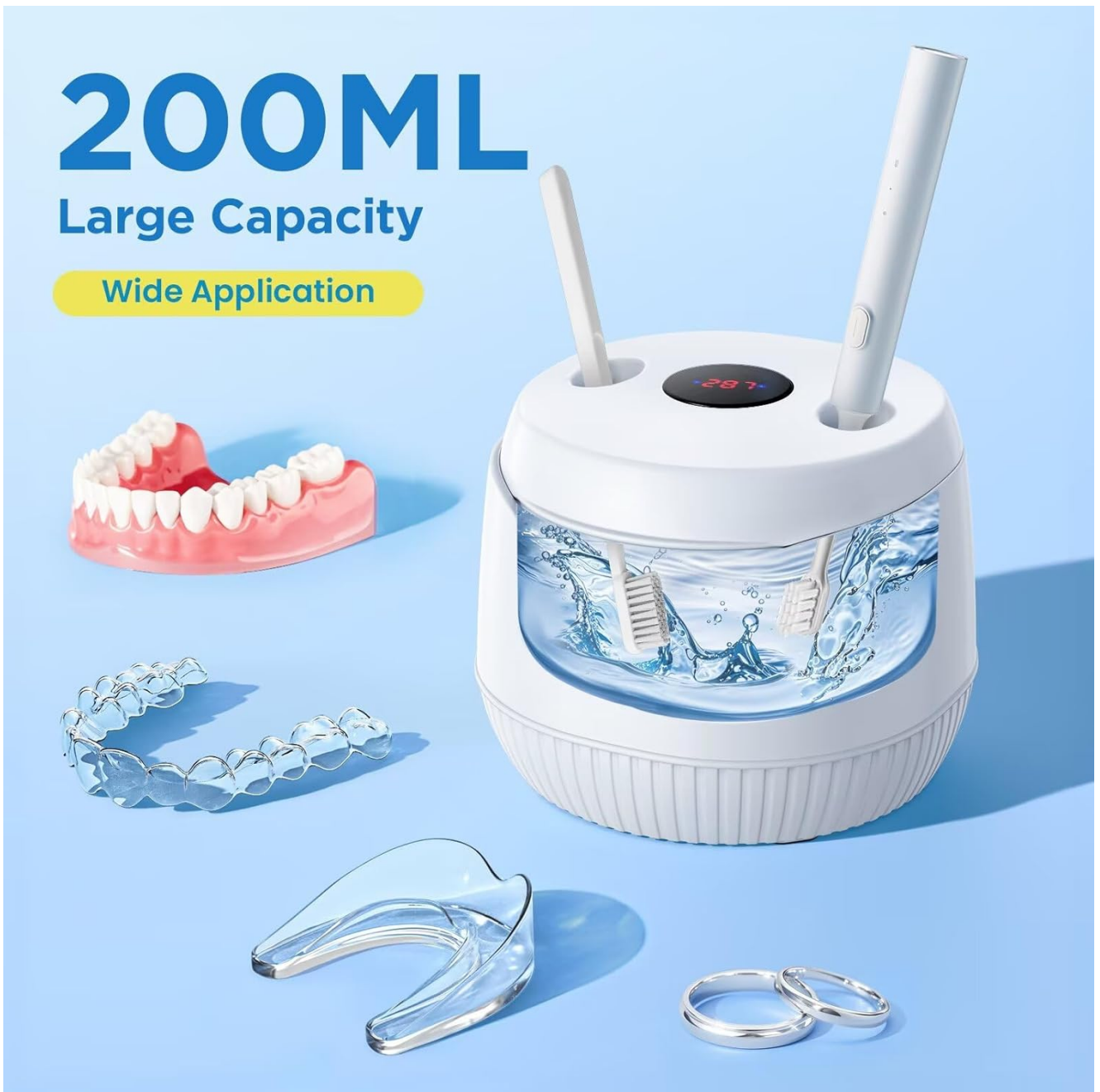
Image: The UEOFEN cleaner shown with various items it can clean, including dentures, retainers, and toothbrush heads, highlighting its versatility.