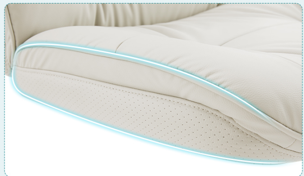
Thick & Comfortable Padded Thick padding for all-day comfort

Detailed view of the wide, deep seat and ergonomic back for enhanced comfort.