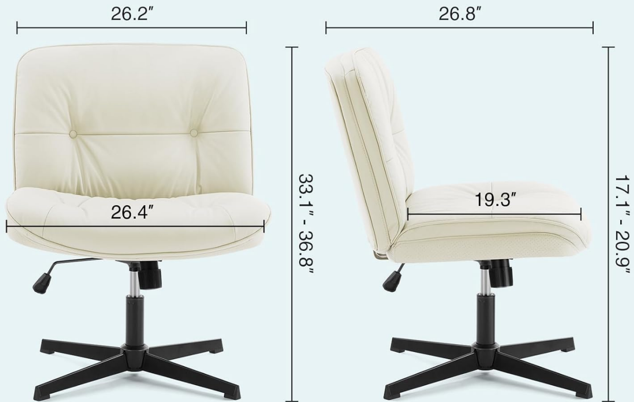
Product dimensions and weight capacity overview.