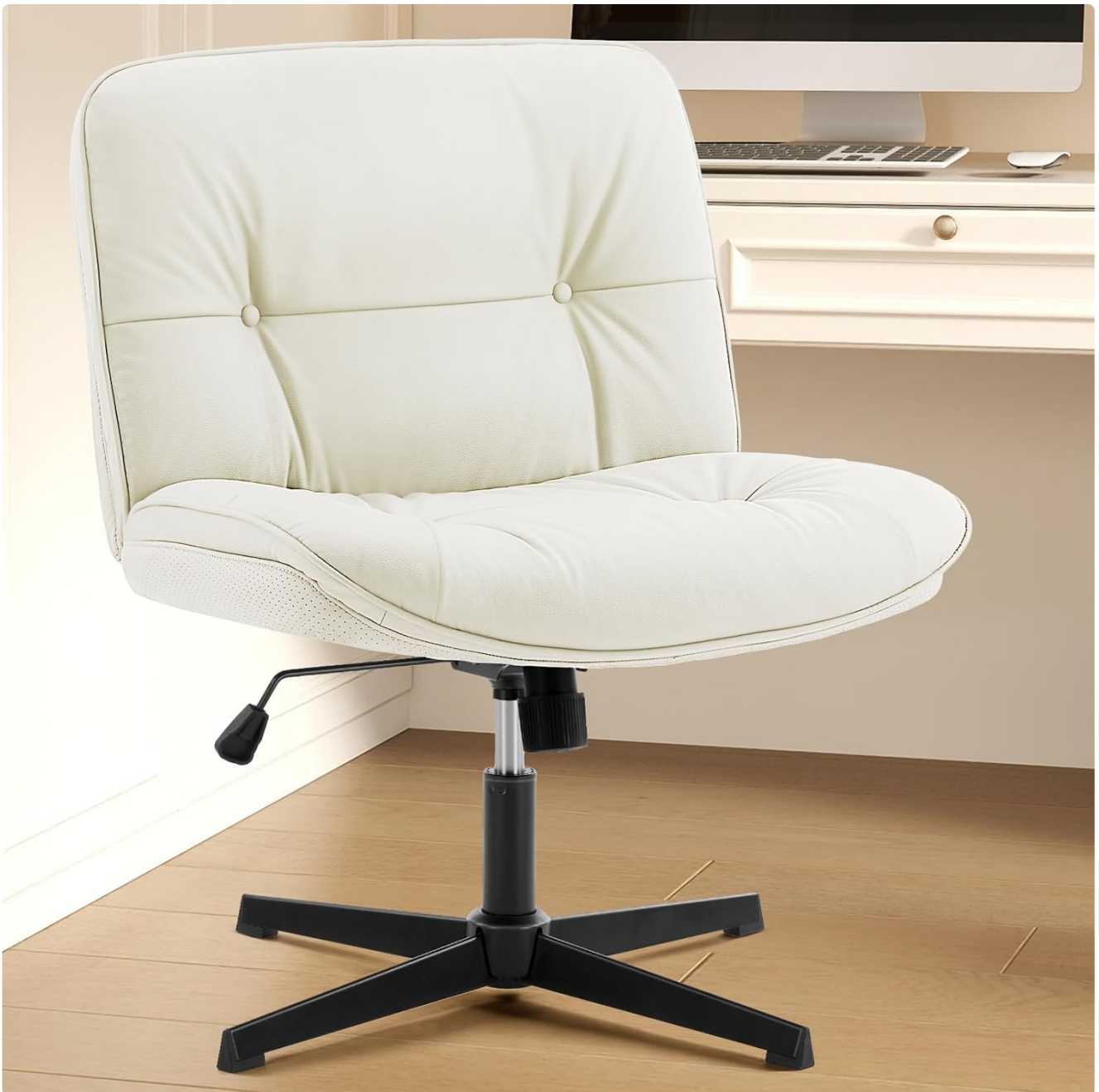
The OLIXIS Criss Cross Legged Chair, designed for comfort and style in various settings.