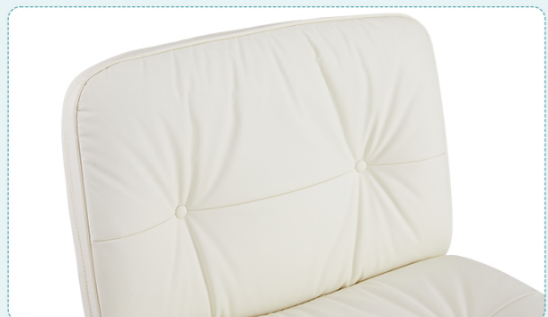
Ergonomic Back Turn on the Rocking mode to enjoy a cozy life

High-end design elements including soft faux leather and thick padding.