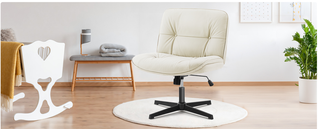
Key adjustable features and stable base design.