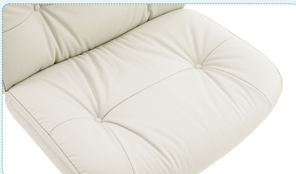
Wide & Deep Seat More seating space for extra comfort