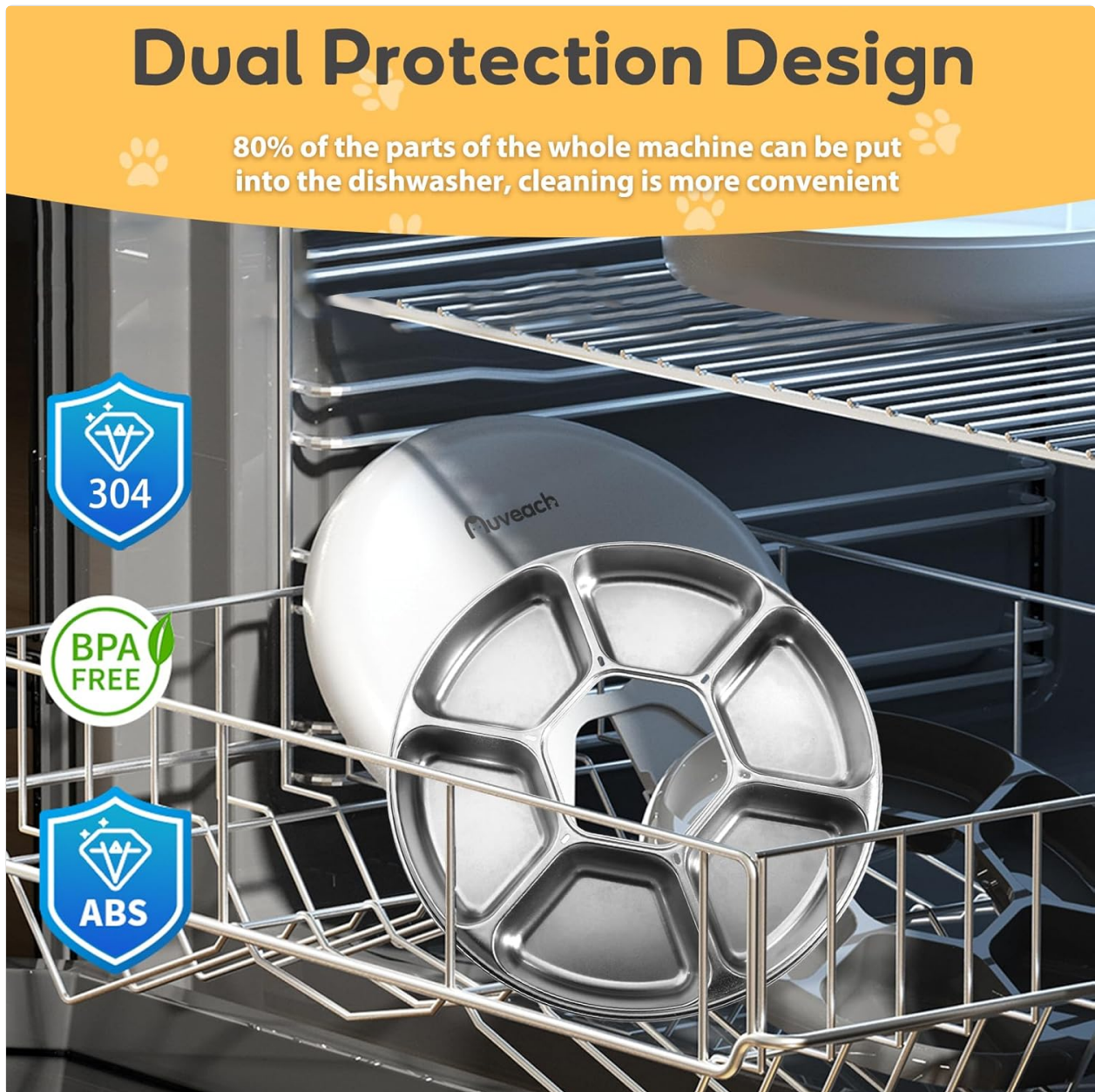
Image 7.1: The food tray and lid are dishwasher safe for easy cleaning.