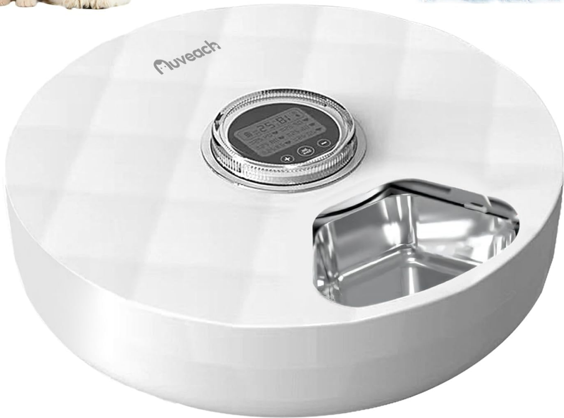
Image 1.1: Auveach Automatic Pet Feeder F19-L with two ice packs and pets.