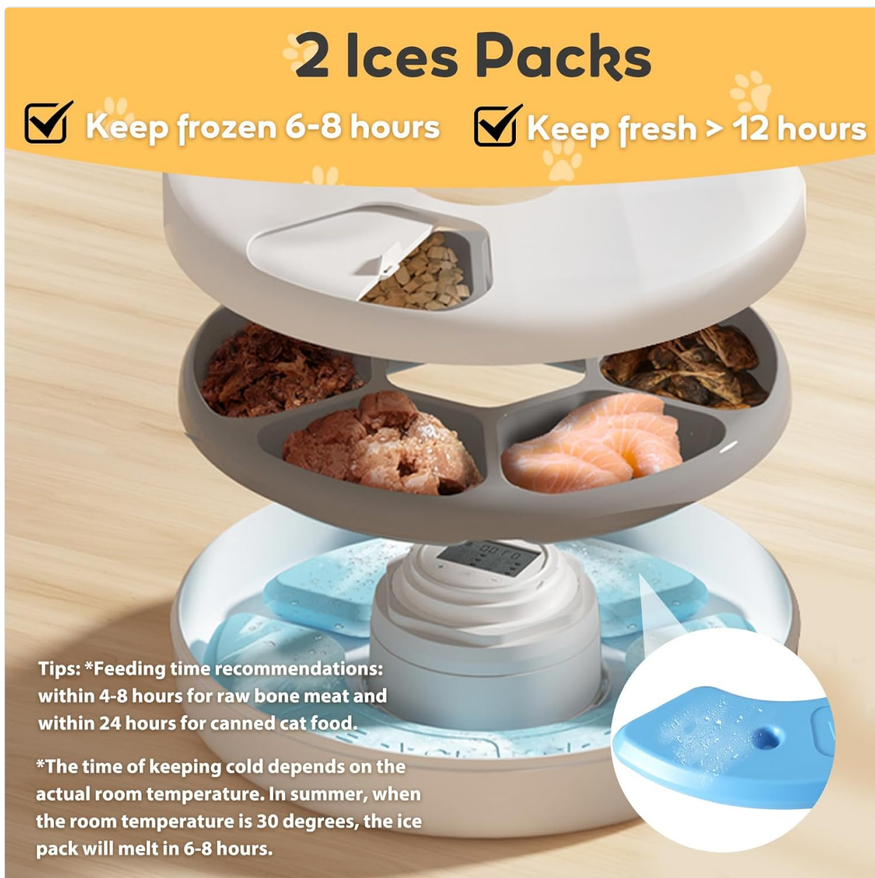
Image 5.1: The ice pack compartment, designed to keep food fresh for extended periods.